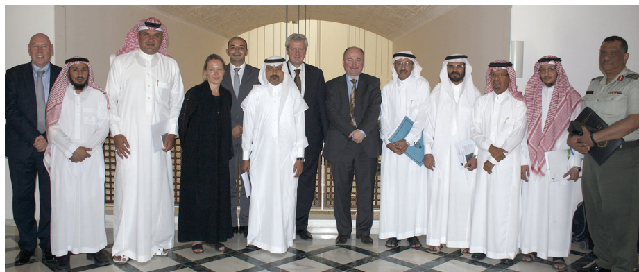
Meeting with the Saudi National Authority for Chemical and Biological Weapons. Riyadh, 14 July 2013