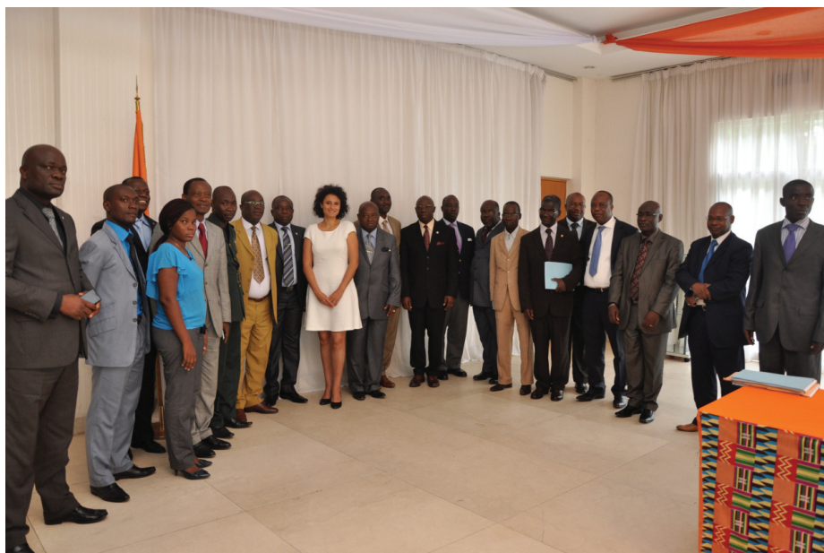
Bilateral meeting in Côte d'Ivoire, 9-11 July 2013, Abidjan

Project 33 "Strengthening the national CBRN legal framework and provision of specialised and technical training to enhance CBRN preparedness and response