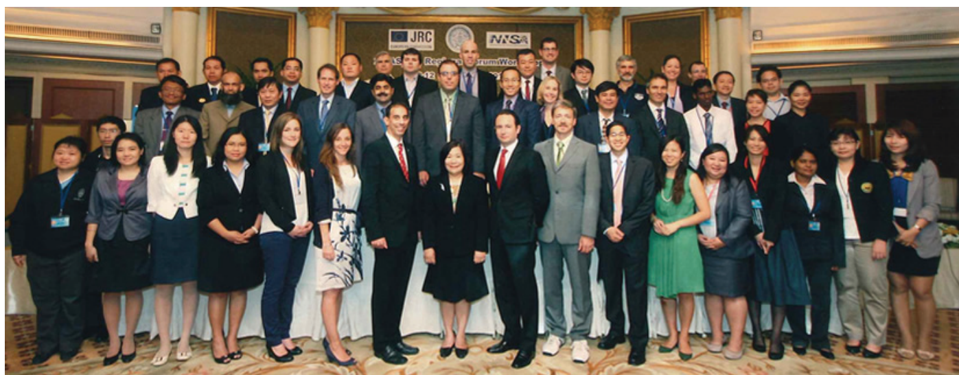
Participants at the Workshop on Enhancing Regional Capacity Building to Strengthen Nuclear Forensics, 10-12 September 2013, Thailand