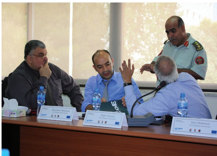
Discussions at the Second Round Table Meeting of the National Focal Points 24-25 June 2013, Amman