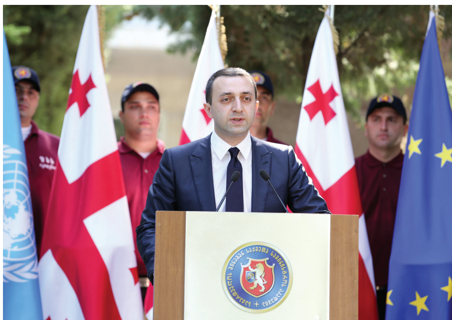
His Excellency Irakli Garibashvili, Minister of Internal Affairs of Georgia inaugurating the CBRN CoE Regional Secretariat in Tbilisi, 9 July 2013