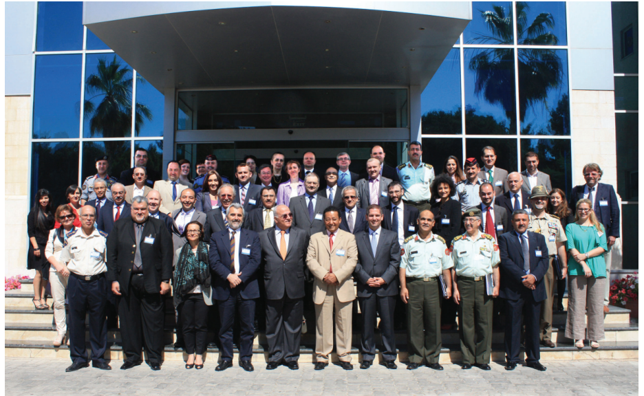
Participants at the official inauguration ceremony, 24 June 2013, Amman