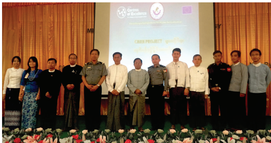
First meeting of the National CBRN Team of Myanmar, 3 July 2013