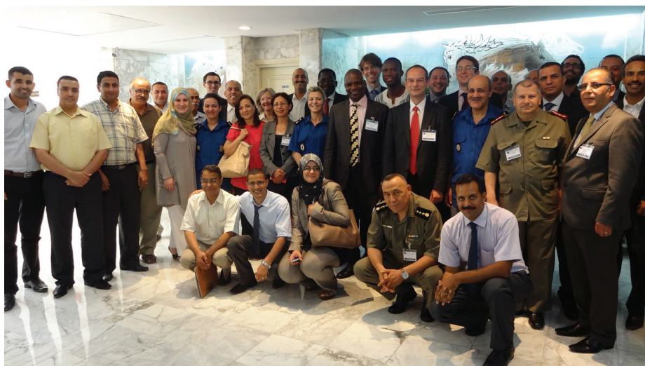
Participants à la table ronde des points focaux nationaux d'Afrique du Nord, 2-3 juillet 2013, Tunisie

Dans le cadre de l'Initiative des Centres d'Excellence de l'Union Européenne dont le but est d'atténuer les risques Chimiques, Biologiques, Radiologiques et Nucléaires (CBRN) et avec le soutien de la Direction Générale de la Douane Tunisienne, la deuxième table ronde des points focaux