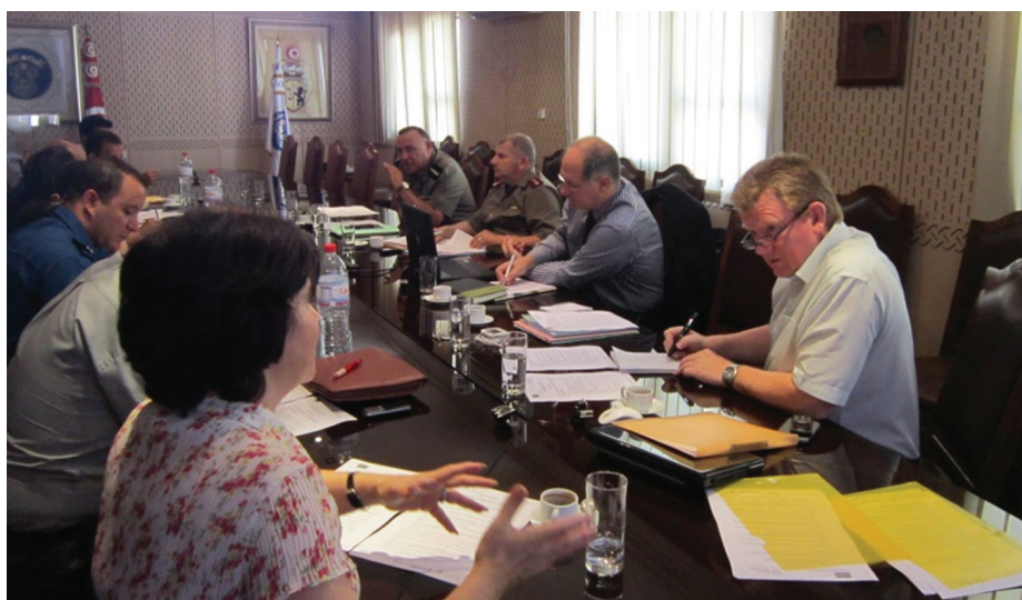
Project 23. Workshop with National CBRN Expert Team, 19-20 June 2013, Tunis, Tunisia

ing the security and safety of radioactive sources by encouraging the establishment of storage facilities and the completion of inventories. The project will disseminate best practices for the development of a national response plan for potential radio-nuclear events. The project is implemented in coordination with other activities in the region with careful attention being paid to avoid duplication with existing effort.