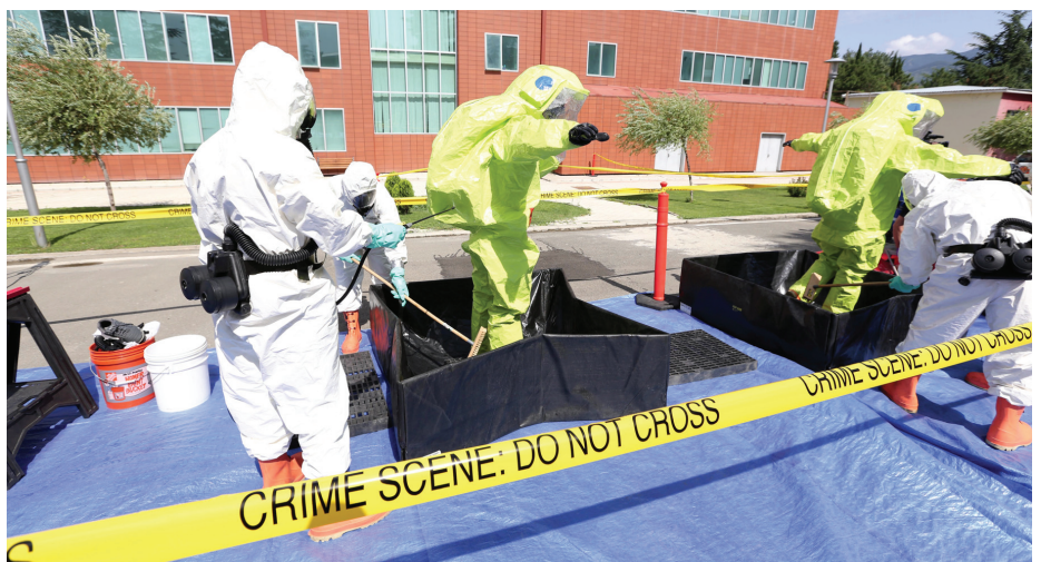
Demonstration of first response capabilities to a simulated CBRN event performed by the Emergency Management Department of the Ministry of Internal Affairs of Georgia

სამხრეთ-აღმოსავლეთ ევროპაში, სამხრეთ კავკასიაში, მოლდოვასა და უკრაინაში ევროკავშირის CBRN სამეცნიერო-ინოვაციური ცენტრების ინიციატივის ფარგლებში მიმდინარე საქმიანობის შედეგად 2013 წელს ევროკომისიამ დაიწყო თოთხმეტი პროექტი რომელთა მიზანი ამ სახელმწიფოების საჭიროებების დაკმაყოფილება იყო. მათ შორისაა, მაგალითად, პროექტები ისეთ სფეროებში, როგორიცაა ბიოუსაფრთხოება და ბიოუსიშიშროება, ცნობიერების ამაღლება ქიმიური, ბიოლოგიური, რადიოლოგიური და ბირთვული რისკის შემცირების კონცეფციის თაობაზე, ქიმიური უსაფრთხოება.