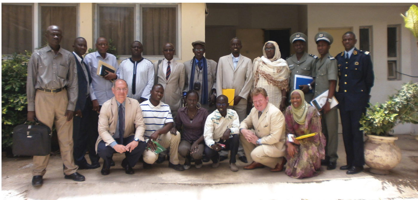
Project 23. Workshop with National CBRN Expert Team, 27-28 May 2013, Dakar, Senegal

Focuses on the South East Asia region involving Brunei Darussalam, Cambodia, Indonesia, Lao PDR, Malaysia, Myanmar, Philippines, Singapore, Thailand and Vietnam. This project aims at supporting the development of an integrated regional nuclear safety and security system. This will be achieved by assessing the status of laws and regulations in this field, improv-