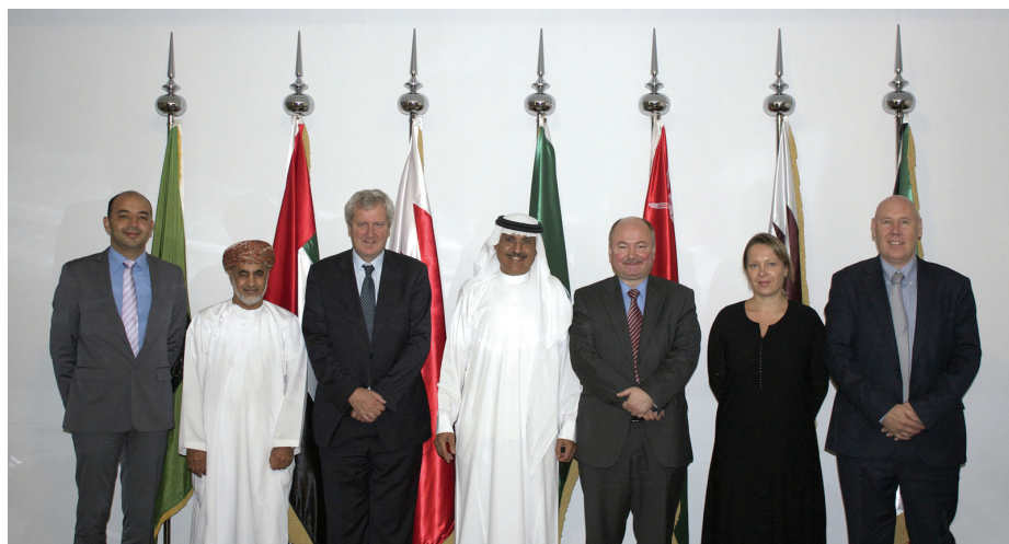
Meeting with the Cooperation Council of the Arab States of the Gulf. Riyadh, 15 July 2013