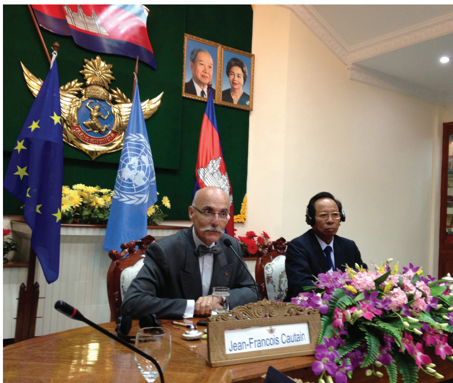
The European Union Ambassador to Cambodia, His Excellency Jean-François Cautain and the Minister of Defence of Cambodia, His Excellency Tea Banh closing the National Action Plan workshop in Cambodia

The workshop was part of a series of interrelated workshops to be held in Cambodia, with the aim of supporting the drafting of a National CBRN Action Plan by the country. This Action Plan will be designed to ensure that separate efforts are incorporated into one coherent approach, strengthening national CBRN capacities for prevention, detection, preparedness and response to CBRN threats.