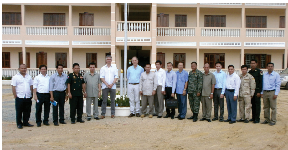
Project 23. Cambodia National CBRN Expert Team outside the Future Cambodian Institute for CBRN Research, May 2013

Activities for the upcoming months will consist of the assessment of the situation in the participating countries with respect to the laws and regulations on radiological and nuclear security, and the corresponding national strategy in place to combat illicit trafficking of radiological and nuclear material. This desk review will be further analysed at a regional workshop with the partner countries, during which findings will be completed and validated. The workshop will also lay down the basis for the subsequent steps to be taken in the project.