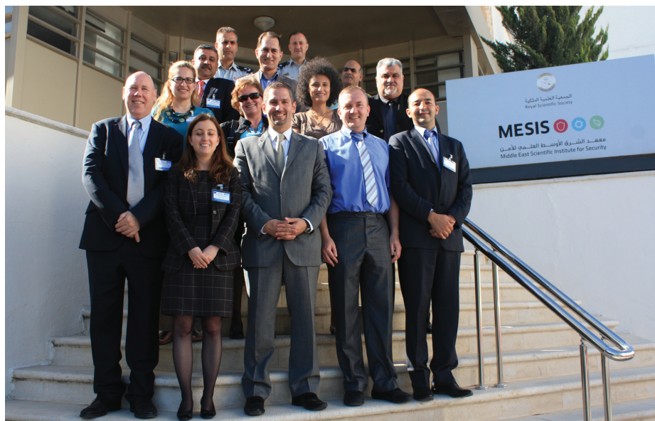
Second Round Table Meeting of the National Focal Points, 24-25 June 2013, Amman

In conjunction with the opening ceremony, the Regional Secretariat organised the second round table meeting of the National Focal Points. The meeting was an opportunity for the National Focal Points to exchange updates on the activities and information on immediate and mid-term needs in the region and to express their views on the implementation of the initiative. The meeting served for reviewing the progress of the ongoing CoE projects in the region, with several implementers (project 5, 18, 25, 26 and 32) participating in a dedi-