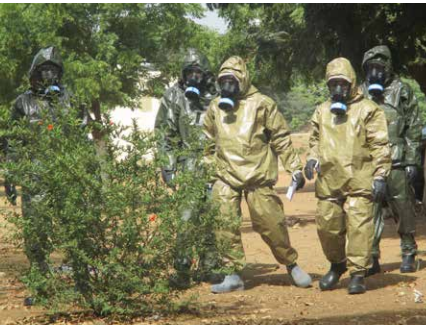
Trainees are often first responders including firefighters, police and emergency medical providers.