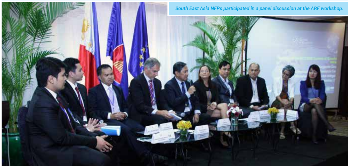
South East Asia NFPs participated in a panel discussion at the ARF workshop.

Regional Cooperation Officer for South-East Asia – Instrument contributing to Stability and Peace (European Commission, DG DEVCO), Delegation of the European Union to the Philippines