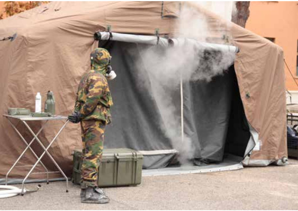
Chemical decontamination demonstration given by an Italian defence regiment.