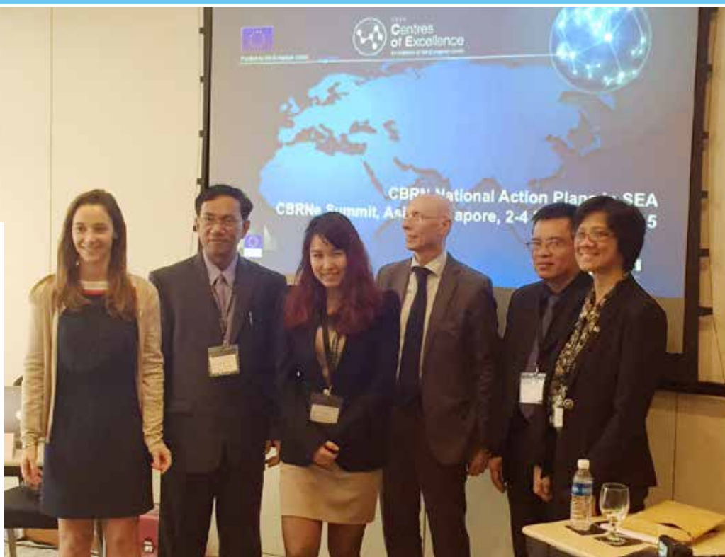
Workshop panellists at the CBRNe summit Asia. Singapore – 2-4 December 2015.

At this event, different governments, nations and international organisations' response to CBRNe and Weapons of Mass Destruction (WMD) threats were discussed. Trends and future threats were analysed in order to outline the peculiarities of new challenges that would characterise the industry in coming years. The event provided knowledge-sharing of specific systems and tools to combat WMD and CBRNe risks through presentations and practical demonstrations concerning the most modern research and technologies, carried out by major national and international sectorial companies. The first two days focused on the sharing of the current status, prospects and future developments in security and defence against unconven-