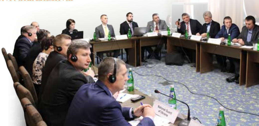
Ukraine's first CBRN stakeholders meeting. Kiev, 23 February 2016.

The UNICRI Regional Coordinator participated in the second Country Advisory Meeting within the framework of the EU-funded project Prevention, Preparedness and Response to Natural and Man-made Disasters in the EaP Countries (PPRD East 2) . The meeting brought together several Georgian institutions and agencies dealing with emergency management and disaster risk reduction, and was devoted to discussing further steps of the project's implementation in Georgia.