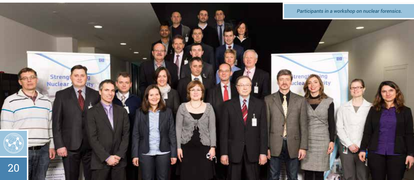
Participants in a workshop on nuclear forensics.

Over the last year, following data collection on national and international legislation, field missions have been