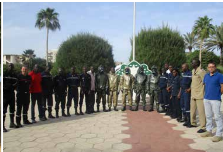
Participants gather as part of a CBRN response demonstration.

carried out in each country to address the legal framework component of the project. The data collected will be used to strengthen the national CBRN legal framework with a focus on developing a coordinated regional approach for strategic trade control, and will include a one-week study visit in Brussels, as well as regional seminars to be organised in the African Atlantic Façade and in the Eastern and Central Africa regions. Regarding the CBRN preparedness and response capabilities component of Project 33, 2015 has seen two national trainings held in each partner country. The main objective of the first session was to train commanders and to put an emphasis on risk analysis, decision making and inter-agency cooperation (between civil protection, firefighters, police, emergency medical services). The training proposed best practices through the presentation of case studies and exercises. From October 2015 to January 2016, a second training session was organised to train first responders likely to respond in the event of a CBRN incident, teaching them how to respond as part of a multi-agency team with priority given to preserving and protecting life as well as minimizing the impact of such an incident. The training was practical in nature, and featured demonstrations of CBRN kits and Personal Protective Equipment as well as outdoors exercises and simulations. Next year will be dedicated to drafting (or improving) National Emergency Plans to be evalu-