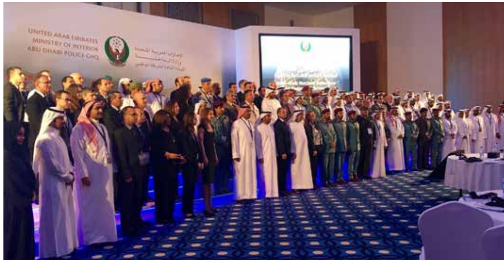
Participants at the FALCON Exercise. Abu Dhabi, 23-25 February 2016.

The core part of FALCON was a scenario based table-top exercise in which countries were confronted with nuclear security events that might be linked to an anticipated criminal or terrorist act. Participants discussed the scenario in breakout groups within their respective national teams: this ensured thorough, national-level discussions. Eight injects