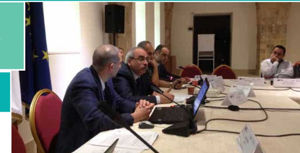
Lebanese National Team members discuss CBRN scenarios at the NAP workshop in Beirut, 8-9 September 2015.