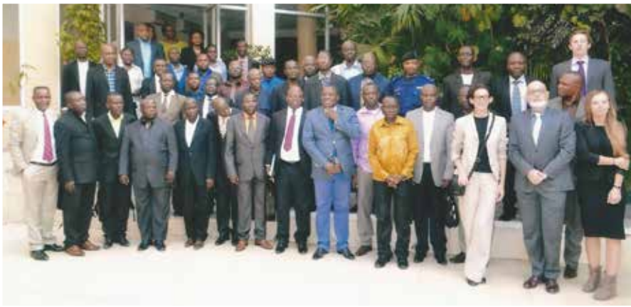
The Democratic Republic of the Congo holds its second National Action Plan workshop. Kinshasa, 30 September-2 October 2015.