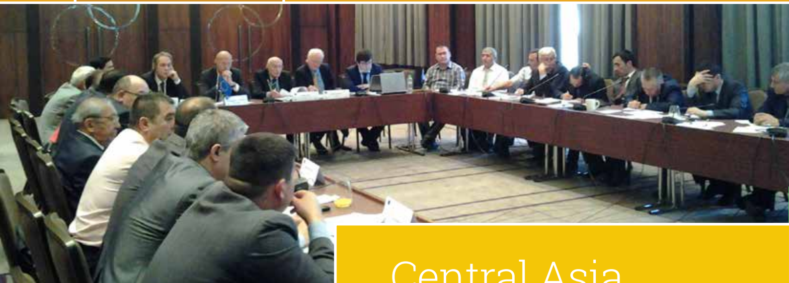
The National Team of Tajikistan meets to discuss first steps in drafting the National Action Plan. Dushanbe, 15-16 October 2015.