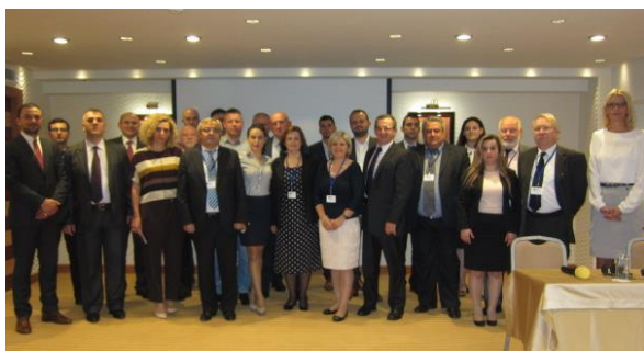
Group photo of the SEER Seminar on licensing topics

The consortium in charge of the EU P2P Export Control Programme on Dual-Use Goods carried out in Zagreb, Croatia, a regional event for South East Europe countries focused on licensing issues from 31 May to 3 of June 2016.