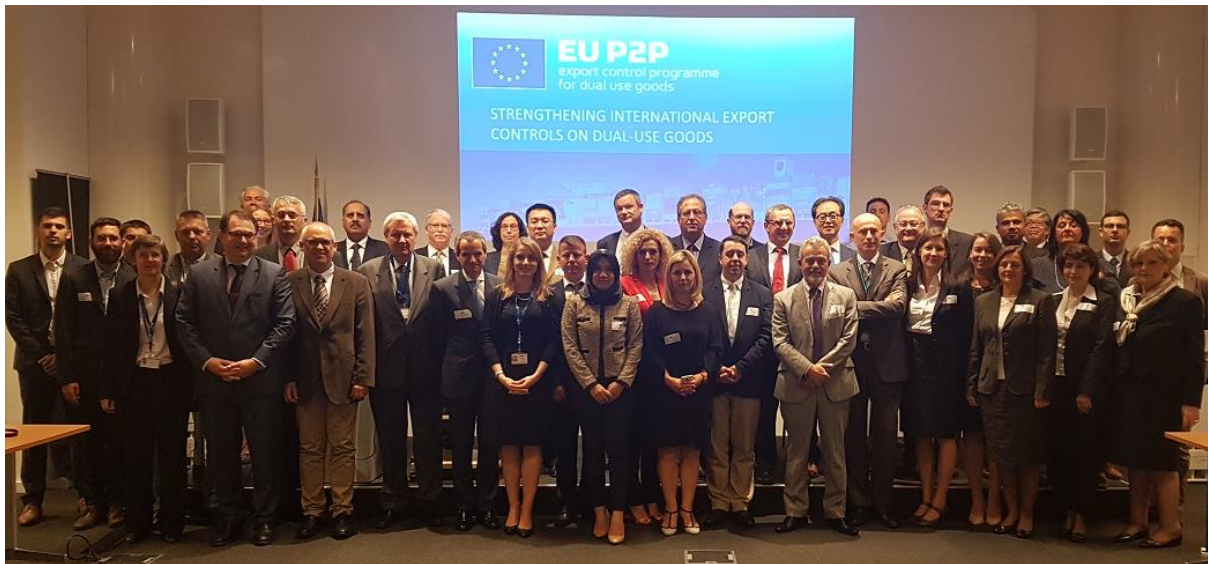
Brussels, 30 June - 1 July 2016

On 30 June and 1 July, the European Commission in partnership with King's College London in the framework of the EU P2P Programme on Dual-use Goods, hosted a technical dialogue between both Non-Members and Members of the Export Control Regimes on export control governance. It brought together around 60 participants from a wide range of backgrounds including senior officials from China, India, Pakistan and other EU P2P partner countries in South East Europe and Asia – including many that are not members of all four multilateral export control regimes (Australia Group, Missile Technology Control Regime, Nuclear Suppliers Group and Wassenaar Arrangement). These export control regimes were formally represented at the event.