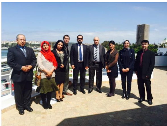
Group picture of the EU P2P dual-use training event for Morocco

international standards, with the support of the European Union.