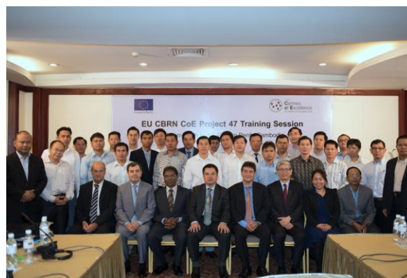
Participants (Deputy Secretary General of the NACW - at the center)

The training session programme, derived from the agreed Roadmap discussed with the NACW and other Ministries/Agencies during the initial visit (March 2016), had been developed with a view to address as an introduction all aspects of a consistent and comprehensive Strategic Trade Control System (STC): from the why, what, who and how to establish, implement and enforce an effective STCS. The session concluded with the former Strategic Trade Controller of Malaysia, sharing his national experience. Participants at the meeting raised many relevant questions demonstrating their genuine interest in the subject.