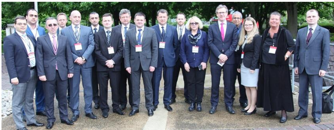
Group Picture at the COARM Study Visit to the UK in May 2016

After the lunch break the participants were given a very special case study. They were asked to put themselves in the role of arms smugglers and come up with various strategies for