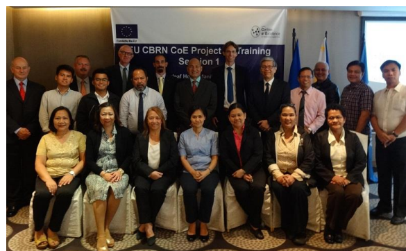
Group picture of the EU P2P dual-use training event in Philippines

The next round of training between the EUP2P programme and the Philippines will take place in September.