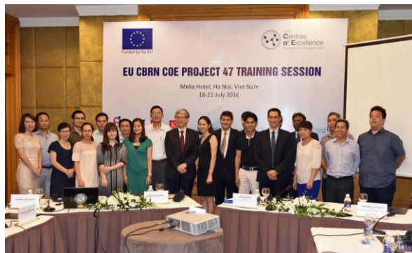
Participants (Deputy Director General of Vietnam Customs at the center)

Within the framework of the EU P2P Export Control Project on Dual-Use Goods a team of experts conducted an awareness-raising training session in Hanoi (18-22 July) for representatives of Vietnam's national authorities who are, or might become, involved in the future development of their national Strategic Trade Control System.