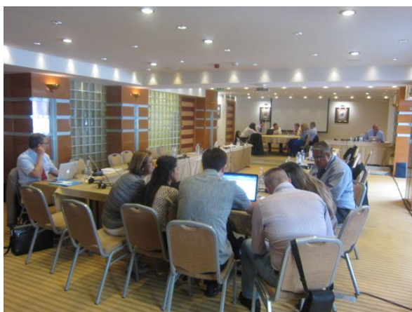
SEER Seminar on licensing topics working group exercises

Closing remarks were made by the institutional counsellor of the EU P2P Programme, joined by a representative from the US Export Control and Related Border Security (EXBS).