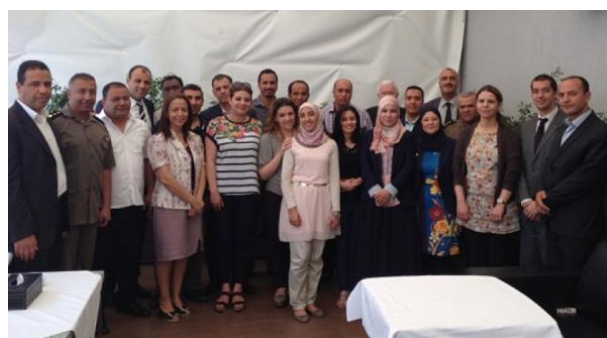
Group picture of the EU P2P dual-use training event in Tunisia

the specific needs of the Tunisian stakeholders and presented during the event on: the dual-use goods trade controls and the non proliferation of weapons of mass destruction, modern trends and methods in illicit trade, control lists, "catch-all" mechanisms, the industry's internal compliance programmes, industry's engagement. In view of the security challenges the region faces and the projects of Tunisia to reinforce its national capacities for controlling the international trade of these sensitive goods, the workshop was important and well timed.