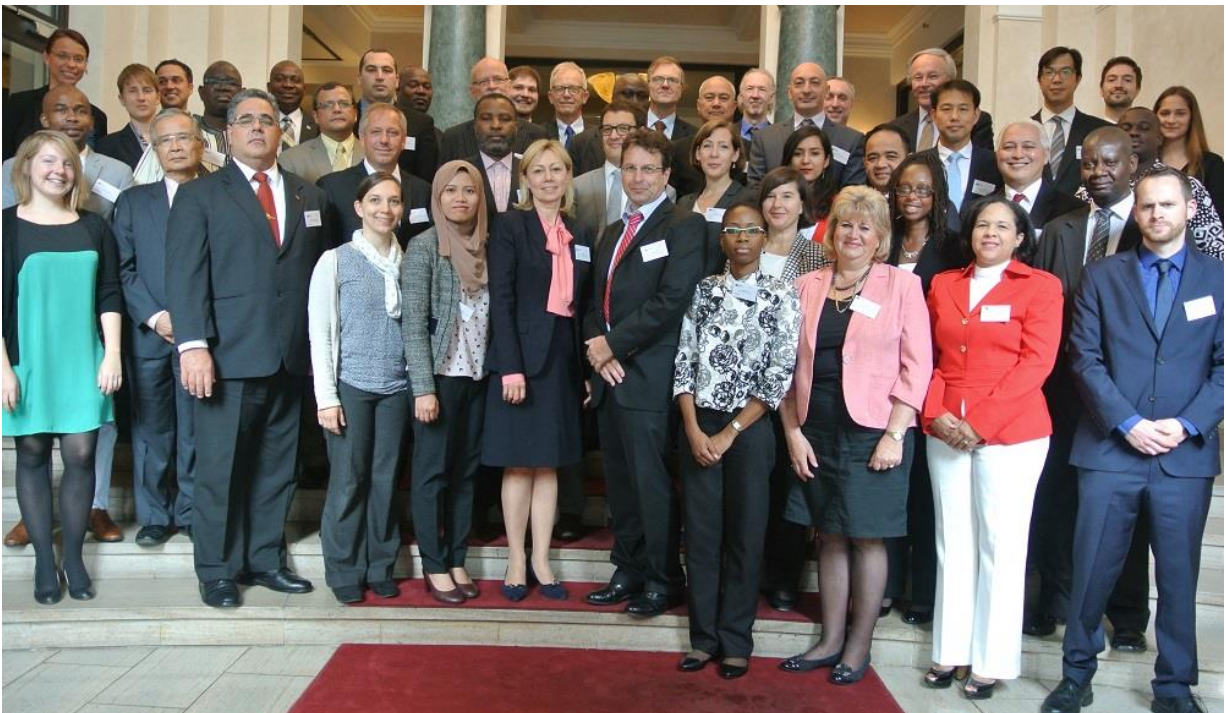
Group Picture at the ATT-OP Experts Meeting in Frankfurt in June 2016

controlled transfers, record keeping and reporting and diversion. Additionally, participants discussed a review of the lessons learnt after more than two years of implementing the project by pointing out results and challenges of core elements of ATT-OP. Regarding the pool of experts, the need for the pool to cover the full scope of a national arms transfer control system and the importance of the participation of experts from countries that have recently successfully developed national arms transfer control systems was highlighted with the result of expanding the pool beyond classic export control assistance. Speakers identified the challenge of the relatively low profile of the Treaty outside the export control