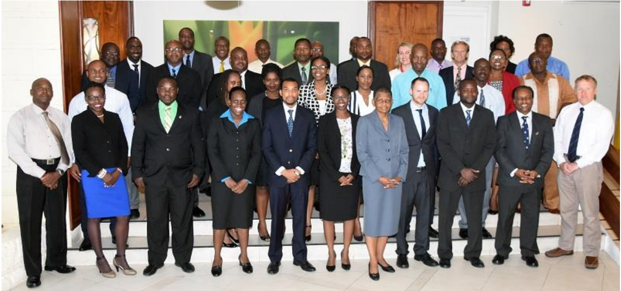
Group Picture at the ATT-OP Ad-hoc Seminar for Barbados in June 2016

The second day started off with an extensive session on physical security and stockpile management. After lunch, participants and experts discussed the record keeping and reporting requirements for ATT State Parties as well as how information gathering for the reporting authority can be facilitated. The last session was dedicated to the CARICOM model law for the Caribbean established by the regional organisation CARICOM IMPACS. Discussions arose on how the law could be applicable for Barbados and which persons should be the ATT focal points in the various authorities.