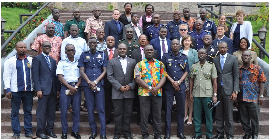
Group Picture at the ATT-OP Roadmap Activity II for Ghana in July 2016

The last session of the seminar was dedicated to enforcement issues and the roles of the different authorities in the enforcement process e.g. when it comes to the identification and