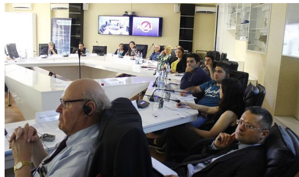
Georgia - EU P2P dual-use training event during a lecture

and the support for free trade on the other hand.