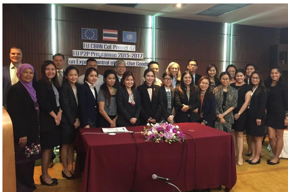
Group picture of the EU P2P dual-use training event in Thailand

export control programme for dual use goods