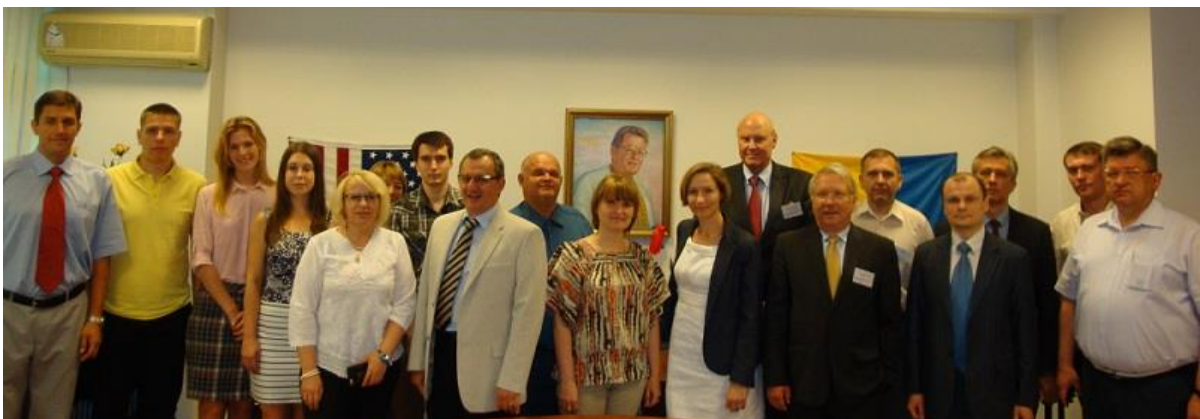
Group picture of the EU P2P dual-use training event in Ukraine

Participants from 7 Ukrainian State bodies attended the Seminar. They were representing