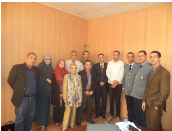
Group picture of the EU P2P dual-use training event for Algeria

Algerian authorities in charge of managing risks associated with strategic CBRN export, import and trading controls were represented and actively participated in the lectures and exercises proposed by the European trainers. The Algerian partners expressed their will to promote at the national level the importance of effective controls on the trade of dual-use items for ensuring national regional and international security and to continue working with the European Union to this end.