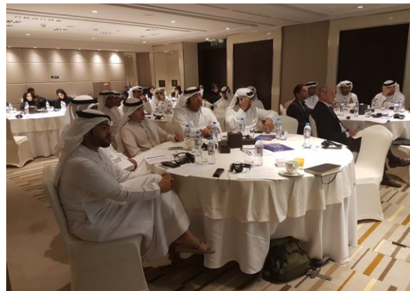
Lecture during UAE training event