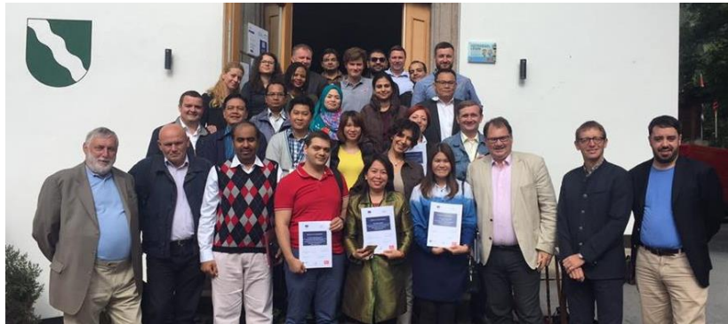
Group photo with students holding EU Certificate on Strategic Trade Control and Non-Proliferation