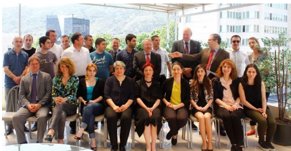
Group picture of the EU P2P dual-use training event in Georgia

The first seminar of the EU P2P Export Control Project for dual-use goods took place in Tbilisi on June 14-16, 2016. The seminar was arranged at the premises of the Georgian Revenue Service. In total 17 civil servants from Customs participated. The customs officers came from different border crossings and are working as front personnel or as coordinators of special groups of customs officers.