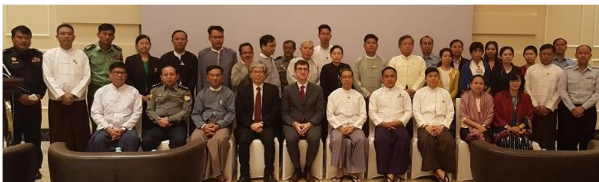
Group picture of the EU P2P dual-use training event in Myanmar