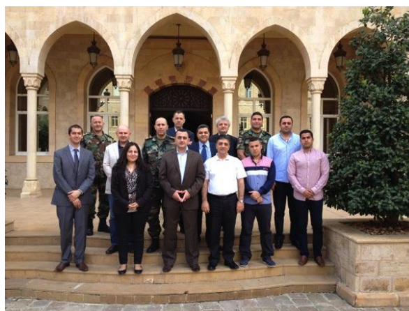
Group picture of the first EU P2P dual-use training event for Lebanon

Most Lebanese authorities in charge of managing risks associated with CBRN export, import and trading controls were represented and actively participated in the lectures and exercises proposed by the European trainers. The Lebanese partners reiterated their commitment to reinforce, with the support of the European Union, their national capacities for effective controls on the trade of dual-use items.