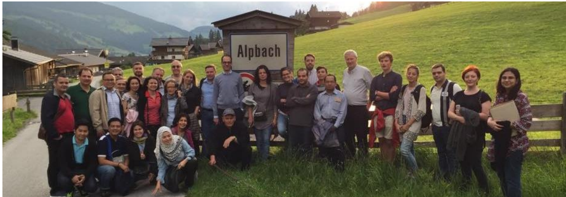
Group photo in front of Alpbach road sign.