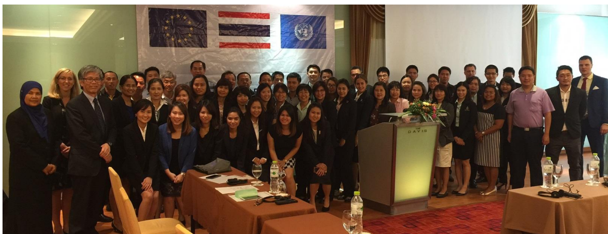
Group Picture – Department of Foreign Trade & Customs