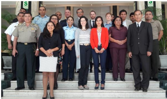
Group Picture at the ATT-OP Roadmap Activity II for Peru in May 2016

On 12-13 May 2016 the Second Roadmap Activity for Peru took place within the framework of the EU P2P ATT Project. Based on the needs assessment and jointly developed roadmap, two parallel workshops took place in Lima: an "Arms Identification and Stockpile Management Training and Assessment Visit" as well as an "ATT Licensing Workshop – Control List and Licensing Structures."