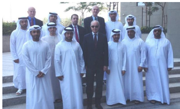
Group picture of the first EU P2P dual-use training event for UAE

Most UAE authorities in charge of CBRN export and import controls, as well as those in charge of monitoring and regulating financial flows emanating from such activities, were present and actively participated to the lectures and exercises proposed by the European trainers. The UAE, as well as many other countries around the world, have adopted the European Union's list of dual-use goods as a reference.