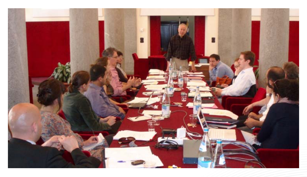
CBRN Governance Workshop. Turin, 18 April 2011

17-20 May 2011. INTERPOL Global Radiological and Nuclear Terrorism Pre-