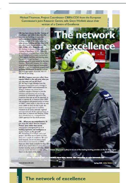
CBRNe World Magazine - Spring 2011