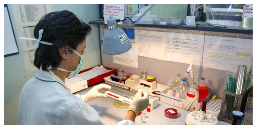
Bio-safety, bio-security and laboratory management systems are examples of the CBRN CoE fields of concern

The selected projects are in the area of illicit trafficking, bio-safety/bio-security, first response, the misuse of biotechnology, CBRN national legal framework, e-learning on CBRN risk mitigation, public and infrastructure protection, awareness rising on CBRN threats, CB waste management, border control and CBRN import/export.