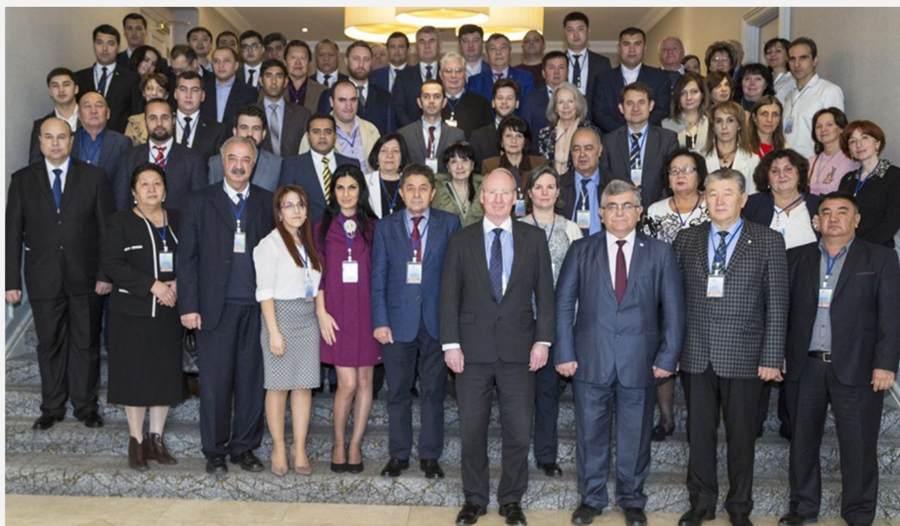
Third Seminar on the "Export Control of Dual-use Materials and Technologies group picture

academics; and various forms of train-the-trainer scenarios to leverage dissemination and impact of education and outreach efforts.