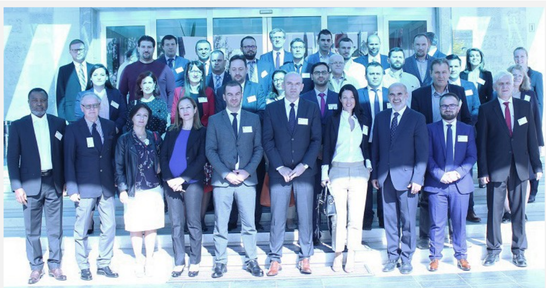
Regional Workshop on Arms Export Controls for South-East Europe group picture