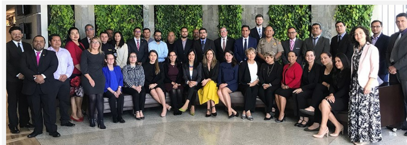
Second Roadmap Activity for Costa Rica group picture

Achievements in establishing a national control system in Costa Rica and the exchange of information between Costa Rica and another Roadmap country in the region,