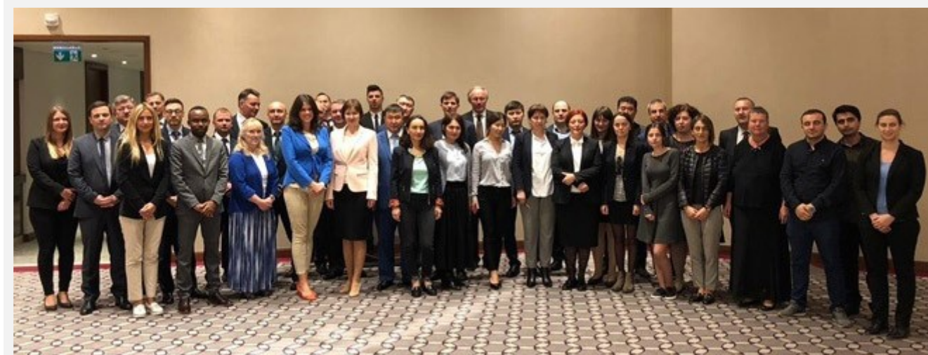
Third Roadmap Activity for Georgia group picture

for Georgia within the EU ATT OP II took place in Tbilisi, Georgia.