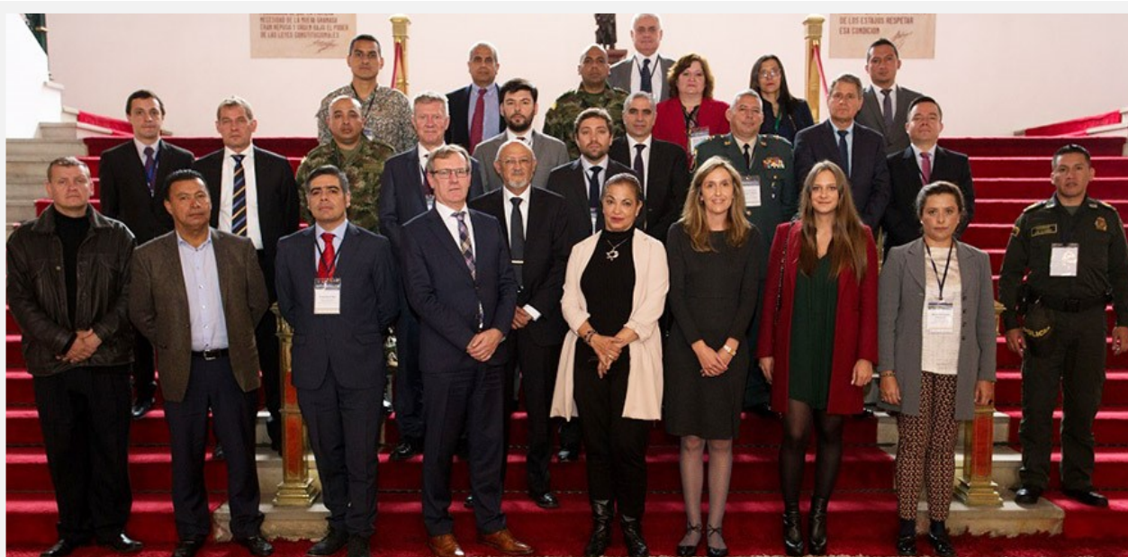
Second Roadmap Activity for Colombia group picture

This two-day workshop offered an analysis of methods that contribute to improving risk assessment capabilities concerning arms transfers. In addition, best practices to address the risk of diversion under different operations while transferring arms (transit, transshipment