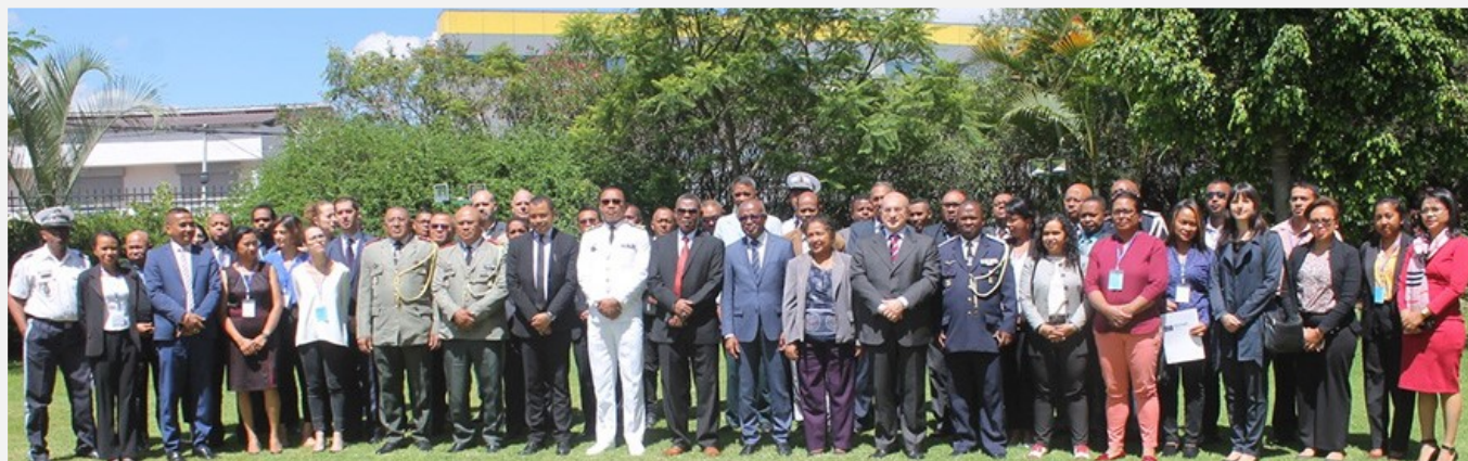
Ad Hoc Activity for Madagascar group picture

Following the ratification of the Arms Trade Treaty by the Republic of Madagascar in 2016, the Government took the decision to modernise the national legal framework in order to transpose existing international good practices in the control of the arms trade. The Ministry of National Defence initiated the amendment process by setting up a group of experts to prepare a draft law, in collaboration with the EU's Arms Trade Treaty Outreach Programme, implemented by Expertise France and BAFA .