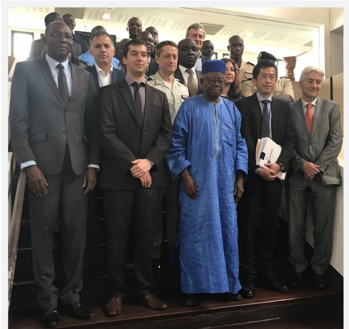
Cooperation Activity on the Legal Transposition of the Arms Trade Treaty for Togo group picture

On 6-7 February 2019, an ad hoc Workshop under the