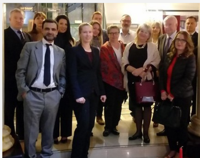
Individual Assistance Workshop for Serbia group picture

were addressed, looking at the example of how these types of licences are anchored in the legislation and applied in the daily licensing practice in some EU Member States.