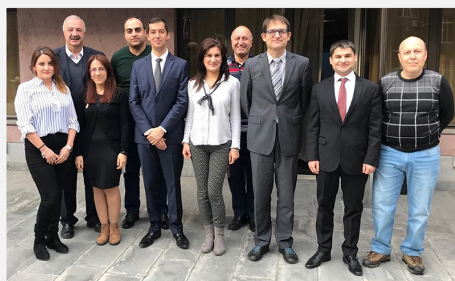
Legal Workshop for Armenia group picture