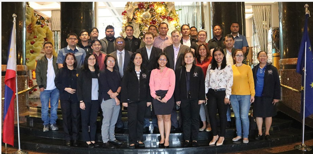
Advanced Enforcement Training for Philippines Customs group picture

CoE Initiative, the EU P2P Programme for Dual-Use Goods organised a twofold "Industry Engagement Event" in Vientiane, Lao PDR on 17 - 18 December, 2018. The Industry Engagement event is a meeting between EU industry experts and the Laotian authority who leads the process of adopting and implementing legislation on dual-use export controls, as well as representatives from national industry with a view to sharing experiences and best practices and industry norms concerning the adoption, implementation and enforcement of strategic trade controls on dual-use goods. Two industry experts from two leading European multinational companies and one expert from the EU P2P programme participated in this event.