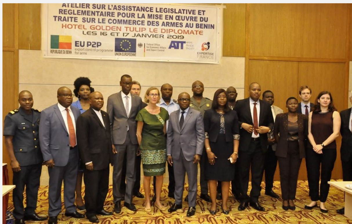
Legislative and Regulatory Assistance Workshop for Benin group picture

On 23 – 24 January 2019, the Third Roadmap Activity