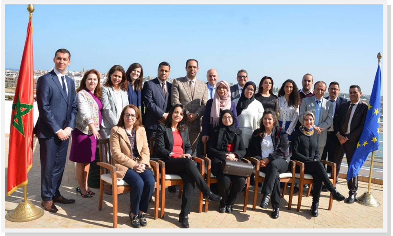
Legal Workshop for Morocco group picture

On 18 - 19 September 2018, the third workshop on “the legal framework of dual-use trade controls in Lao PDR and its perspectives” was organized in Vientiane, Lao People’s Democratic Republic.