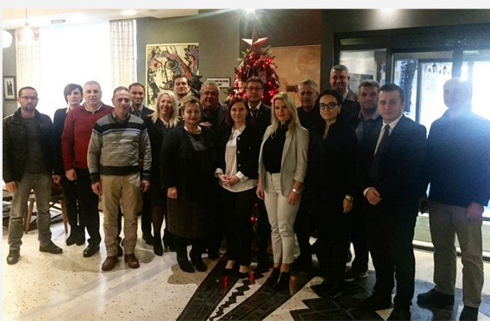
Training on Licensing for North Macedonia group picture