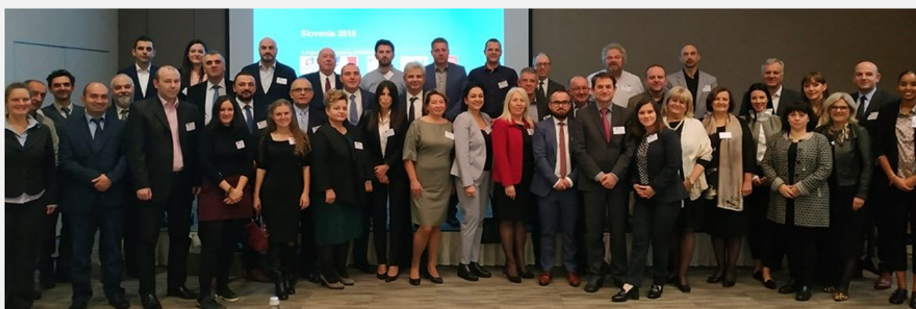
Regional Workshops for South East Europe on Institutional Memory and Train-the-Trainer concepts group picture

The first regional seminar for South East Europe