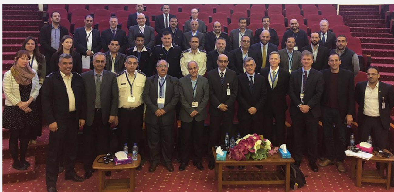
Enforcement workshop for Jordan group picture

The over 100 participants from Kazakhstan, Kyrgyzstan, Tajikistan, Turkmenistan, Armenia, Georgia, Afghani-