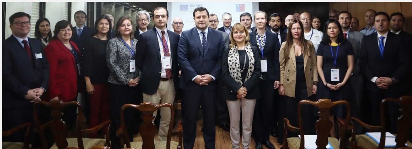
Ad-hoc Activity for Chile group picture

ly in the premises of the local authorities. This particular format ensured that targeted support could be provided to the key personnel of the main Chilean agencies involved in the implementation of the ATT.