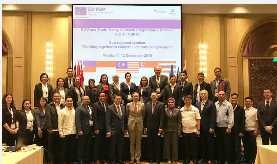
First Sub-Regional Seminar in the Philippines group picture

The seminar was fruitful as it allowed the participants to exchange good practices from their national control