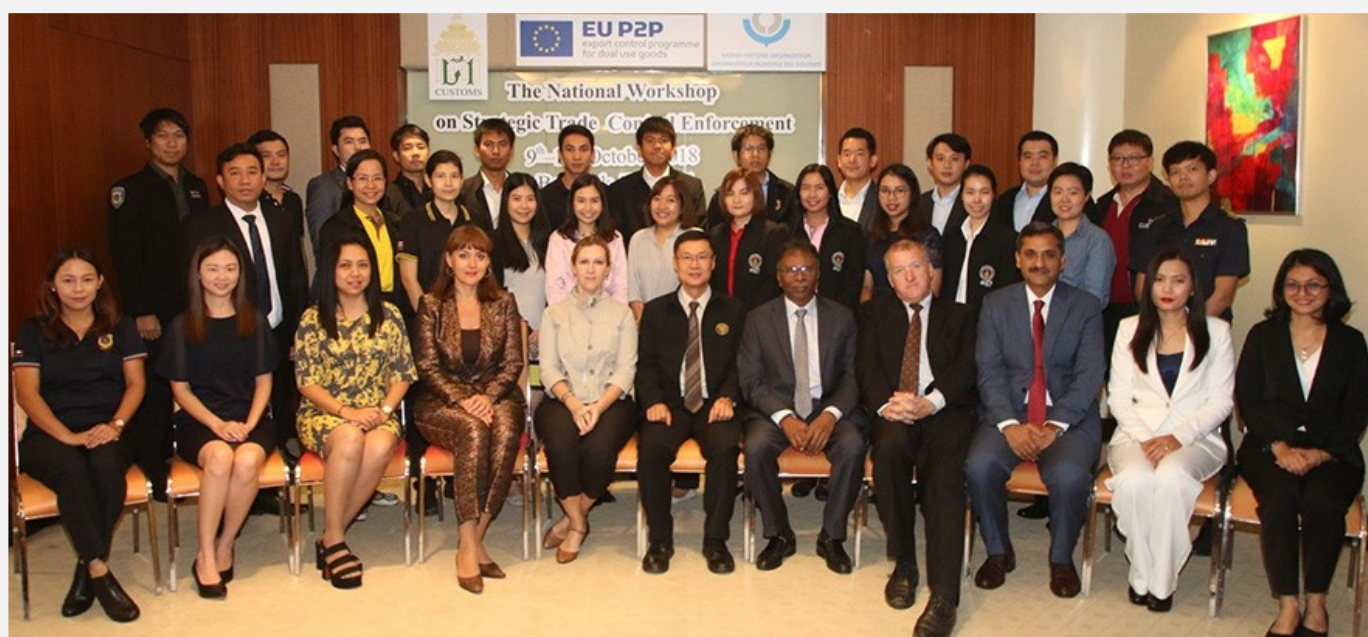
Workshop on Strategic Trade Control Enforcement for Thailand group picture

Thailand has already adopted a draft legislation on dual-