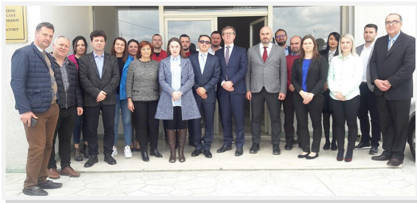
Individual Assistance Workshop for Albania group picture

representative from the General Directorate of Customs in Albania. The workshop day focused mainly on the control list and commodity identification as well as transit and transshipment. In this regard, the updates of the EU Common Military List were presented.