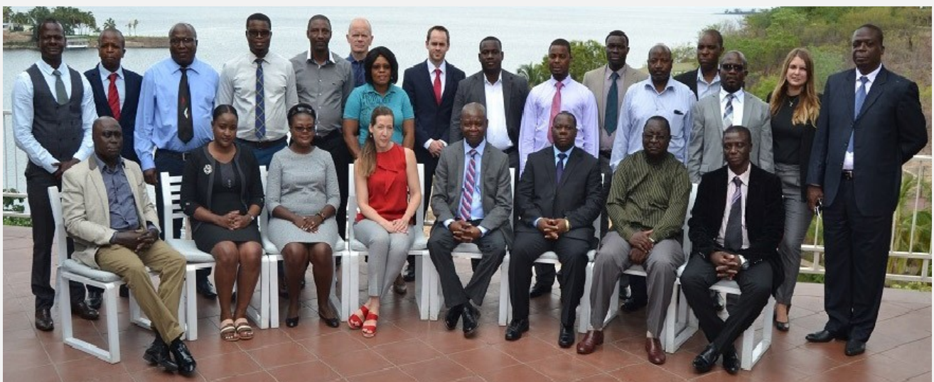
Second Roadmap Activity for Zambia group picture

The event kicked-off with discussions on the state of the art of the national legislation and the control list,