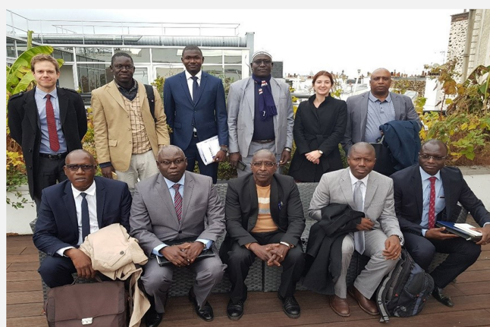
Study Visit to Paris for Senegal group picture