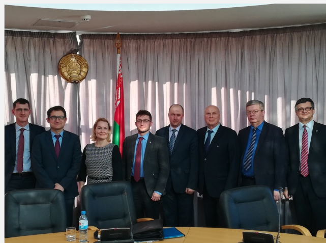
Initial Visit in Belarus group picture

On 18 February, 2019, members of the Project Management Team of the consortium implementing the EU P2P Programme on Dual-Use Goods and representatives of the Delegation of the EU to the Republic of Belarus conducted their first visit in Belarus. Substantial and constructive discussions took place with the participation of