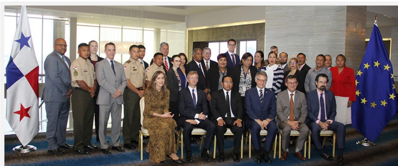
Ad Hoc Workshop for Panama group picture

This second ad-hoc activity was organised in the form of two separate workshop days, with each one addressing a different target audience. Both days were held direct-