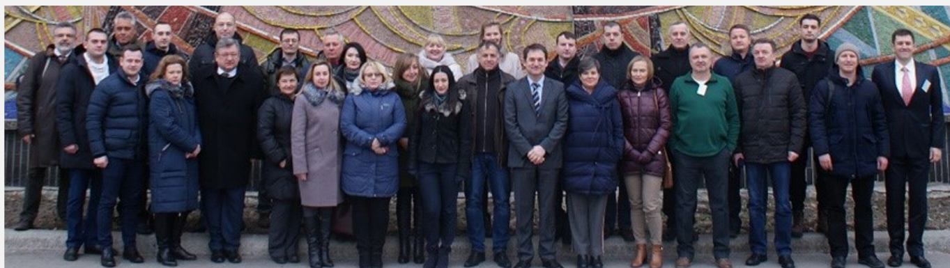
Advanced Training on Customs Issues for Ukraine group picture