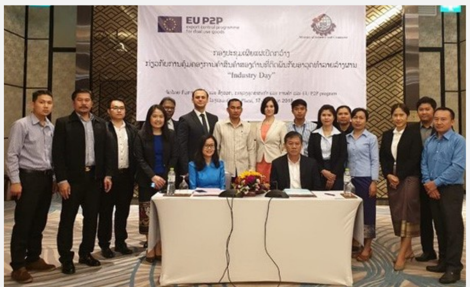
Industry Engagement Event for Lao PDR group picture