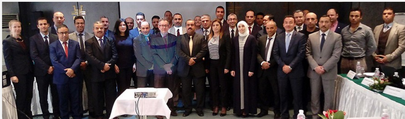
Regional Workshop in Tunisia group picture