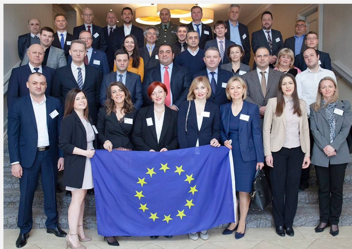
Regional Workshop in Armenia group picture