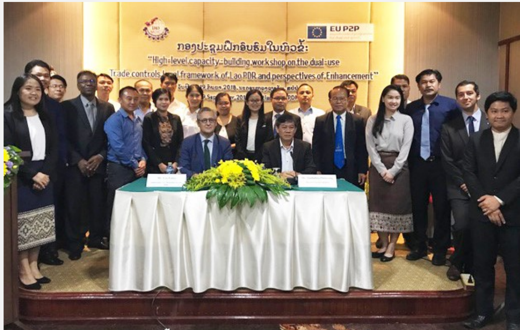
Legal Workshop for Lao PDR group picture