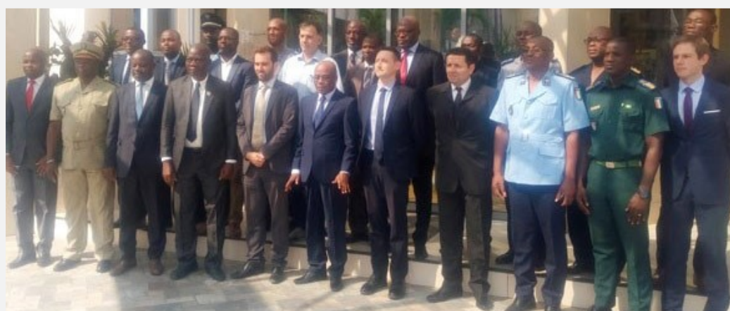
Interagency exercise for Ivory Coast group picture