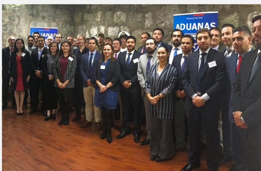
Ad-hoc Activity for Chile group picture