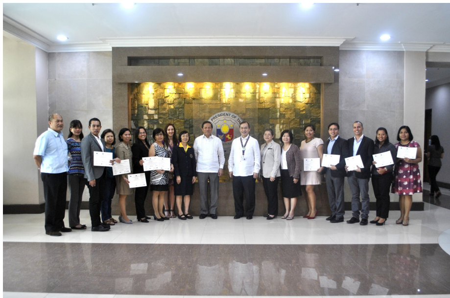
Project 7 award ceremony at the Presidential palace. Manila, the Philippines.

From 16-30 June implementers of Project 7 organised a workshop in Manila and Muntinlupa City, Philippines. The object was to assist medical laboratories to become compliant with ISO standards and Biorisk Management Systems. These standards provide recommendations and advice regarding medical laboratory