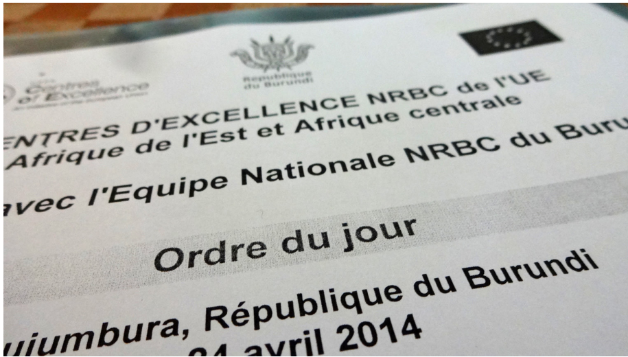
Announcement of bilateral meeting in Burundi.