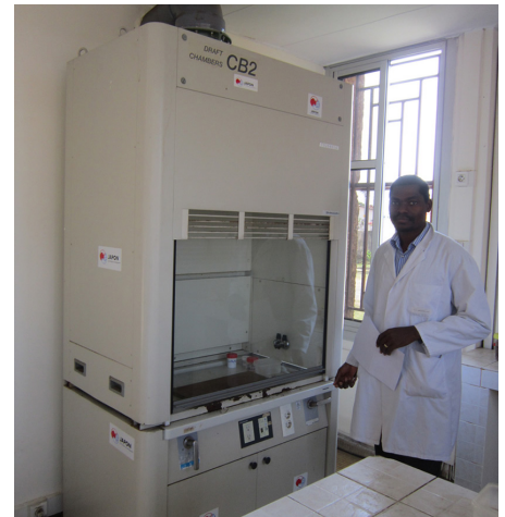
Project 35: visit of laboratory facilities in Gabon.

From 26-28 May, the implementers met in Beirut and Amman the representatives of Lebanon, Jordan and Iraq involved in the project to present the work packages and to adapt the actions to the needs of each