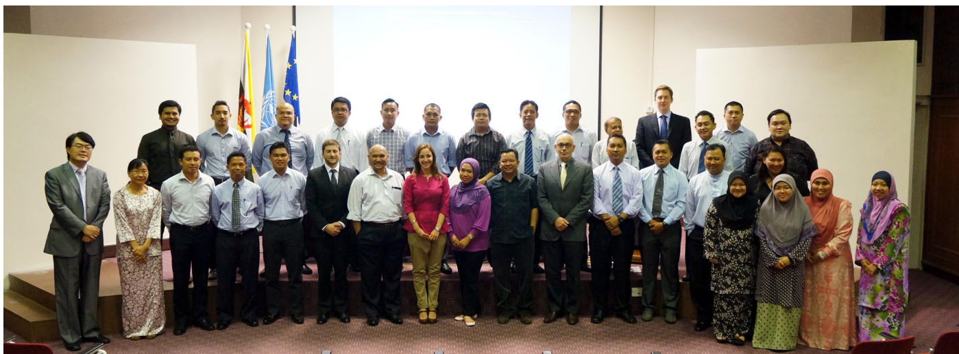
NAP Workshop in Brunei-Darussalam.