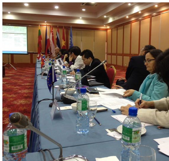
Round Table Meeting in Brunei Darussalam.