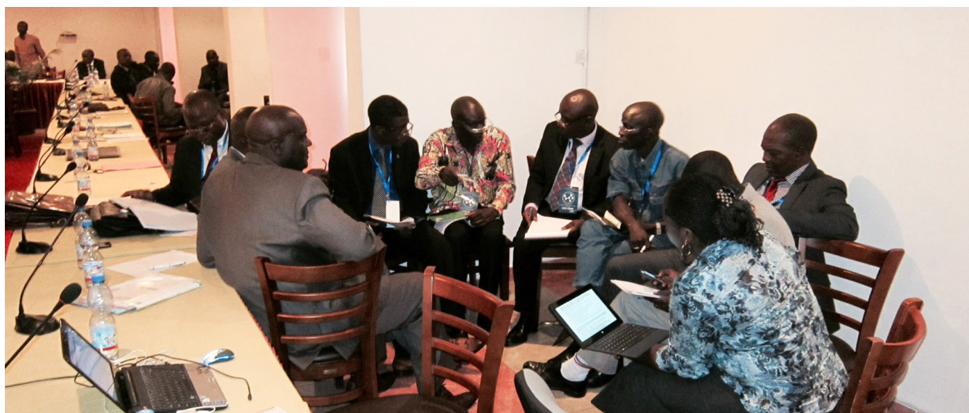
Members engaging in the 3rd Round Table Meeting in Kampala, Uganda.

the current activities in their countries in mitigation of the CBRN risks. Representatives of Ethiopia and Madagascar greeted the opportunity to attend the meeting and provide their input for the chemical project that was being drafted.