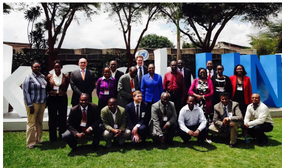
Participants in the National Action Plan workshop in Nairobi, Kenya.

It was an opportunity for the National Focal Points, the national experts, the Regional Secretariat and the European Commission to talk about the needs as-