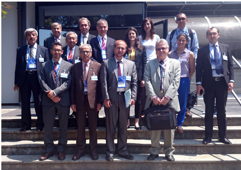
Central Asia Round Table Meeting participants at JRC site, Ispra, Italy.