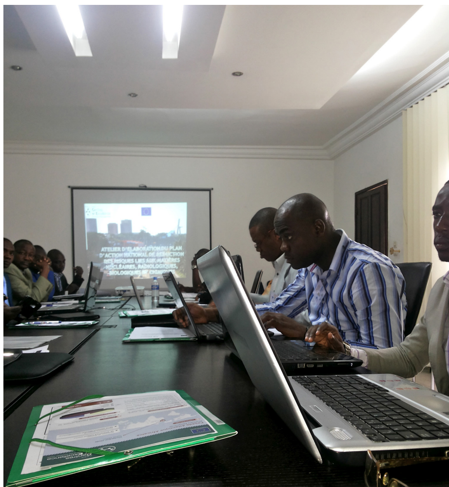
Côte d'Ivoire National Action Plan workshop.

The first drafting workshop for the CBRN National Action Plan of Gabon was held in Libreville on 3 and 4 July 2014. Hosted by the Ministry of the Interior, it gathered the members of the national team and UNICRI experts to discuss CBRN risks and mitigation strategies.