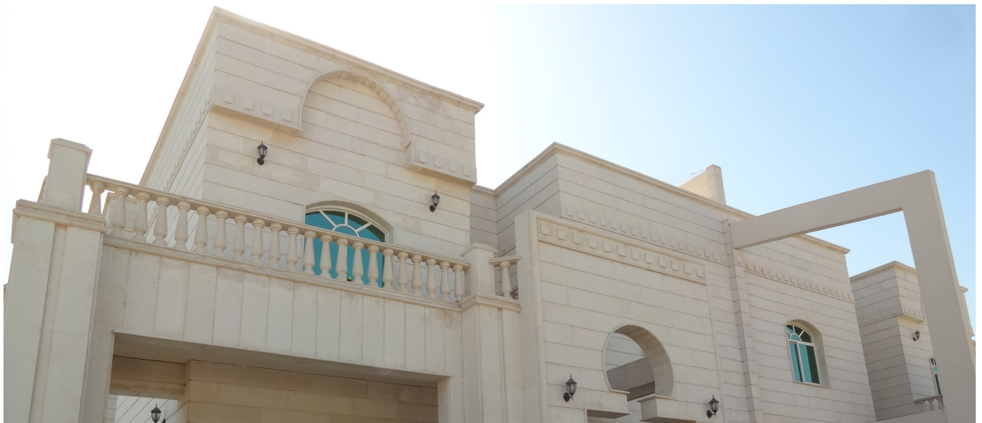
The newly opened Regional Secretariat building for the Gulf Cooperation Council countries.