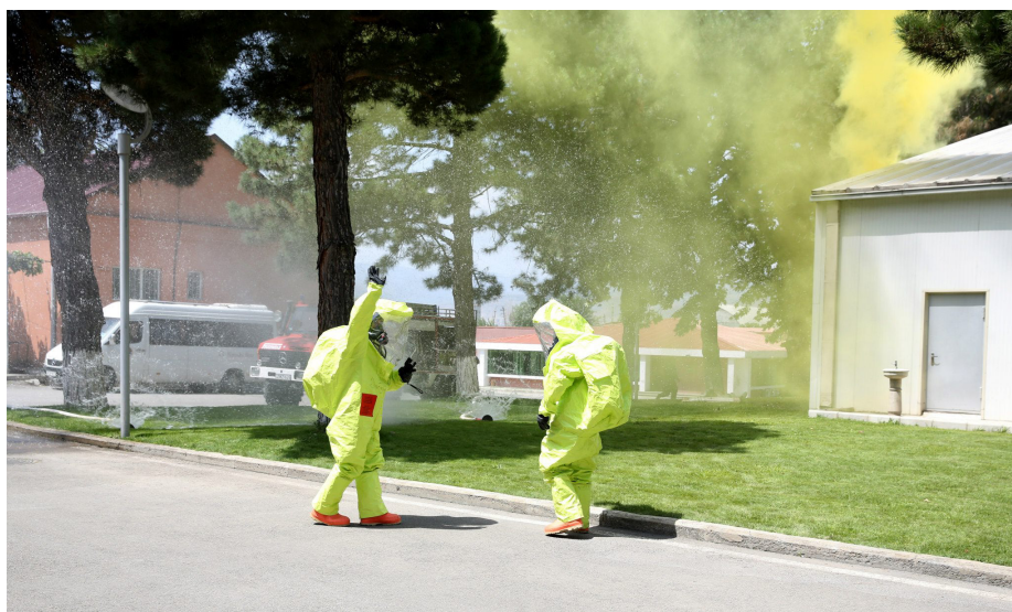
Demonstration of response to a simulated chemical attack.

response to a simulated chemical attack by the Emergency Management Department of the Ministry of Internal Affairs of Georgia (see figure).