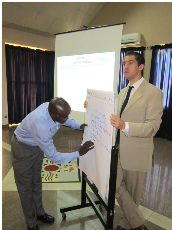
Project 33: table-top exercise in Burundi.