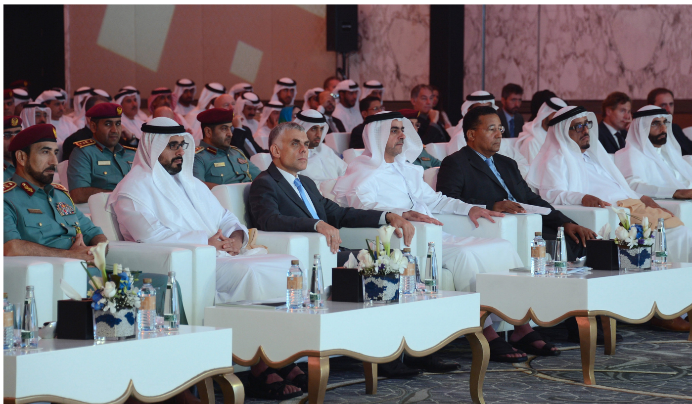
Participants at the inauguration of the Regional Secretariat for the GCC countries. Abu Dhabi, UAE.