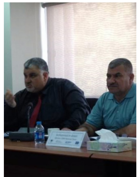
Iraqi National Team members discussing the Needs Assessment Questionnaire. Amman, Jordan.

A Needs Assessment Questionnaire Workshop was held from 20-22 May in Amman. The workshop was attended by Joint Research Centre (JRC) experts and the Iraqi National Team. The completed questionnaire is currently with the representatives of Iraq.