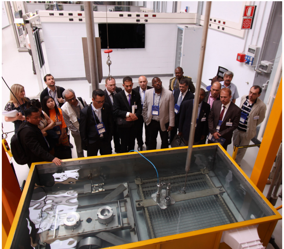
NFP meeting participants visiting the SiLab in JRC Ispra, Italy.