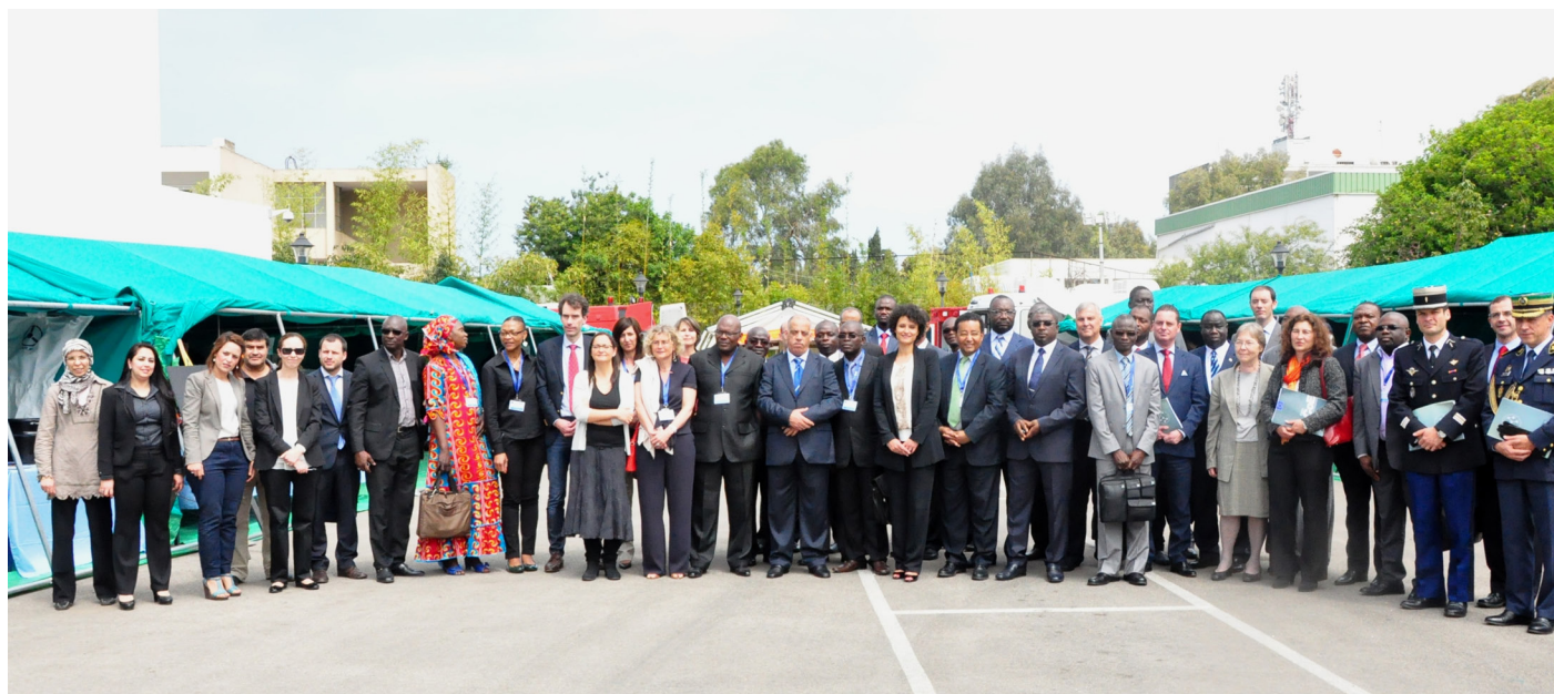
1er anniversaire du Bureau régional pour la Façade Atlantique Africaine. Rabat, Maroc.