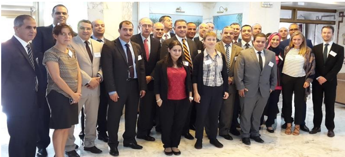
Group picture of Regional Workshop for North African countries

The second day started with a presentation on export and import control of defence material and dual-use goods in Spain, followed by a presentation on end-use controls and post-shipment verification. The seminar concluded with a case study aiming to illustrate how the EU Common Position is implemented at national level. All presentations and in particular the roundtable discussion were received with interest and curiosity from the side of the participants. This event was supported by experts from France, Spain, Switzerland, Austria and GRIP.