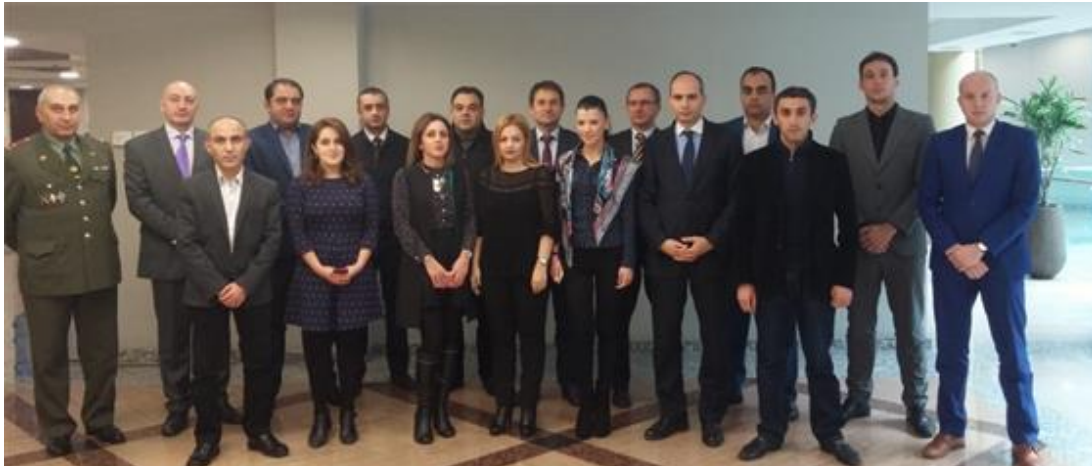
Group picture of the National Seminar in Yerevan, Armenia

updates and new developments on WMD proliferation. Other issues discussed included catch-all controls, interdiction mechanisms and intangible technology transfers. During this part, the Armenian experts had an opportunity to present the national implementation of their catch all principle to the participants.