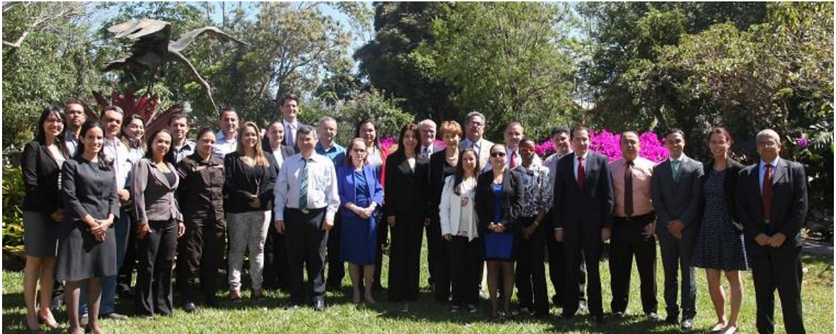
Group picture of the Ad Hoc Seminar for Costa Rica

The invited experts provided information on the scope and obligations of ATT, the role of Customs and the practical steps required for implementing the ATT. Furthermore, an expert from Jamaica shared his country's experience on the EU ATT OP and implementation of the ATT by a country originating in the same region. Also, an expert from UNLIREC presented the recent exercises conducted in Jamaica.