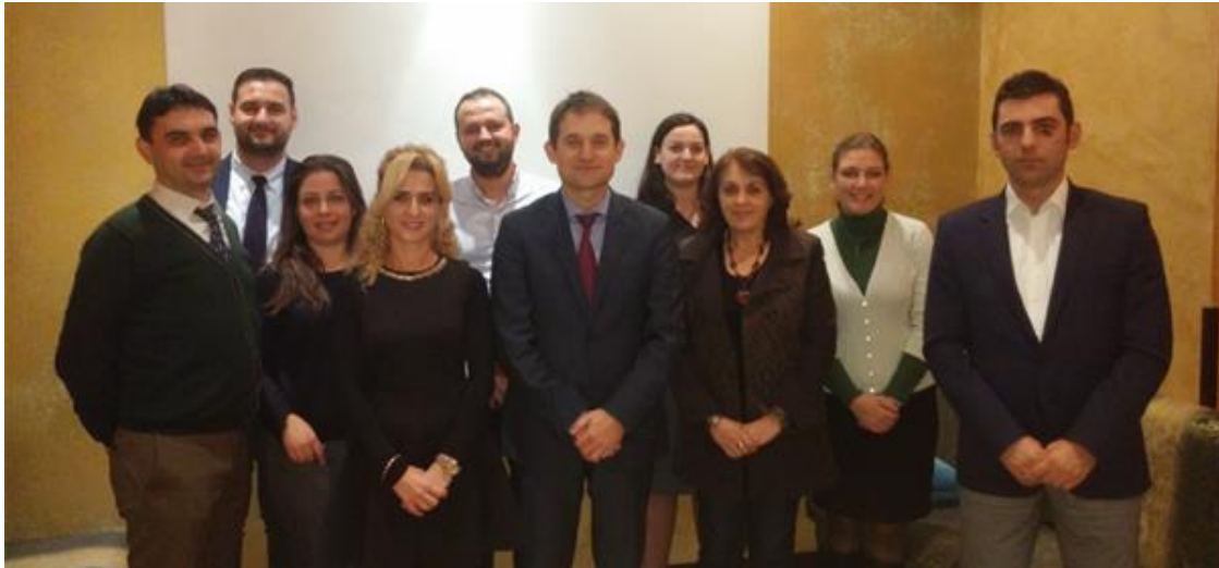
Group picture of the First National Seminar in Tirana, Albania

better understand the challenges relating to the implementation of transit controls.