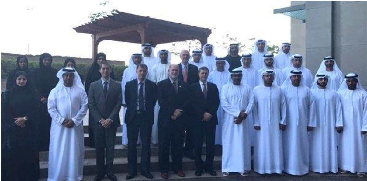
Group Picture of the Third Training Session in Dubai, United Arab Emirates

export control programme for dual use goods