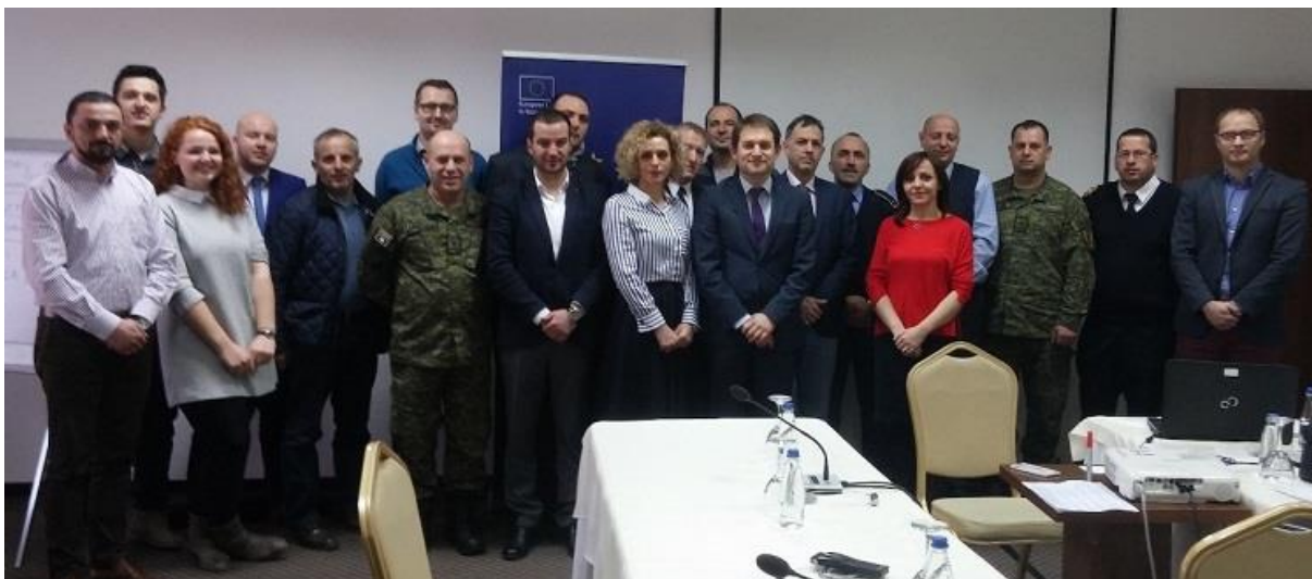
Group Picture of the First National Training Session in Pristina

export control programme for dual use goods