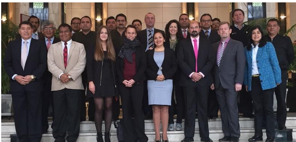
Group picture of the third Roadmap Activity for Peru

On 13-14 October 2016, the third roadmap activity for Peru was conducted in Lima in the framework of the EU P2P ATT-OP. The topic of