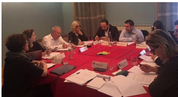
Second Legal Review in Shkoder, Albania

On 21 and 22 February, a representative of the EU P2P Programme on Export Control of Dual-Use Goods participated at the legal review meeting on Albanian export controls law.