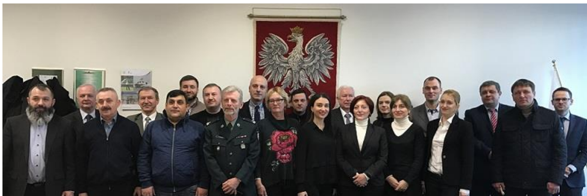
Group picture of Study Visit for Eastern European Partnership Countries to Poland

From November 30 to December 1, 2016, a study visit took place for Albania, Kosovo*, FYROM** and Montenegro to Riga, Latvia within