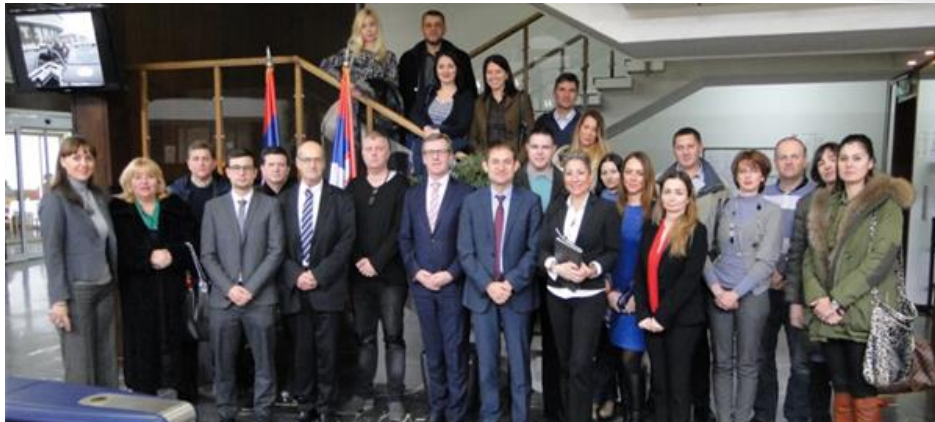
Group picture of the First National Customs Training Session in Belgrade, Serbia

export control programme for dual use goods