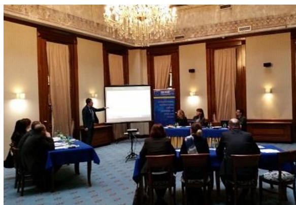
Picture of the Interagency Cooperation Sub-regional Exercise in Sarajevo, Bosnia & Herzegovina

The seminar was attended by licensing and customs authorities dealing with strategic trade controls from Bosnia and Herzegovina, the Former Yugoslav Republic of Macedonia and Montenegro. The seminar included an Interagency Cooperation Exercise with a view to training the different authorities concerned by export controls. The exercise allowed participants to gain a better understanding of interagency cooperation issues at both national and regional level.