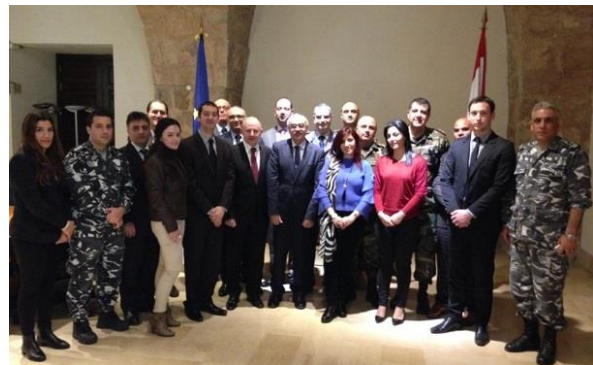
Group Picture of First Legal Workshop in Beirut, Lebanon