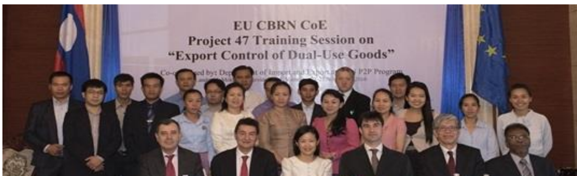
Group photo of the First Training Session in Vientiane, Laos

The session was opened by the Deputy Director