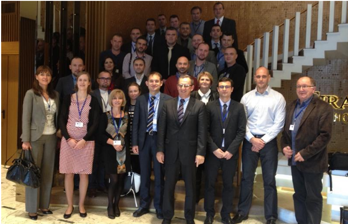
Group picture of South East Europe Customs Regional Seminar in Tirana, Albania

export control programme for dual use goods