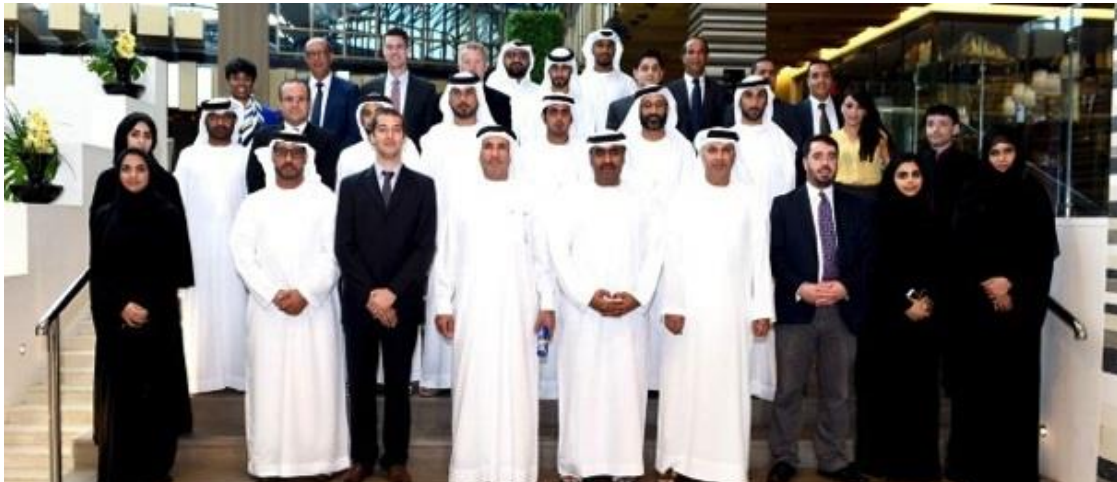
Group picture of the Regional Event for the MENA countries in Dubai, United Arab Emirates

export control programme for dual use goods