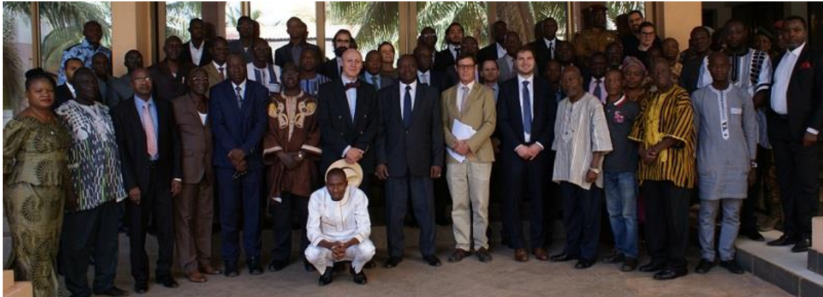
Group picture of Kick-Off Workshop on Arms Diversion in Western Africa

The activity was completed by a discussion concerning the implementation and the enhancement of arms transfer controls in Western Africa.