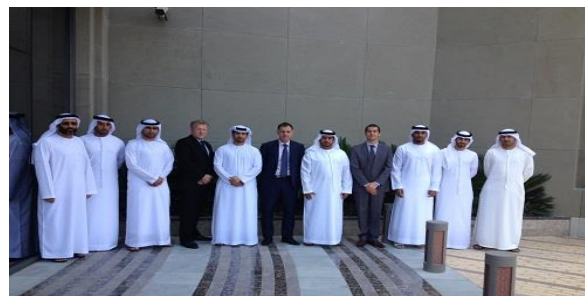
Second Training Session in Dubai, the United Arab Emirates

The implementing consortium of the EU P2P Dual-Use Programme co-organised with the Executive Office of the Committee for Goods and Material Subject to Import and Export