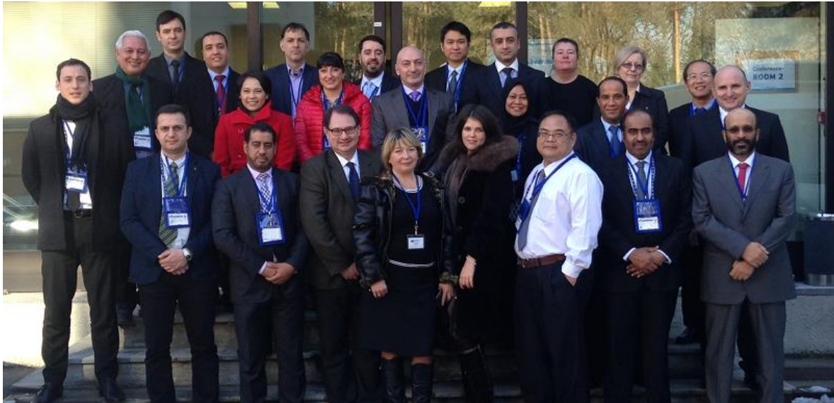
Group picture of EUP2P CIT for Technical Reach Back Specialists in Ispra, Italy

export control programme for dual use goods