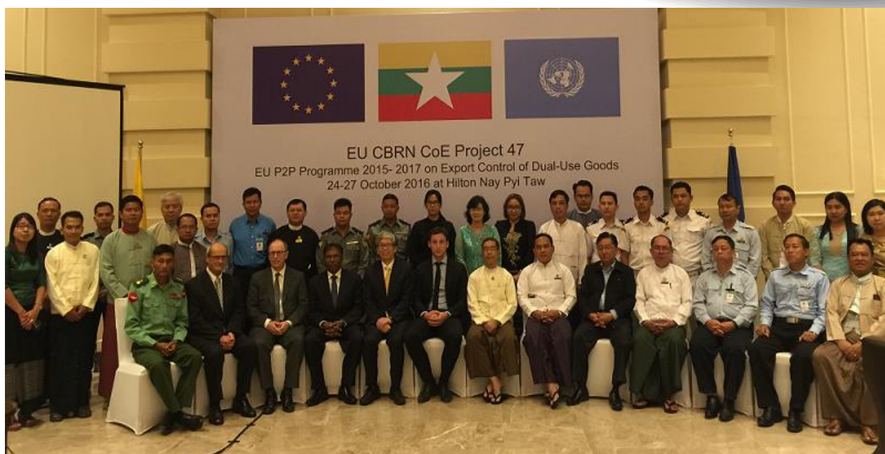
Group picture of the First Training Session in Nay Pyi Taw, Myanmar

export control programme for dual use goods