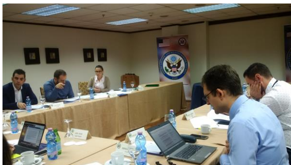
Picture of Legal Review Workshop in Tirana, Albania