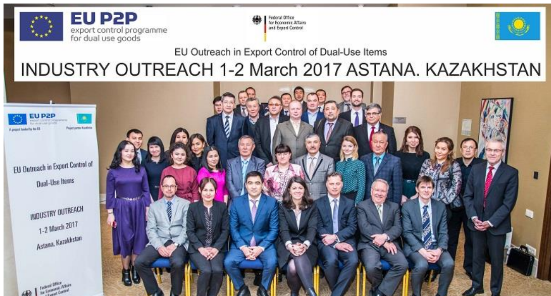
Group picture of Industry-Outreach event, Astana, Kazakhstan

export control programme for dual use goods