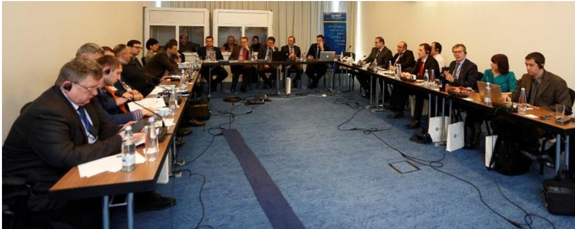
Picture of Regional EEC Investigation & Prosecution Experts' Workshop in Tbilisi, Georgia

Indeed, the participants had a chance to discuss national experiences and exchange best practices concerning the licensing and practical implementation of controls.