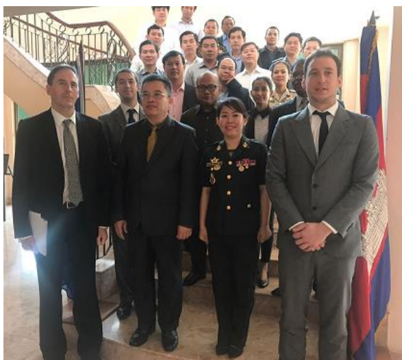
First Legal Workshop in Phnom Penh, Cambodia

export control programme for dual use goods