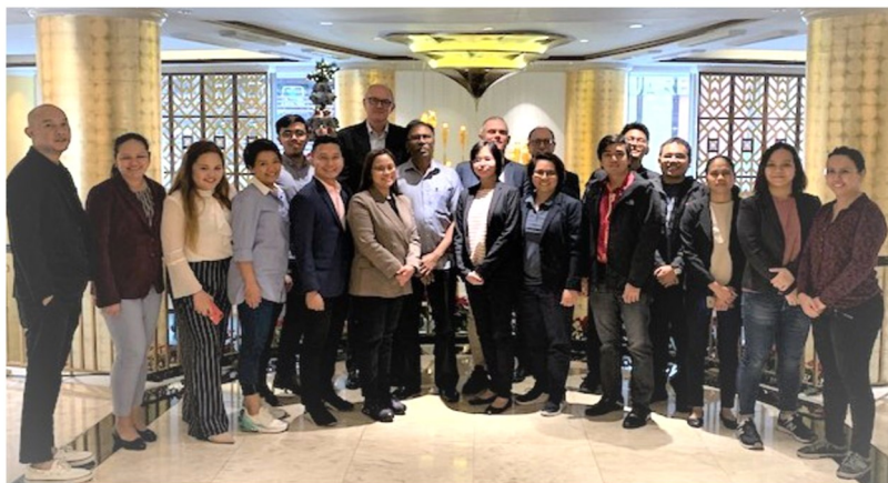
Participants to Awareness Workshop on Setting Up a Licensing Office and Licensing Processes and Procedures in Manila

ticipants joined this training, of which 12 were from the Department of Foreign Trade and 8 from other agencies that will be involved in licensing and/or enforcement of the dual-use control law.