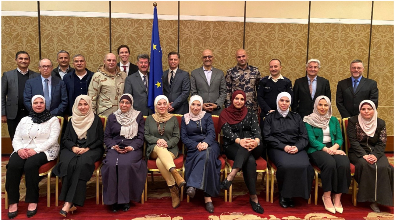
Workshop on the Implementation of the Amended Instructions of the Year 2019 on the Export and Re-Export of Dual-Use Items group photo

concerned agencies that – according to the upcoming amended legal instructions – will form the Export Control Committee (ECC). First, the participants were introduced into the upcoming legislation by representatives of the Jordanian Ministry of Industry, Trade and supply (MIT). Then, four EU experts confronted the audience with several case study scenarios which intended to point the attention to potential disputes and shortcomings that might arise during the licensing process and start a discussion on possible solutions. Moreover, EU experts presented the scope, structure and logic of the EU dual-use control list and tested the level of knowledge of participants through interactive and practical exercises concerning the of the important steps that ought to be taken in the licensing process.