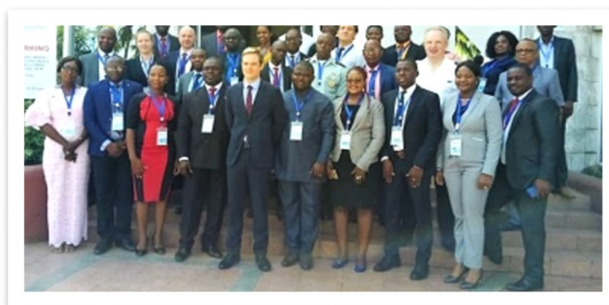
Participants to the Sub-Regional Seminar in Ghana