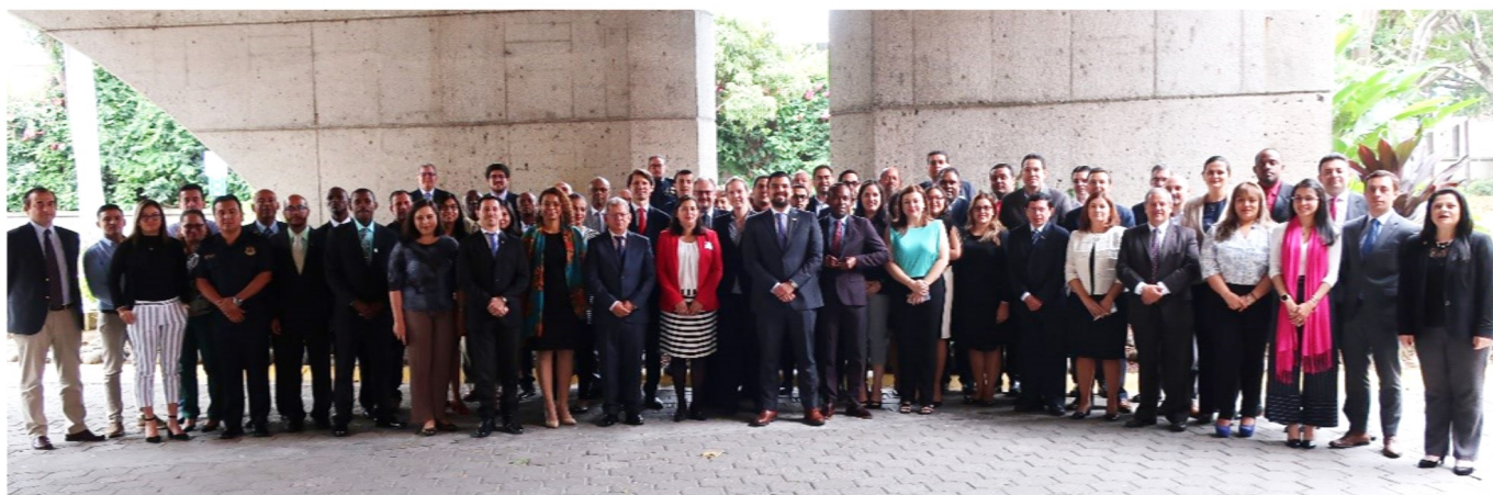
Group picture of the Sub-Regional Workshop in San José

The first session underlined the importance of the ATT for the region of Latin America and the Caribbean and included short presentations on the state of play of ATT implementation by each of the invited countries. In the afternoon, a session about the regulation of brokering activities (Art. 10 of the ATT) and a session about instruments to combat diversion and illicit trafficking of conventional arms (Art. 11 of the ATT) formed part of the agenda. This included a short summary of the results of the first two sub-regional workshops in Latin America, that were focused on preventing diversion in the bordering zones of the Amazon, provided by representatives from Peru and Colombia, and a case study discussed by a representative of the Colombian State com-