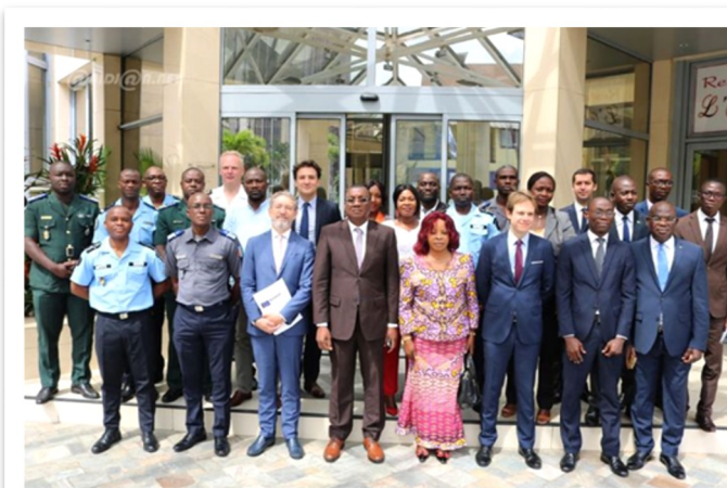
Third Roadmap Activity on ATT Reporting in the Republic of Côte d'Ivoire group photo