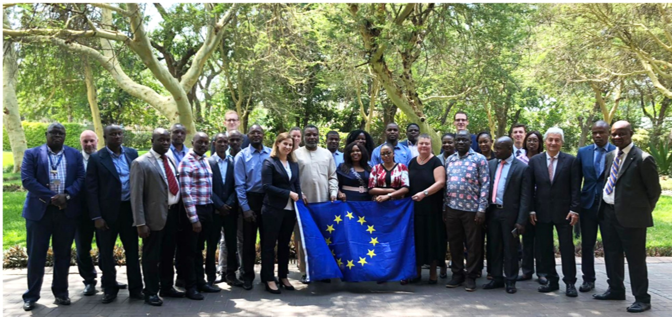
Fourth Roadmap Activity for Zambia group photo

The focus of the event was laid on customs-related topics such as targeted risk assessment and risk management, national control lists for military items and commodity identification as well as interagency cooperation. Furthermore, the events, which were organised under the project were evaluated and Zambia's next steps regarding the implementation of the Arms Trade Treaty identified. Approximately, 20 Zambian State officials from relevant authorities attended the roadmap activity.