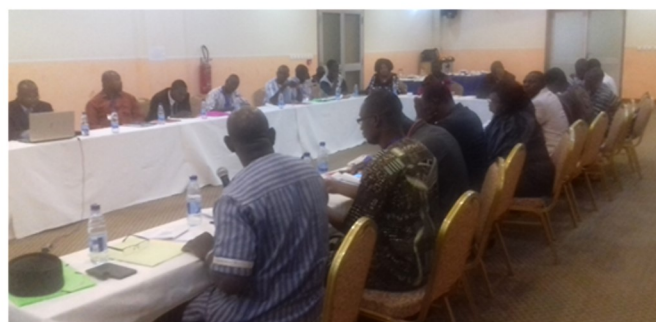
Participants to the Fourth Roadmap Activity on ATT Communication in Burkina Faso

The national point of contact for the ATT matters in Burkina Faso chose to dedicate this fourth roadmap ac-