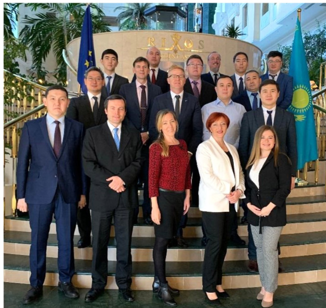
Ad Hoc Assistance Workshop for Kazakhstan

Overall, this workshop served as a platform for discussions on challenges and exchange of expertise and experiences concerning the successful implementation of the ATT.