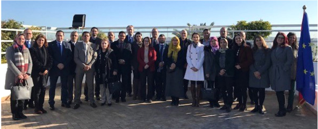
Legal Workshop in Morocco group photo