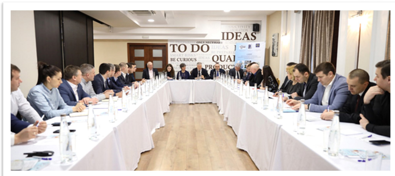
Promotion Event in the Republic of Moldova