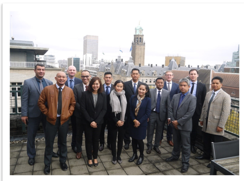
Study Visit in the Netherlands for Prosecutors group picture