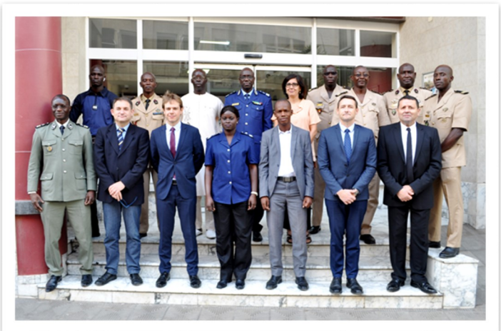
Third Roadmap Activity on Interagency Coordination and Information Sharing in Senegal group photo