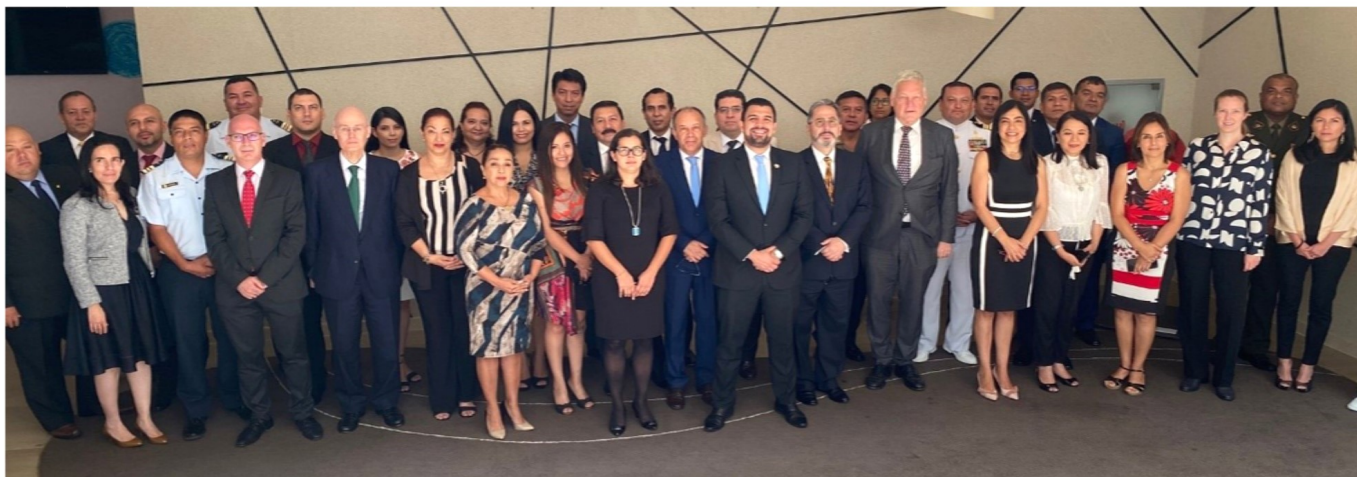
Group picture of the Third Roadmap Activity for Peru

gation of the EU to Peru, the Director of Security and Defence of the Peruvian Ministry of Foreign Affairs, a representative of the Ministry of Public Security of Costa Rica, a representative of the German Embassy in Lima and BAFA.