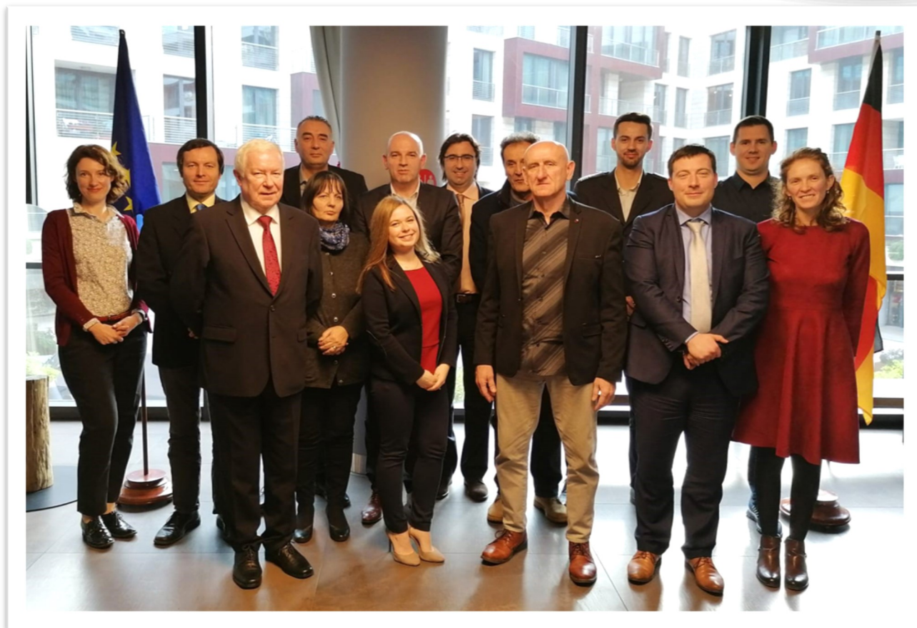
Group picture of the Individual Assistance Workshop for Montenegro