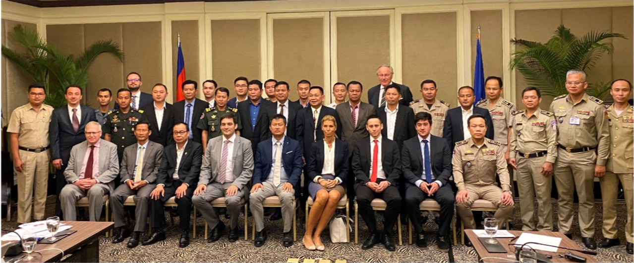
Group picture of the Third Roadmap Activity for Cambodia

recommendations for the preparation of the ratification of the Treaty, followed by a final open discussion.