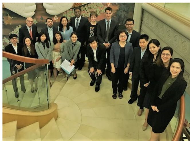
Workshop Participants in Bangkok

This training contributed to the better understanding of the process and procedures involved in licensing. It also contributed towards building capacity of Department of