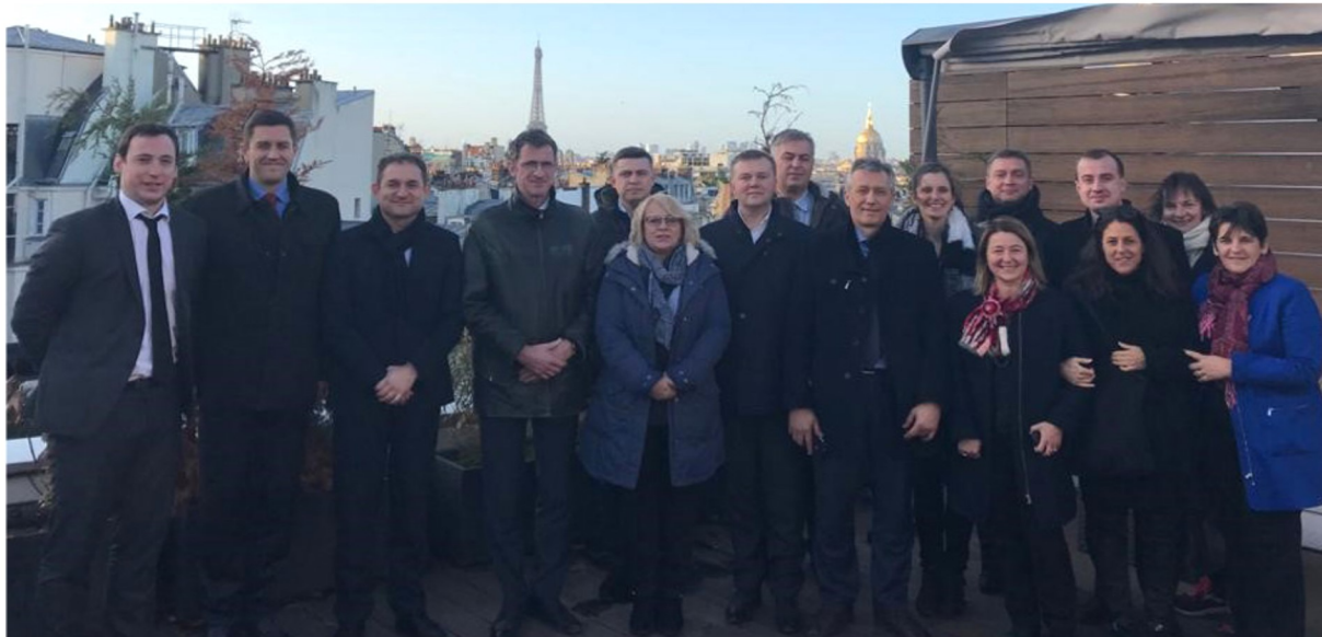
Study Visit in France for Ukrainian Authorities

managing licences and exercising control. This activity was dedicated to Ukrainian licensing, Customs and other enforcement officials from the Ministry of Foreign Affairs, Ministry of Economic Development, Trade and Agriculture, State Service of Export Control, Security Service, State Customs Service and the Institute for Nuclear Research of National Academy of Sciences of Ukraine.