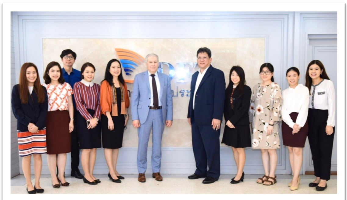
The EU Embedded Expert along with the DFT Officers in Thailand