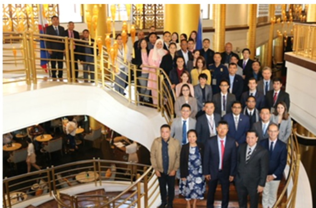
Group picture of the Fifth Roadmap Activity and Second Sub-Regional Seminar in the Philippines

the obligations contained in the Treaty.