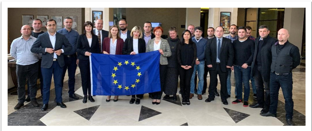
Fourth Roadmap Activity for Georgia group photo

The second day started with a short recap of the first day before addressing transit and transshipment matters. After an overview of processes and approaches in this respect, practical cases and experiences from a customs perspective were depicted. Further, Georgian customs officials presented practical examples regarding transit and transshipment. Following that, the next session focused on interagency cooperation between licensing and customs officials, mentioning ex-