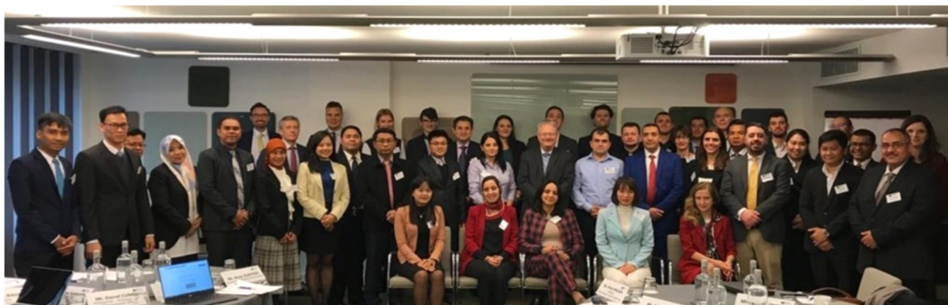
Dual-Use Industry Mapping Thematic Event