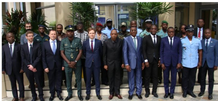
Group picture of the Fourth Roadmap Activity on Interagency Coordination in the Republic of Côte d'Ivoire

Accompanied by Expertise France throughout the second phase of the EU ATT OP, the Republic of Côte d'Iv-