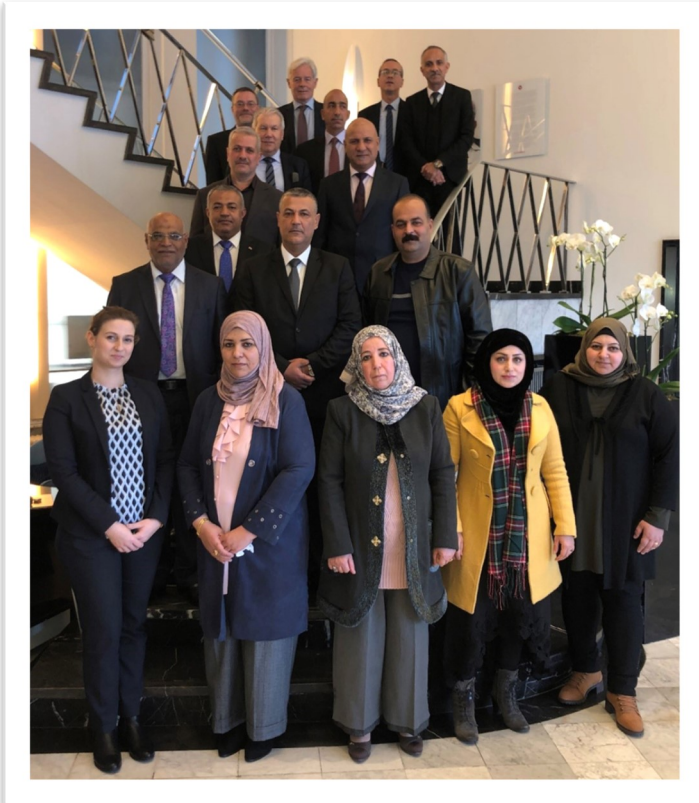
Workshop for Iraq – Introduction into Strategic Dual-Use Trade Controls group photo

conducted a workshop for Iraq. Due to the security situation in Iraq and visa procedures in neighbouring countries, the most feasible option was to hold the event in Germany.