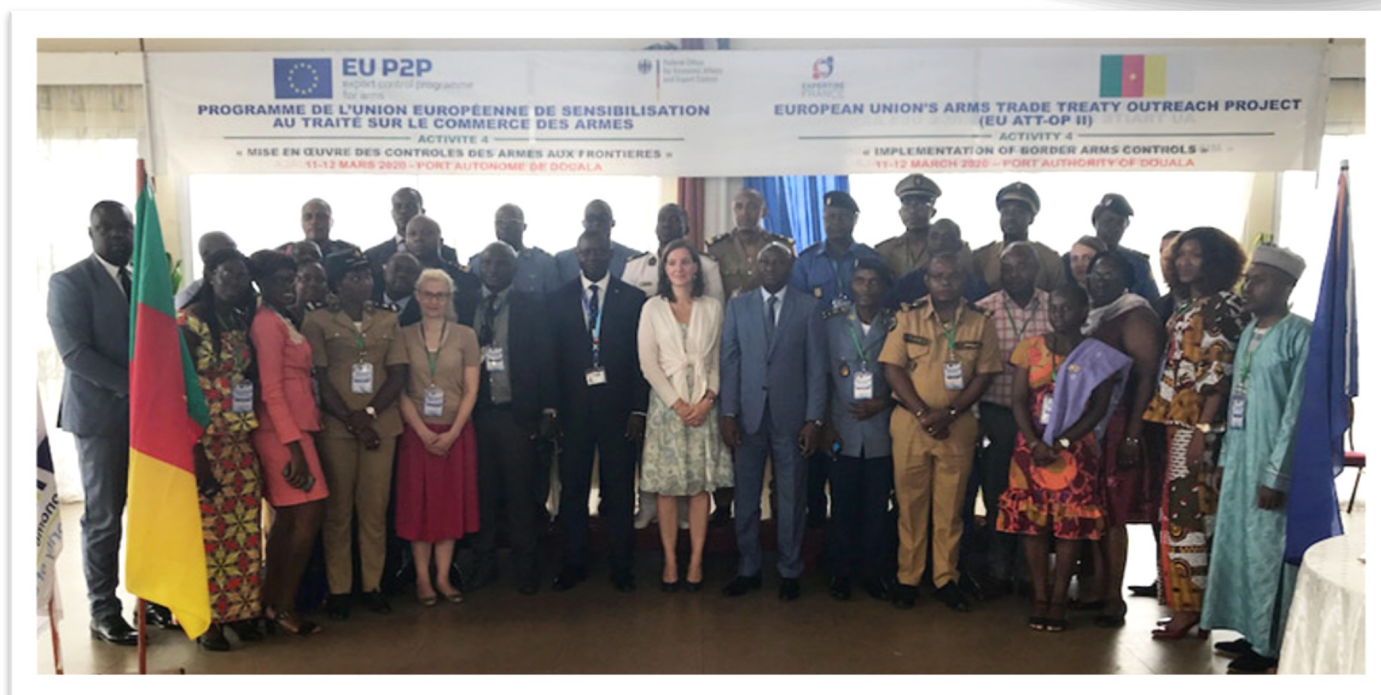
Group picture of the Fourth Roadmap Activity on Enforcement Controls in Cameroon