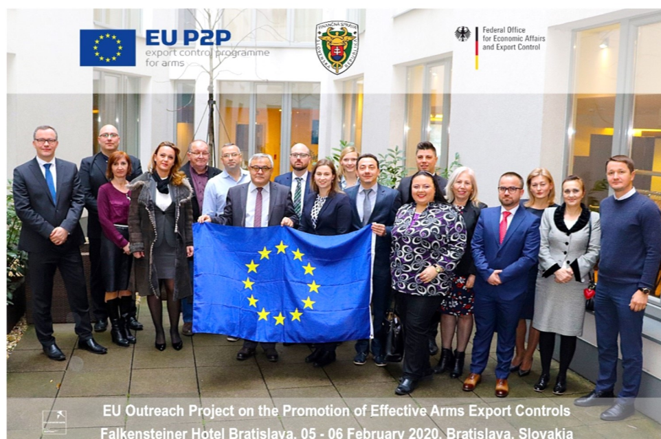
Group picture of the Study Visit for Bosnia and Herzegovina, North Macedonia and Ukraine

The Study Visit aimed to facilitate the exchange of national export control practices and it was organised by