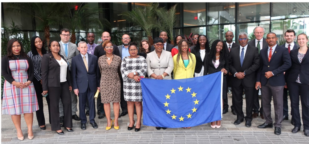
Group picture of the Third and Fourth Roadmap Activities in Kingston

The activity was attended by a total of 21 representatives from the Ministry of Foreign Affairs and Foreign Trade, the Ministry of National Security, the Jamaican Defence Force, the Office of the Commissioner of Police, the Firearm Licensing Agency, the Office of Director