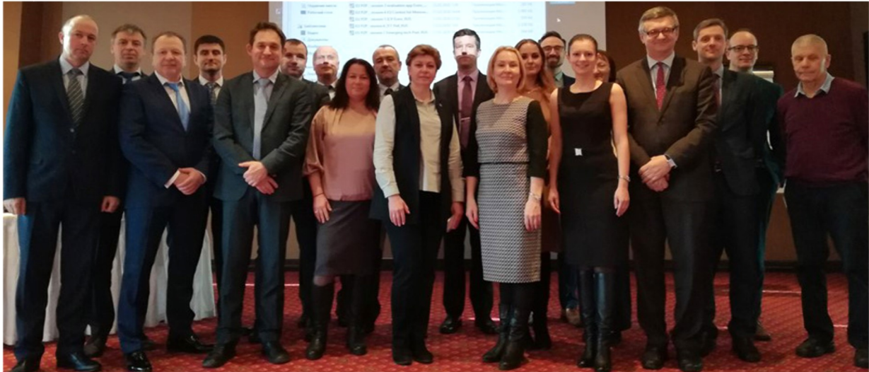
EU and Belarus Export Control Best Practices and New Challenges Workshop

mittee, the State Secretariat of the Security Council, the Ministry of Emergency, the Ministry of Health and the National Academy of Science.