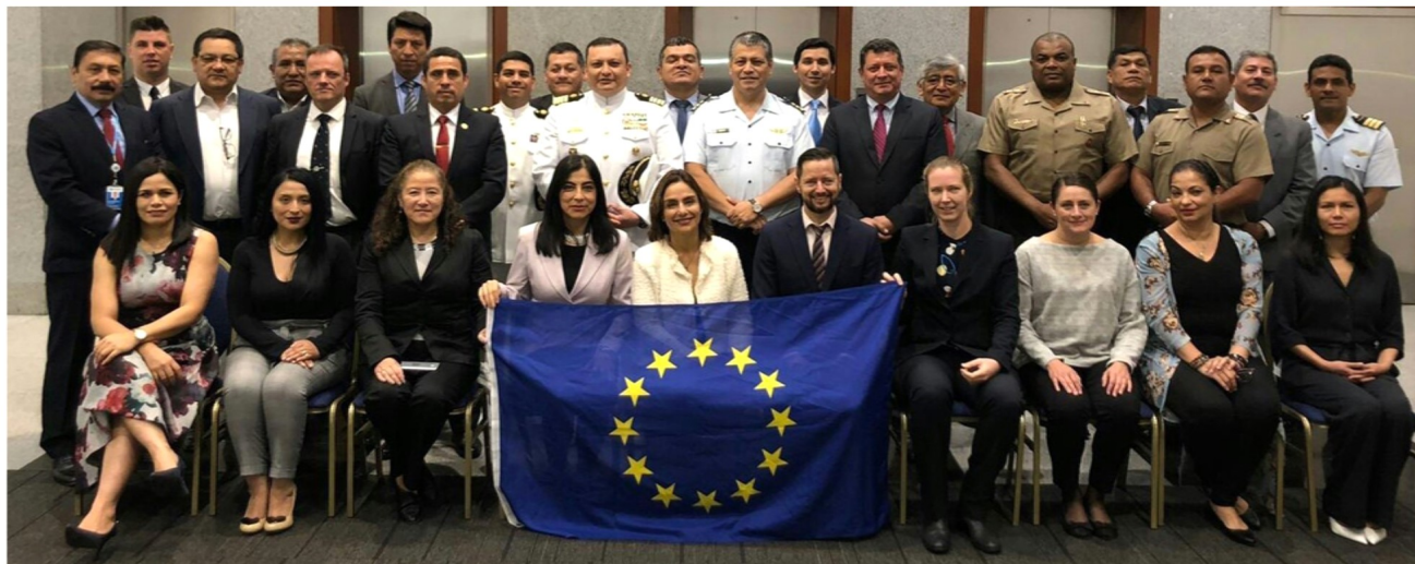
Participants to the Second Roadmap Activity for Peru

national control system, with special focus on experiences from the region of Latin America". The main objective was to discuss the obligations of the ATT as well as best practices for implementation, with the aim to support and set new impulses for the ongoing implementation process in Peru. The workshop was attended by a total of 35 representatives from the Ministry of Foreign Affairs, Ministry of Defence, SUCAMEC, National Police, National Intelligence Agency, Customs as well as the Ministry of Justice and Human Rights.