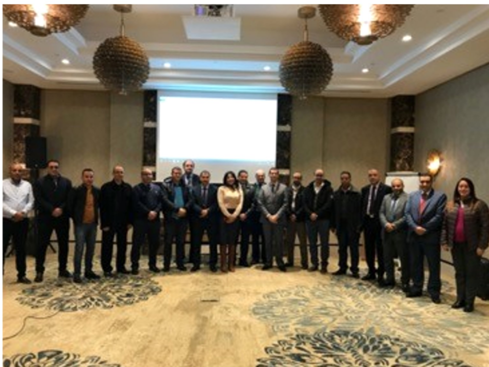
Legal Workshop in Tunisia