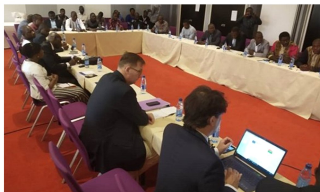
Third Roadmap Activity on ATT Implementation in Burkina Faso

The exchanges between participants and experts on the control of arms transfers, highlighted the following difficulties: The distinction between weapons of war and