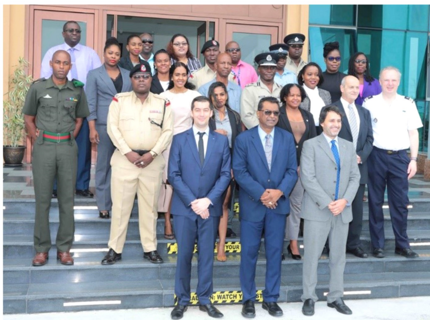
Group picture of the Ad Hoc Activity in Guyana

The workshop on the “reinforcement of the national capacities in the management and enforcement of international arms transfers” was an ad hoc event organized on the demand of Guyana by its Ministry of Public