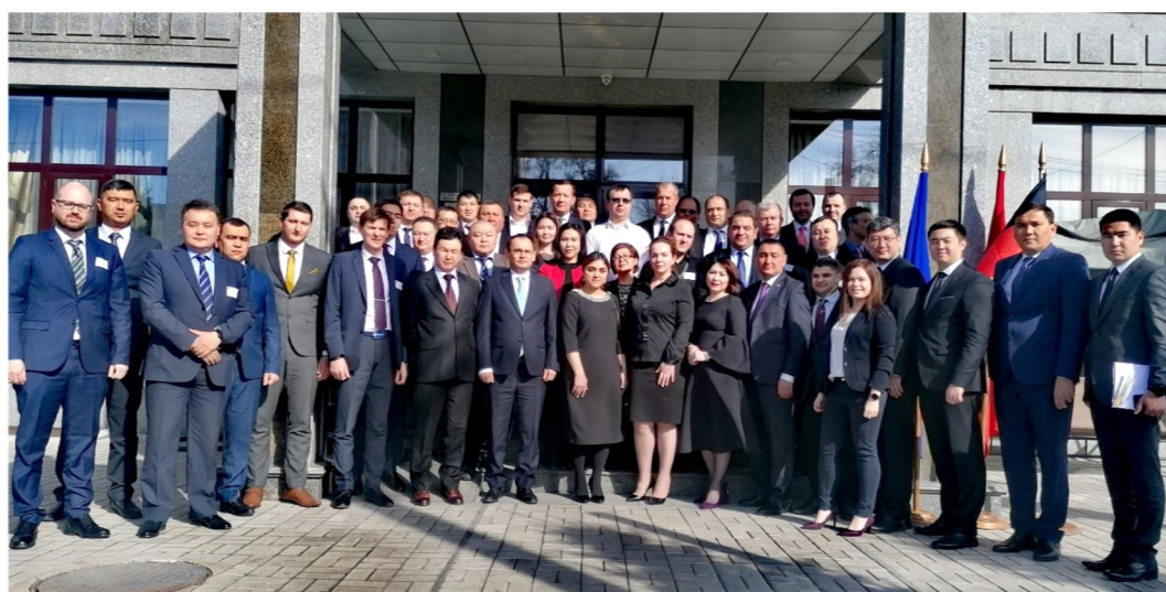
Group picture of the Cross-Regional Workshop for Central Asia, Eastern Europe and Caucasus

This workshop was the second regional activity orga-