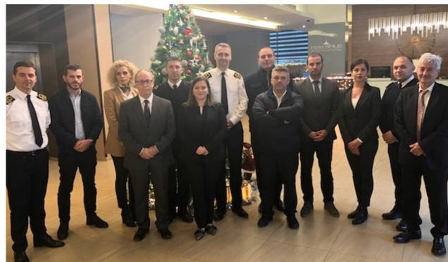
Training Session on Licensing in Kosovo*

A two-day themed Training Session on Licensing was conducted in December 2019, in Pristina, Kosovo*. The objective of this second national activity was to respond in targeted manner to the assistance needs expressed by Kosovan partners. For this purpose, the licensing of transit and transshipment activities was addressed as well as commodity identification and classification practices.