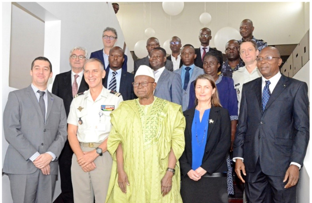
Participants to the Third and Fourth Roadmap Activities in Togo