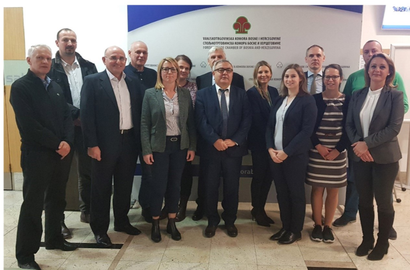
Participants to the Individual Assistance Workshop for Bosnia and Herzegovina