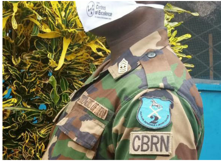
CBRN Team Member of Liberia supporting the 3-day door-to-door COVID-19 awareness raising campaign.

Between June and October 2020, more than 100,000 euros served the purpose of organizing 18 local hands-on training sessions to understand the techniques of safe and dignified burial of COVID-19 patients and crisis communication.