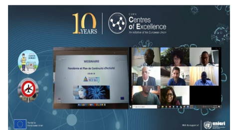
AAF Regional Secretariat webinar to share baseline information on COVID-19 - April 3rd, 2020.

When the 2014 Ebola crisis ravaged West Africa, the countries of the African Atlantic Façade Region decided it was time to implement one of the regional priorities that was identified by the National Focal Points back in 2012: the management of outbreaks. Therefore, from 2016 to 2018, national experts were trained, and a regional task force was created through EU CBRN CoE Project 48 on “Improved regional management of outbreaks in the CBRN Centres of Excellence Partner Countries of the African Atlantic Façade” . P48 achieved better prevention and preparedness against outbreaks by