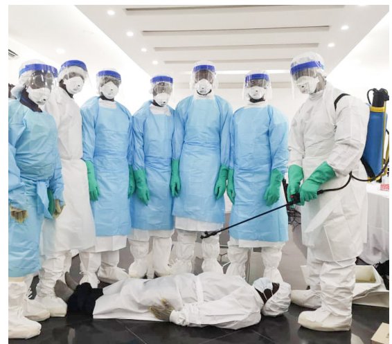
A training session on "safe and dignified burial" in Sierra Leone.

Notwithstanding the non-first response nature of the Initiative, the European Commission did not ignore the request of the region. Thanks to an important team work, funds and capabilities were made available to organize activities in the partner countries.