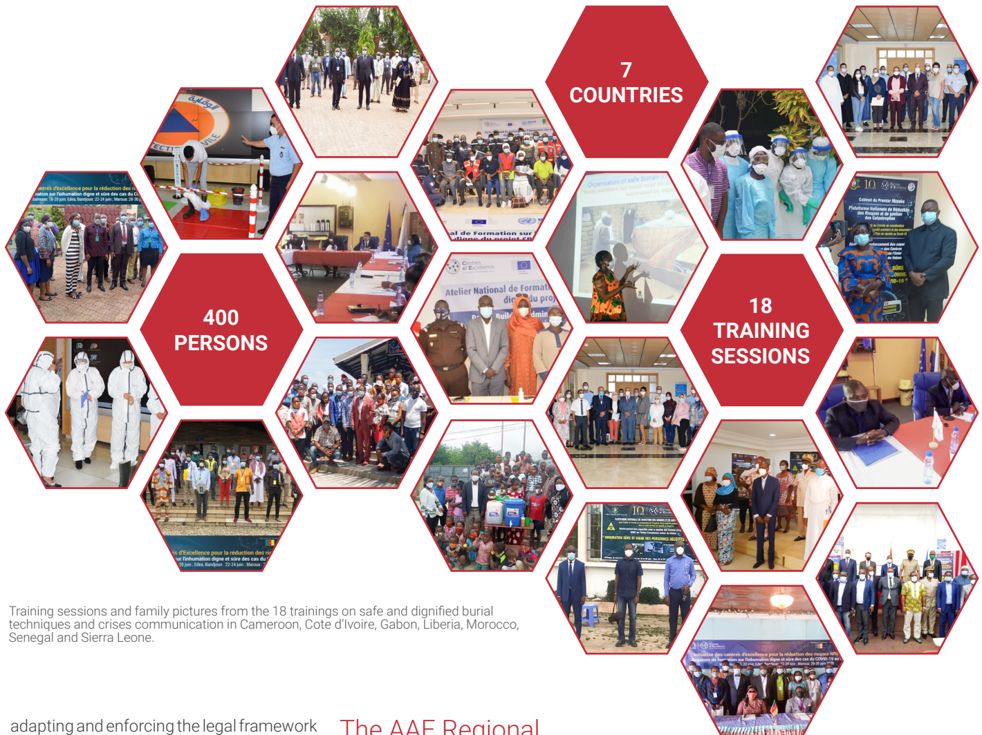
Training sessions and family pictures from the 18 trainings on safe and dignified burial techniques and crises communication in Cameroon, Cote d'Ivoire, Gabon, Liberia, Morocco, Senegal and Sierra Leone.

adapting and enforcing the legal framework for disease surveillance and disease control, by developing stronger regional pools of epidemiological skills and experts, by setting improved regional surveillance networks and early warning response systems and by raising awareness. Moreover, the project supported partner countries in establishing strong emergency response plans at regional level, defining accurately the strategic intervention measures and the role of different actors to contain quickly the spreading of infectious diseases.