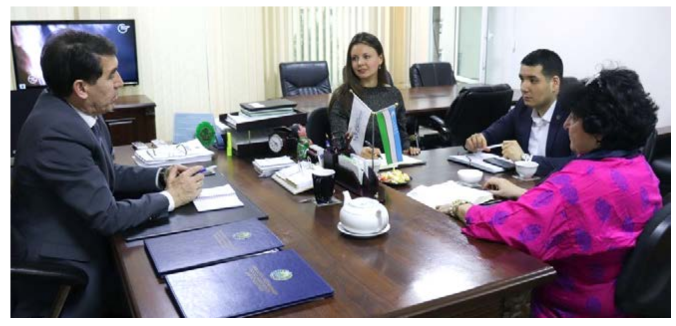
Working meeting of the Regional Secretariat of Central Asia

equipment, which is currently being used for the detection of coronavirus within the population. The Head of the National Reference Laboratory. National Tubercolosis Center under the Ministry of Health of Kyrgyzstan sent a letter of appreciation emphasizing that the training of P53 was being applied for training healthcare workers from hospitals that will be used as a COVID-19 treatment unit.