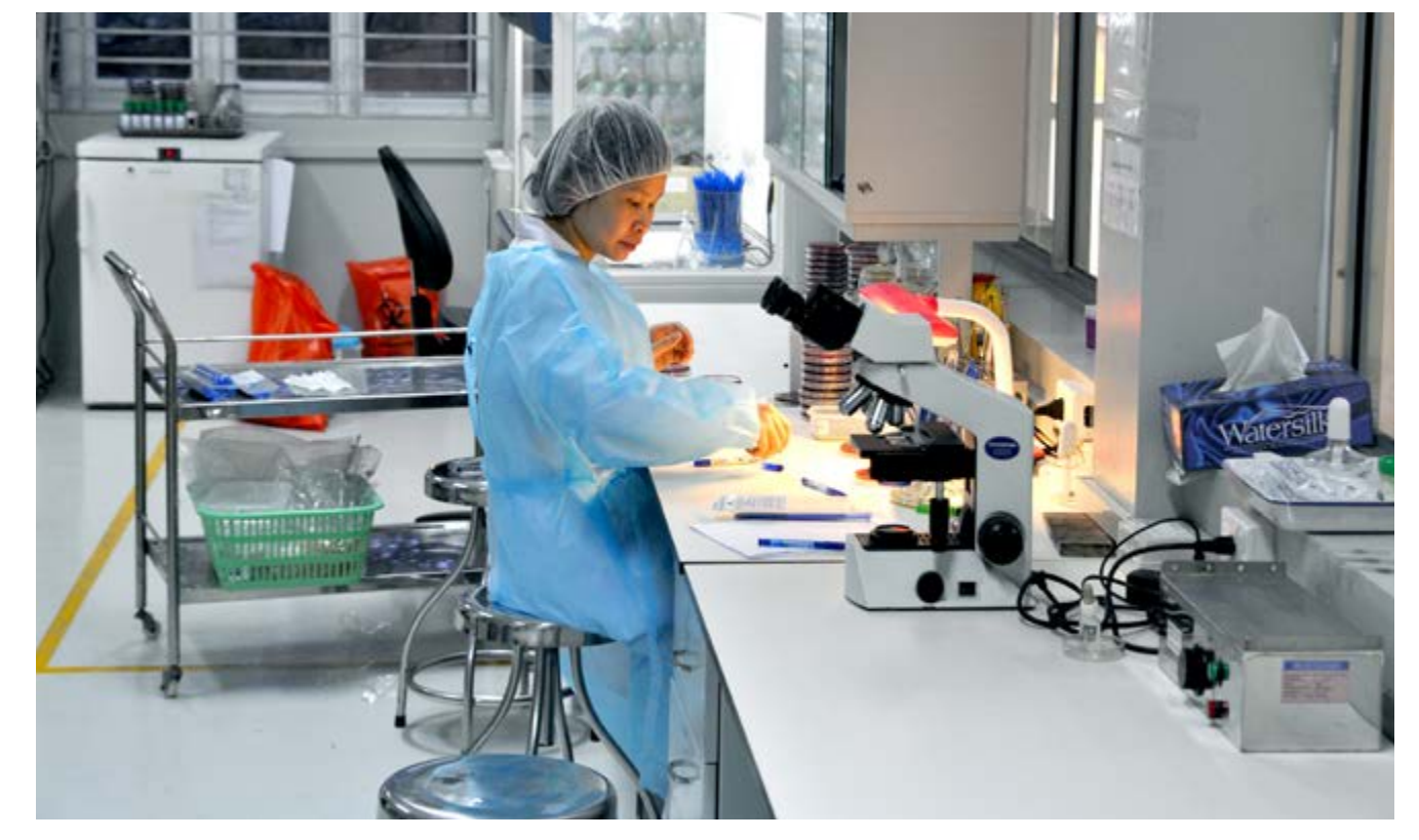
Work in the laboratories of the National Lung Hospital of Viet Nam.

it was better than it would have been seven years ago, when I had arrived at my current post in the Philippines right after the Regional Secretariat of the CBRN CoE for SEA had officially opened there in March 2013. Seven years later, I was looking forward to the launch of the new CBRN CoE online platform, providing resources and making it easier to map out the experts in the region and beyond. Together is the only way we can fight this global pandemic! Stepping off the plane, I felt grounded. I wished that the half-day session of the CBRN (CoE) National Focal Points Round-Table Meeting for SEA in December 2019, devoted to deepening the CBRN CoE engagement with the Association of Southeast Asian Nations (ASEAN), would also result in grounded actions in the near future. The CBRN CoE can help to design actions that should minimise the impact of future epidemics and pandemics in SEA. However, the CBRN CoE needs its partner countries to lead that process they are the pilots!