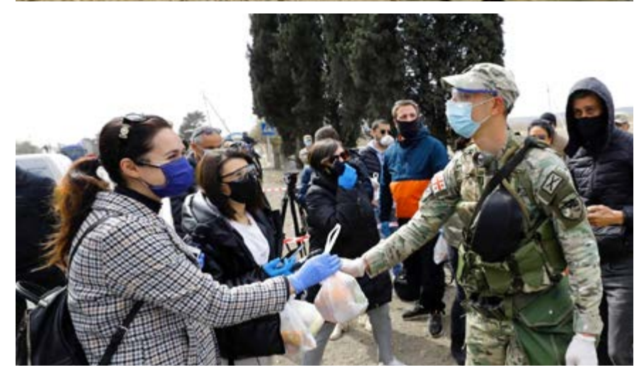
Top: Georgian militaries checkpoint. Middle: A doctor waiting for check ups in his isolation zone. Bottom: Militaries helping citizens with food supplies

than 10 municipalities as of 8 April 2020. In order to prevent the spread of the COVID-19, the military doctors conduct first medical examination for all incoming and outgoing citizens at checkpoints set up by Defense Forces. Medical crew consisting of a doctor and four nurses is mobilized at each checkpoint. The medical personnel has been equipped with personal protection equipment and thermal screening monitors. In case of any suspicious symptoms, they transfer the citizen to the isolation zone nearby the checkpoint. At the field medical station, the doctor re-examines the citizen, processes information on symptoms, searches their possible contacts and sends information to the Command Center and the Emergency Medical Center in case of high body temperature.