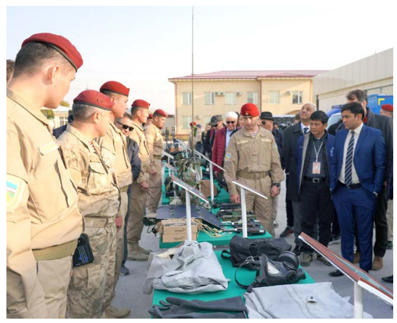
Demonstration of equipment during CBRN Jeyran Field Exercise

effectively fostered preparedness and response capabilities through the simulation of a release of CB agents by terrorists. The Regional Secretariat reported that this event boosted the confidence of professionals tackling the COVID-19 crisis.