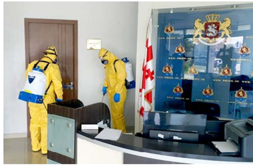
Top: Two equipped forensic experts at a Ukrainian airport. Bottom: Two experts disinfecting the Georgian Police premises.