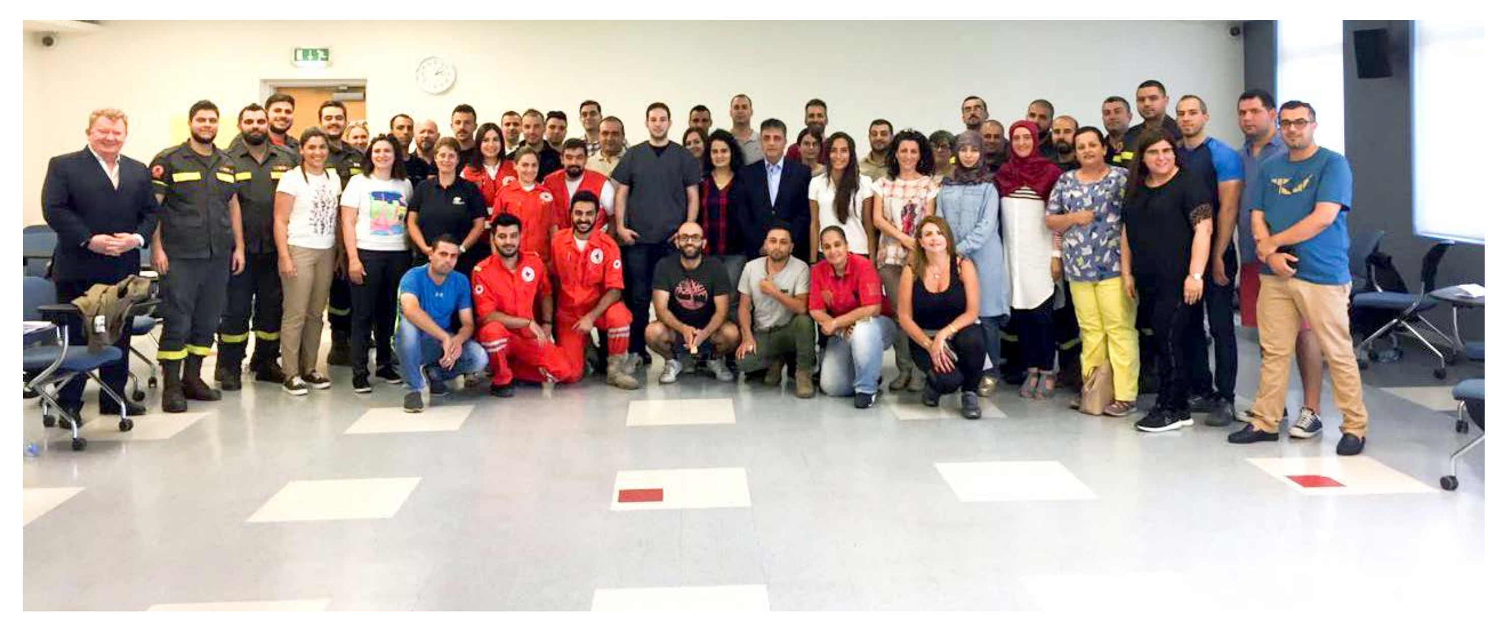
Trainees and trainers in Lebanon

have been trained using P54 training In Lebanon, medical personnel from IFRC, EMPHNET and ECDC to seek media in Arabic. Local trainers have the Ministry of Health, Civil Defence, assessed positively expressed their American University of Beirut Medical gratitude for the knowledge, experience, Centre, The Red Cross and other and confidence to deal with PPE and agencies were equipped and trained COVID-19.