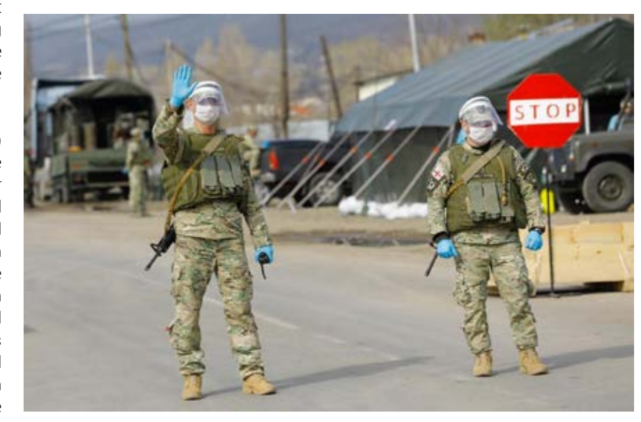
Georgian army controlling the borders