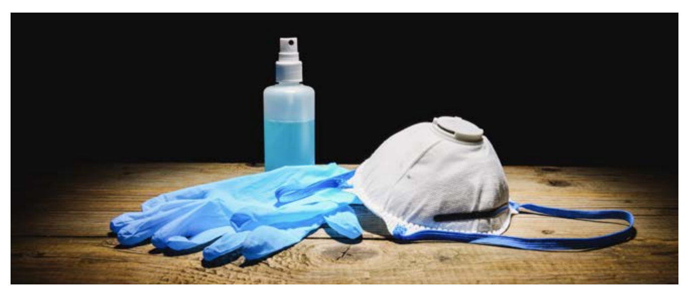
Personal protection equipment helping to prevent the spread of COVID-19