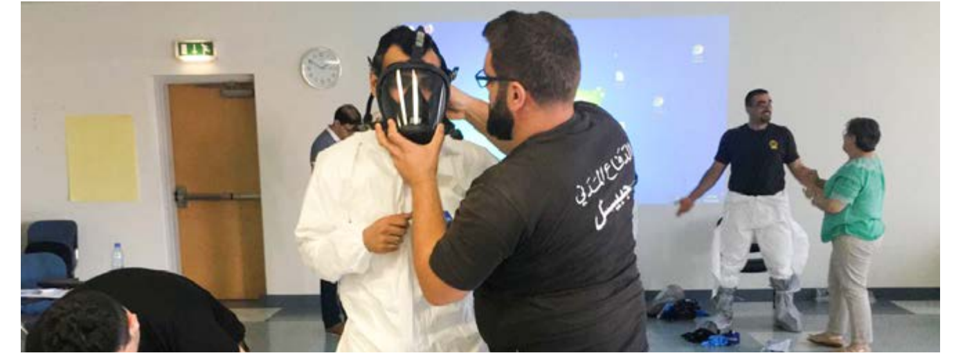
A phase of training session

Thanks to positive feedback on P54, the Gulf Cooperation Council Countries from the medical perspective. During requested some of its components to In Jordan, the National Center for the COVID-19 crisis, the National CBRN be replicated in that region, making use of the materials and expertise the Ministry of Health have used the disseminating knowledge and best developed previously and reinforcing interregional cooperation. Activities in this sense were successfully conducted last year and will resume as soon as the circumstances allow.