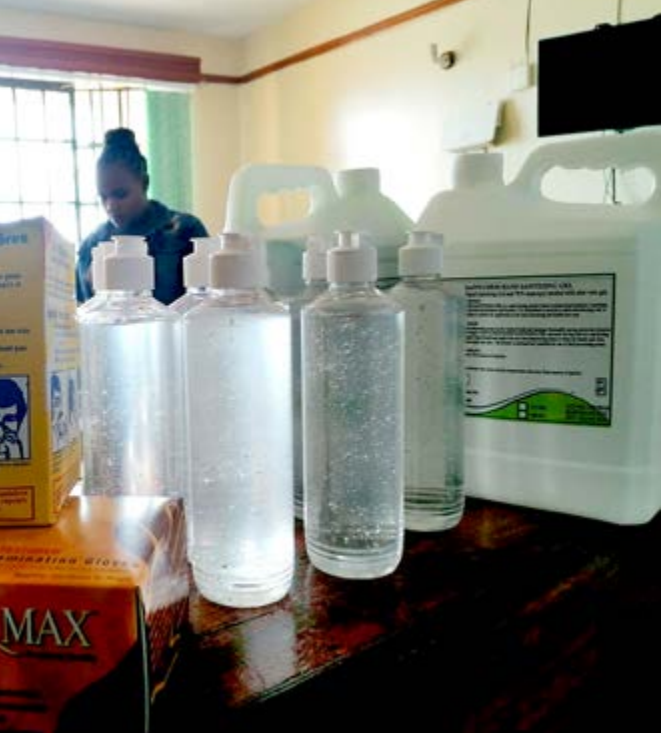
Through our support to GCERF, the European Union is able to help community based organisations like SOWED Kenya, in strengthening their resilience against COVID-19.

COVID-19 related assistance to partners in the field. Once again an example here is Kenya, where a community-based project implemented by the Global Community Engagement and Resilience Fund (GCERF) is providing key items (hand sanitizers, masks, soap) to local communities in which the project is working. The European Commission is funding GCERF through the same budget line -the Instrument contributing financing the EU CBRN CoE Initiative.