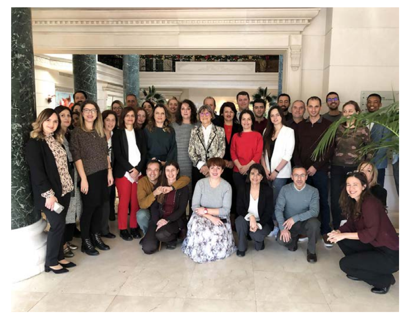
The participants of the training "Multivariable Analysis", held at the Xheko Imperial Hotel, Tirana in December 2019.

to apply scientific methods in day to day public health field conditions in order to generate new knowledge and evidence for decision making with the aim of takling public health action. Field epidemiologists used epidemiology as a tool to rapidly design, evaluate or improve interventions to protect the health of the population. The transmission potential that communicable diseases created the urgent need to get answers about the causes of outbreaks, risk factors of diseases, risk groups and effective ways to intervene. This one-week training module on "Multivariable Analysis" has provided participants with basic definitions and concepts for the different types of regression models (linear,