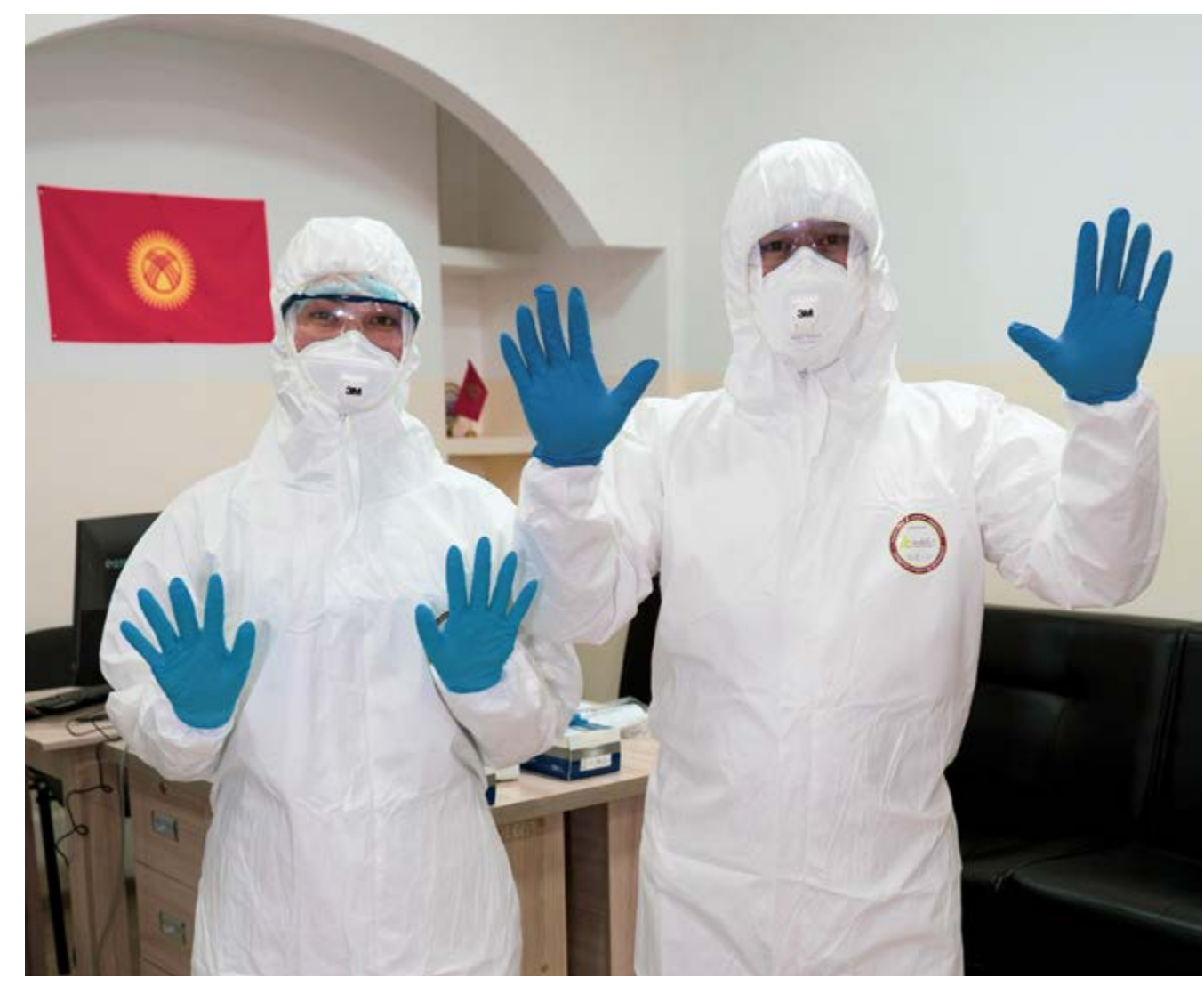
Two Kyrgyz technicians with their PPE

Project 53 'Strengthening the National Legal Framework and Provision of Specialised Train ing on Biosafety and Biosecurity in Central Asian Countries' sustainability effects.