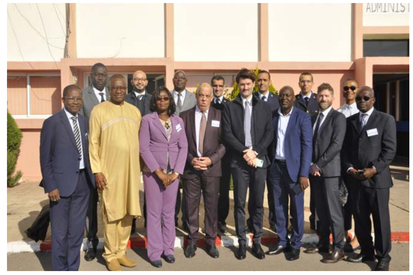
16th National Focal Points Round-Table Meeting for the African Atlantic Facade, Casablanca, Morocco, 3-4 December 2019

In the beginning of April, the Regional Secretariat hosted a webinar dedicated to COVID-19, focusing on business continuity plans to be put in place during the crisis.