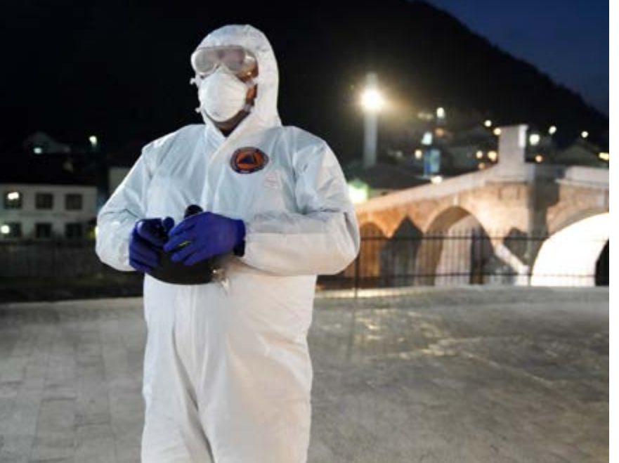
A Serbian civil protection representative

· European Commission - DG SANTE, using the EU Health Policy Platform, has been regularly delivering the latest relevant information on COVID-19 pandemic to the EU Third Health Programme member countries. The latest relevant information on the COVID-19 pandemic situation, which was presented in the Health-EU Newsletter. This information is being forwarded to relevant health institutions in Bosnia and Herzegovina.