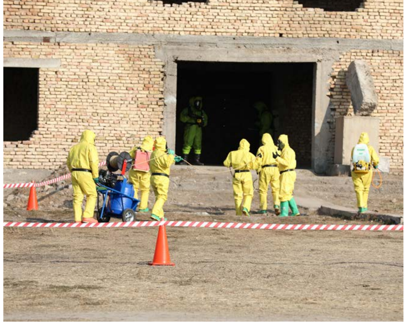
HAZMAT teams cordoning off and decontaminating the area of the alleged clandestine laboratory

During the exercise, participants played a variety of roles (active players, observers and evaluators) in different scenarios which covered among others: surveillance of terrorists in possession of chemical and biological agents and their subsequent arrest; detection of illicit storage and a clandestine laboratory; neutralisation of explosive material; and search for improvised chemical devices in a public place. The meeting received a lot of positive feedback from participants. "Holding the Jeyran field exercise in Uzbekistan was very timely and relevant", stated Deputy Head of the EU Delegation