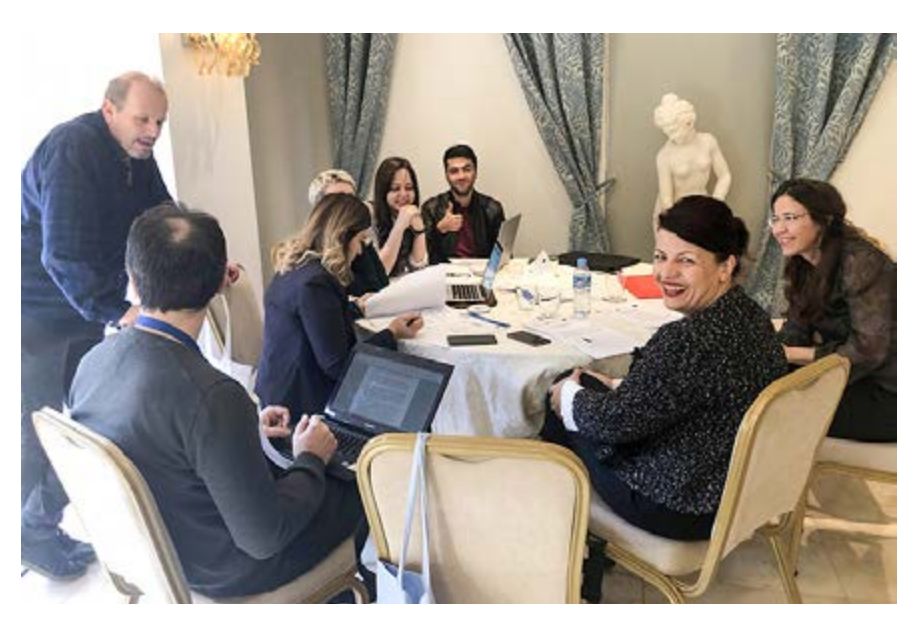
A moment during the training.

negative binomial) as well as the skills needed to perform and interpret multivariable analysis. In addition, participants have had the opportunity to strengthening knowledge in the direction practice their scientific communication skills, for example by presenting the results of scientific work involving multivariable analysis. At the end of the of COVID-19. During this period of module, participants have been able to describe the principles of statistical modelling and multivariable analysis; support of the preparation and action identify the analysis situations that require the use of multivariable analysis (i.e. presence of third factors, including effect modifiers and confounders); select the type of multivariable analysis (i.e. linear, logistic, conditional logistic, Poisson) that is adapted to a study objective/design; identify the relevant variables to build up an optimal regression model; control for confounding factors and assess effect modification at the analytical level; interpret the results of a regression model: regression parameters and the corresponding inferences; apply unavailable and multivariable models using the statistical software STATA; and communicate effectively scientific work that includes multivariable analysis.