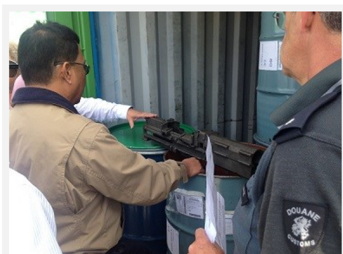
Exercise on Risk Assessment and Containers' Inspections