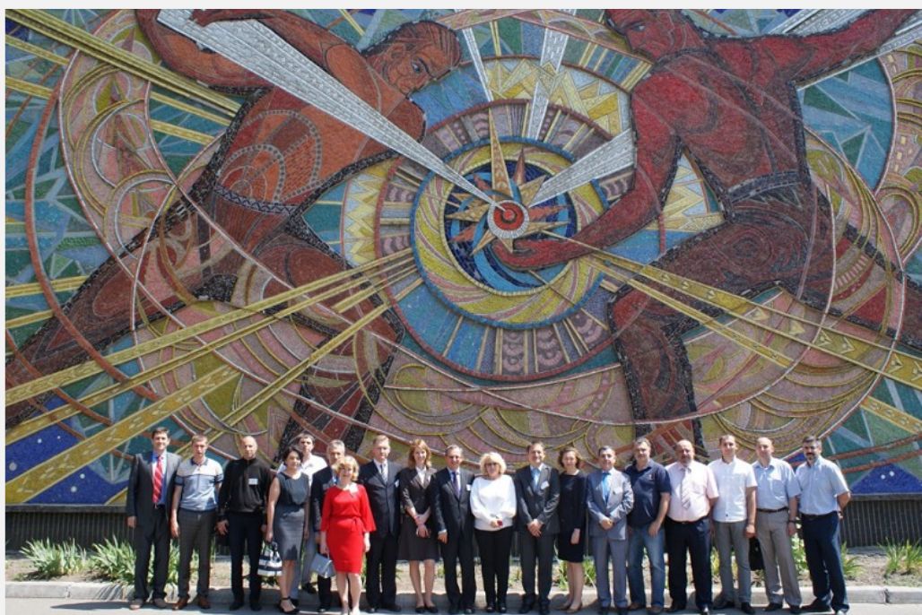
Group Picture in front the "Blacksmiths of modernity". A mosaic on the walls of the Institute of nuclear research, Kiev