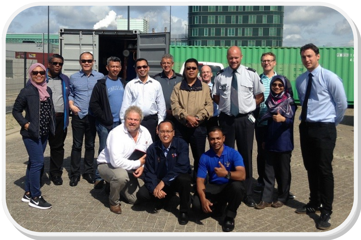
Group Picture of Malaysian Officials at the Study Visit in Rotterdam

During the Study Visit, the Dutch Customs shared their long lasting experience and efficiency tips in STCE and