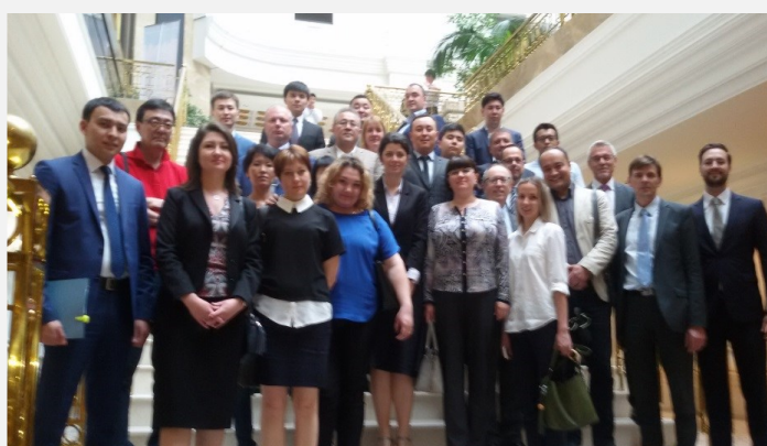
Group Picture of the Almaty Industry Outreach in Kazakhstan