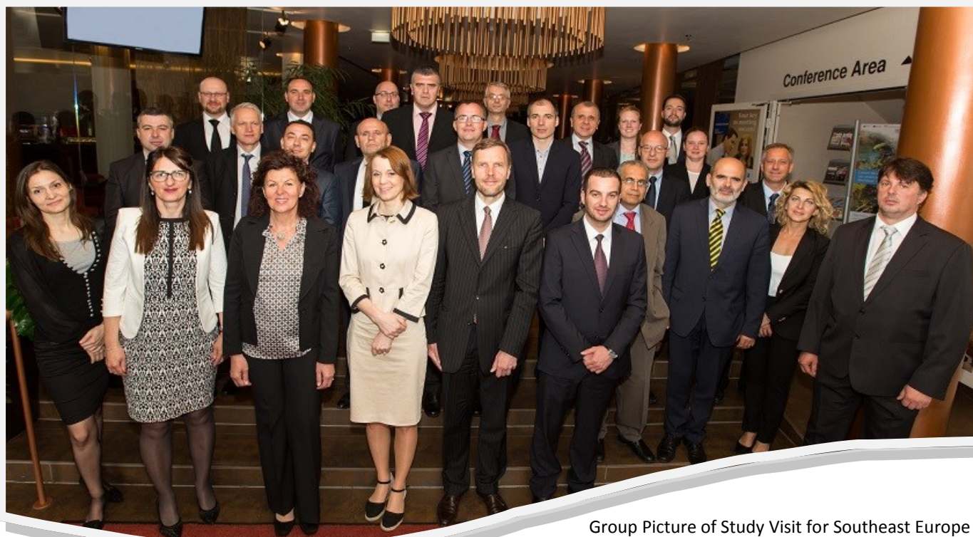
Group Picture of Study Visit for Southeast Europe

nation. Tackling complex problems such as arms diversion requires well-defined and coherent national procedures and a growing regional cooperation among the customs and licensing authorities concerned.