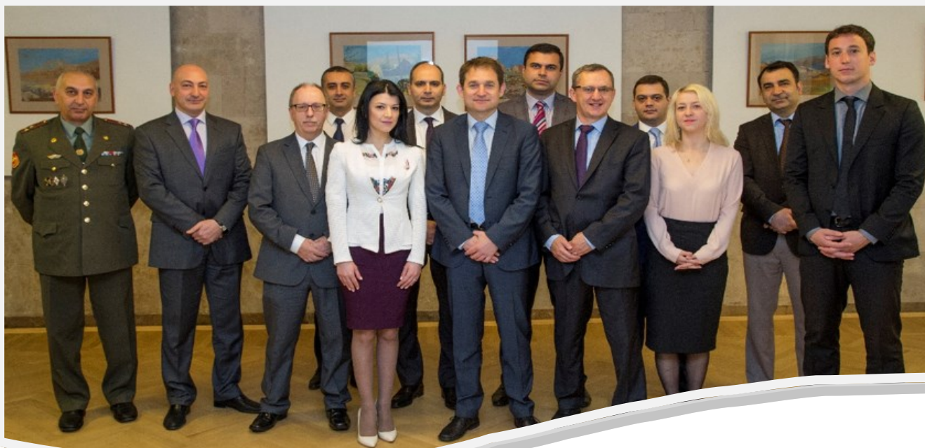
Group Picture of the Second National Licensing Seminar for Armenia

A Training Session for Licensing Officers was organized in the framework of the EU P2P Export Control Programme on Dual-Use Goods on 2-5 May in Phnom Penh, Cambodia.