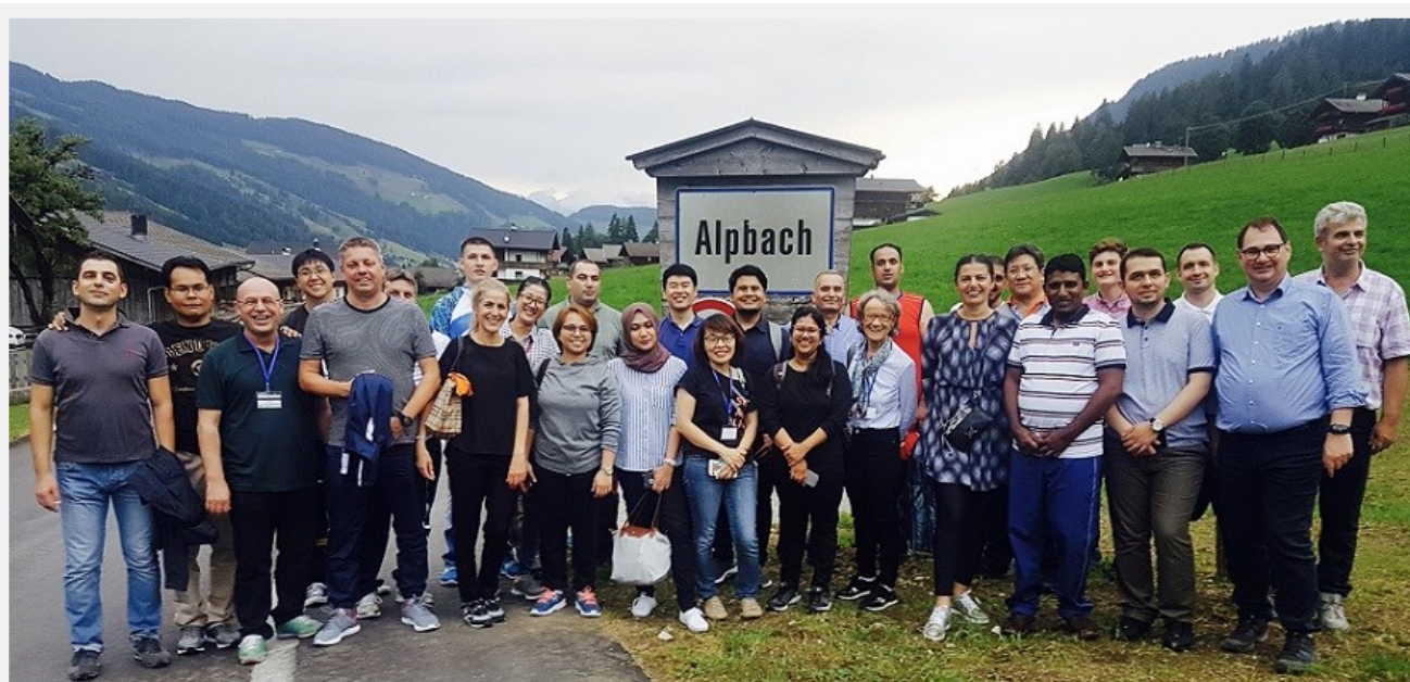
Group Picture of the 3 rd EU Summer University