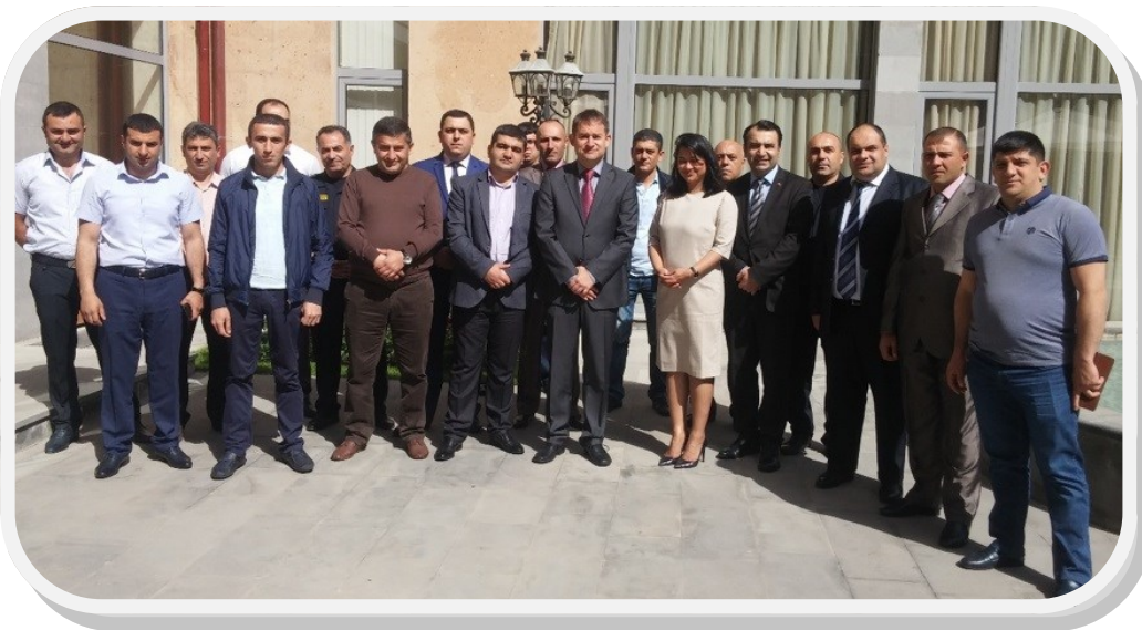
Group Picture of the Third National Training on STCE for Armenia

During the first part of the training, the participants acquired an overall insight into STCE issues with an emphasis on definitions and importance of strategic goods, international legal frameworks and control regimes as well as the main components of a national strategic trade control system and the role of Customs. In the second part of the seminar, the participants were introduced to commodity identification issues. The third part of seminar was dedicated to risk assessment including profiling, targeting and audit. The sessions featured practical exercises enabling thereby open and lively discussions.