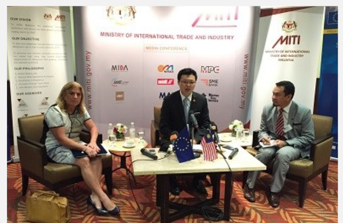
MITI Deputy Minister and EU Ambassador

Singapore's long-established trade control system was followed by the enactment of Malaysia's Strategic Trade Management Act in 2010. The Philippines adopted its own Strategic Trade Management Act in 2016, it recently established a Strategic Trade Management Office and it will soon adopt the Act's Implementing Rules and Regulations. Thailand is scheduled to move forward with the adoption of controls in 2018. Other countries in the region, such as Vietnam, Cambodia, Lao and Myanmar are all at different stages of planning in order to adopt their own laws on export control related aspects.