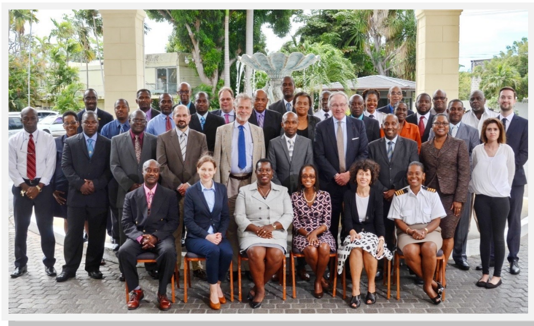
Group Picture of the ATT-OP Ad Hoc Seminar for Barbados

As requested by Barbados, the workshop focused on end-user documentation, brokering, tackling diversion as well as identification of weapons including parts and components thereof. Special attention was also paid to the relevant provisions of the Caribbean Com-