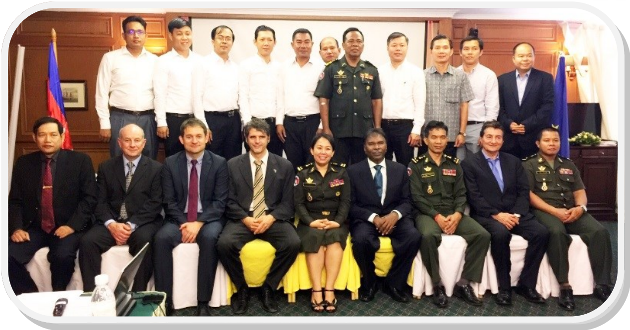
Group Picture of the 2nd Training Session for Licensing Officers in Phnom Penh, Cambodia

The training was attended by approximately 20 representatives from Ministries and agencies that are currently involved in the licensing and control of imports and exports in Cambodia. These Ministries and Agencies may eventually become the backbone to support the inter-agency effort required for implementing and enforcing controls over the export, transit, transshipment, brokering and other activities of relevance to dual-use trade controls. Cambodia has yet to adopt a legal framework to address the proliferation of dual use items, as mandated by UN Security Council Resolution 1540.