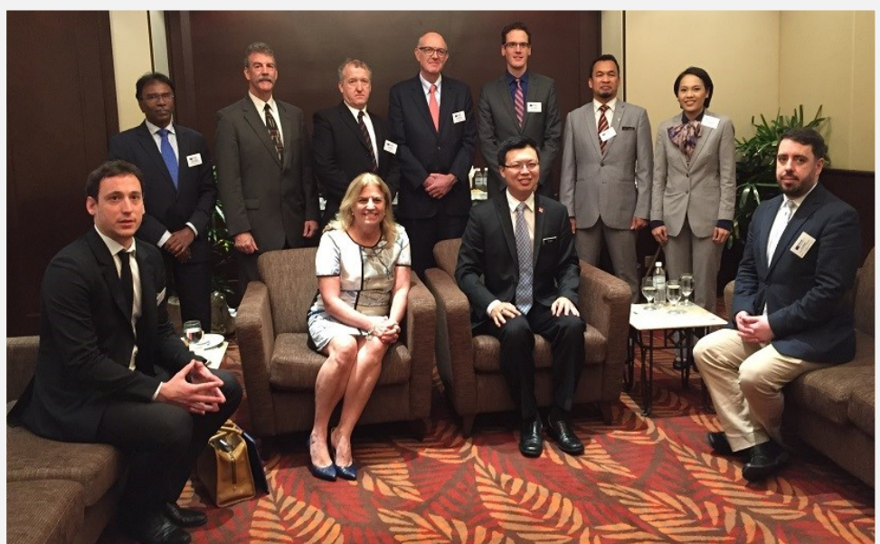
Group Photo with the MITI Deputy Minister and the EU Ambassador