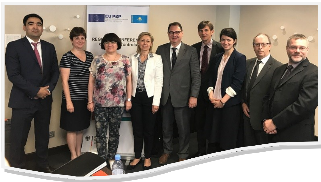
Group Picture of the Regional Conference on Export Controls in Astana

The EU P2P Consortium organized together with the Directorate for Policy and External Trade Regime of the Ministry of Economy of Montenegro and in cooperation with the EXBS programme of the US Department of