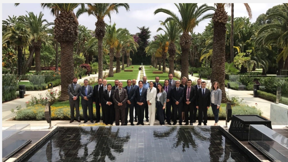
Group Picture of the Regional Workshop for North Africa in Rabat

controls as well as arms diversion in Northern Africa and regional cooperation. Moreover, EU experts informed their colleagues on recent updates of the EU policy.