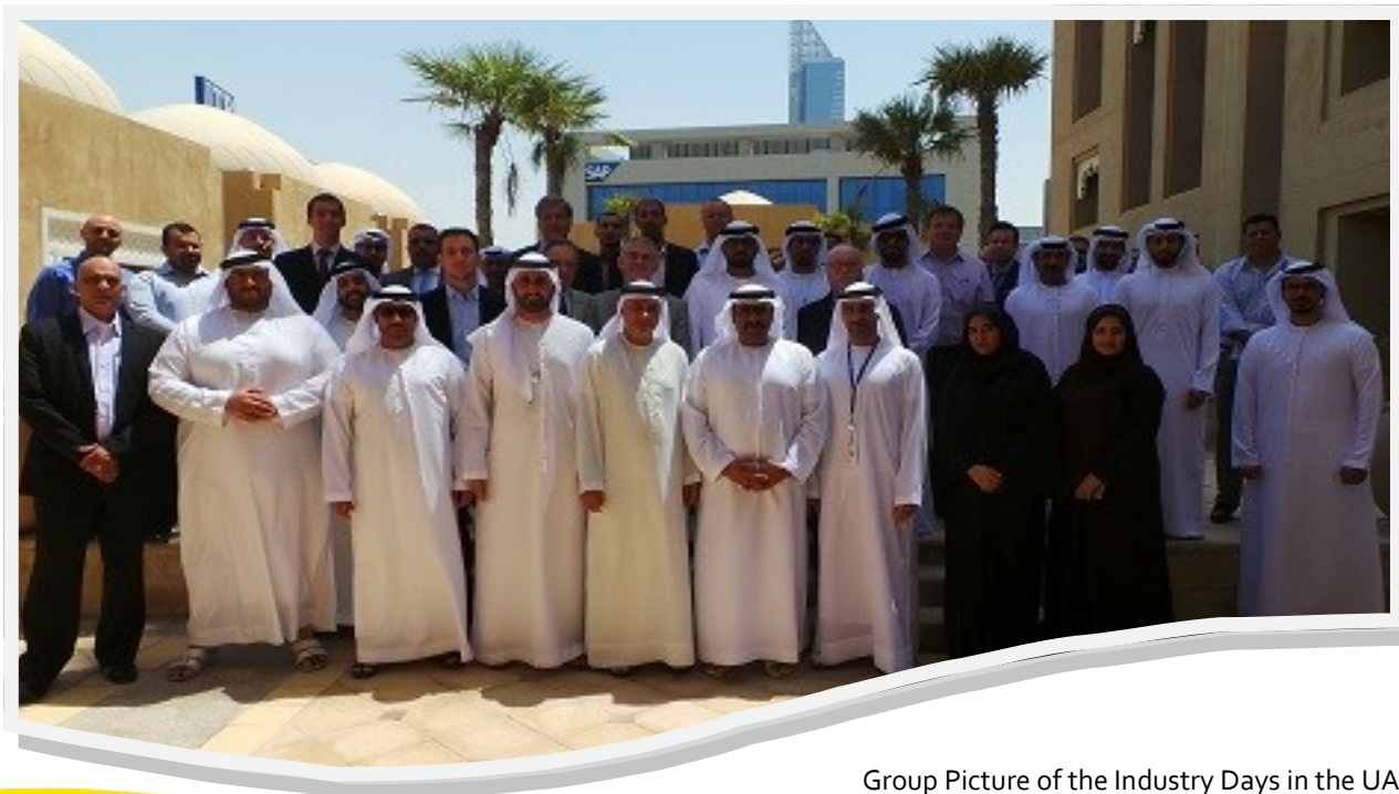
Group Picture of the Industry Days in the UAE

The objectives of these Industry Days were to exchange with the national authorities who manage the international trade of dual-use items and technologies, best practices and perspectives for establishing a strong partnership between public authorities and private sector stakeholders. Boosting the dialogue between authorities and firms originating in dual-use industries is always the first step towards such a partnership.