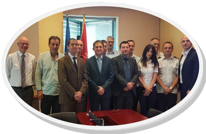
Group Picture of Legal Workshop in Podgorica