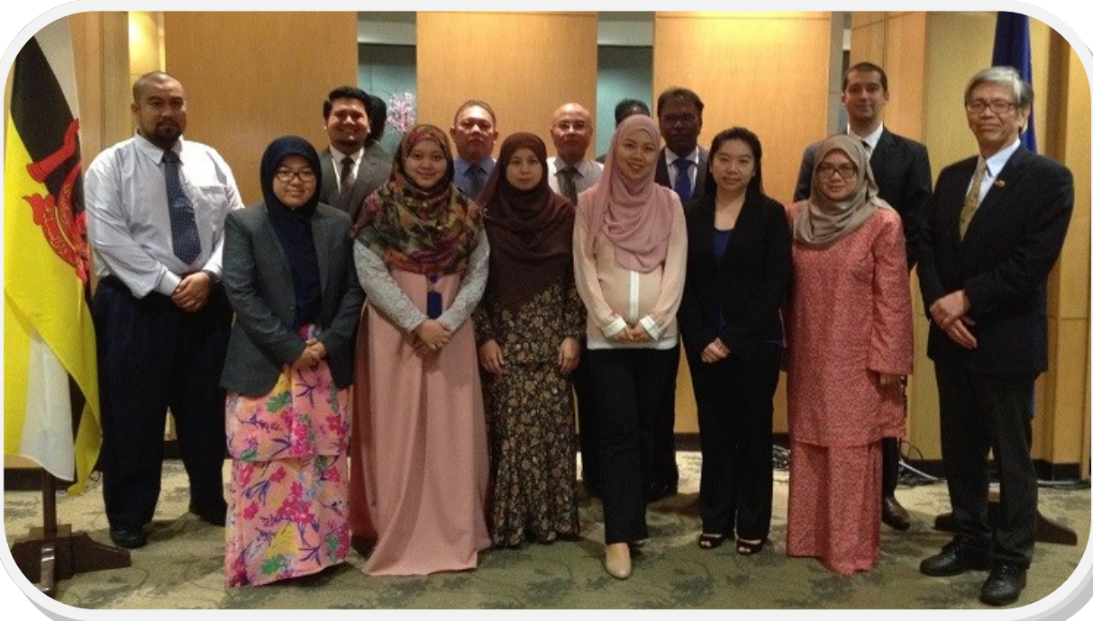
Group Photo of Legal Workshop in Bandar Seri Begawan, Brunei