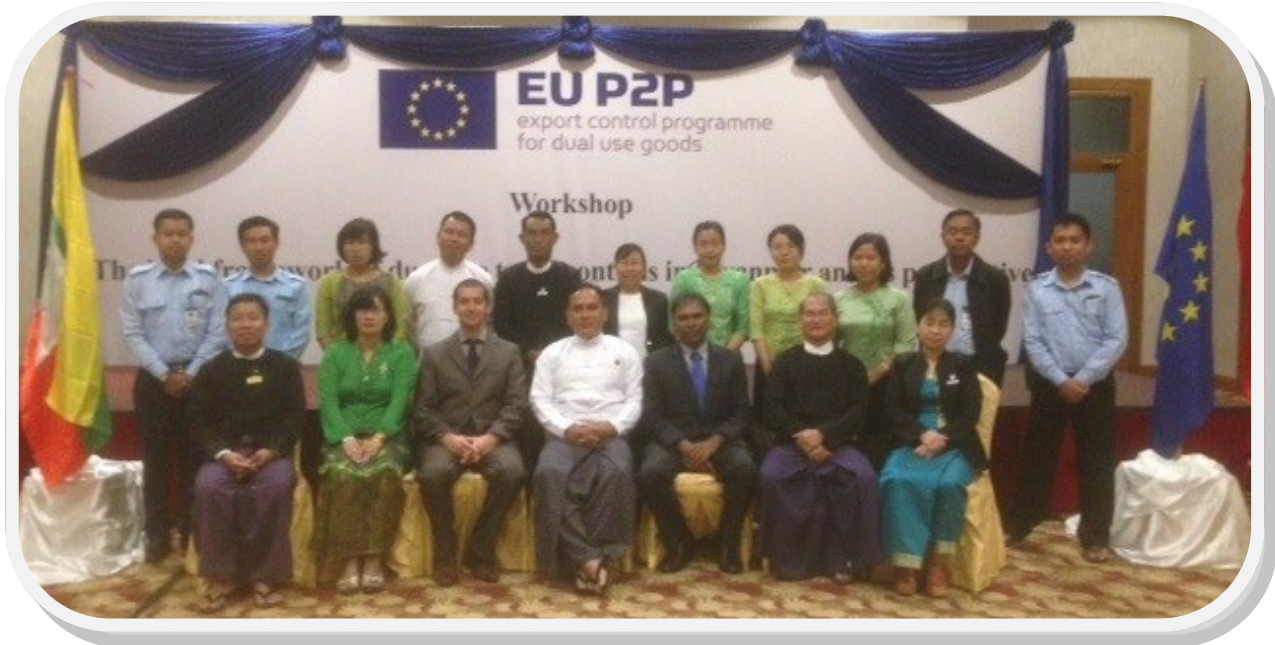
Group Picture of the First Legal Workshop in Myanmar

export control programme for dual use goods