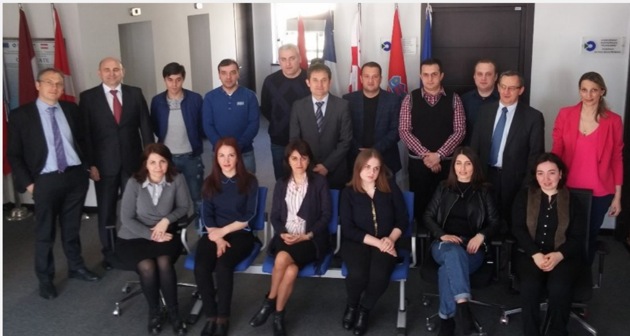
Group Picture of the 2nd National Licensing Seminar for Georgia

In the framework of the EU P2P Programme on Export Controls of Dual-Use Goods, the second national seminar took place on 5-6 April in Tbilisi, Georgia.