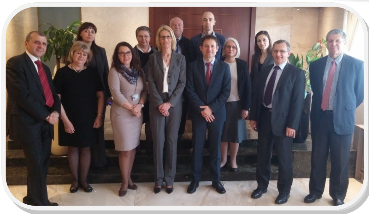
Group Picture of National Industry Day Event for Serbia

the Radiation Protection and Nuclear Safety Agency. The discussions were benefited from the testimony of actors of the European dual-use industry. The main points of discussion concerned channels of communication between public and private actors, as well as challenges and ways to improve such a communication in order to build a trusted relationship between regulators and exporters. This could, ultimately, help a country to implement more effective export controls and comply with national and international obligations.