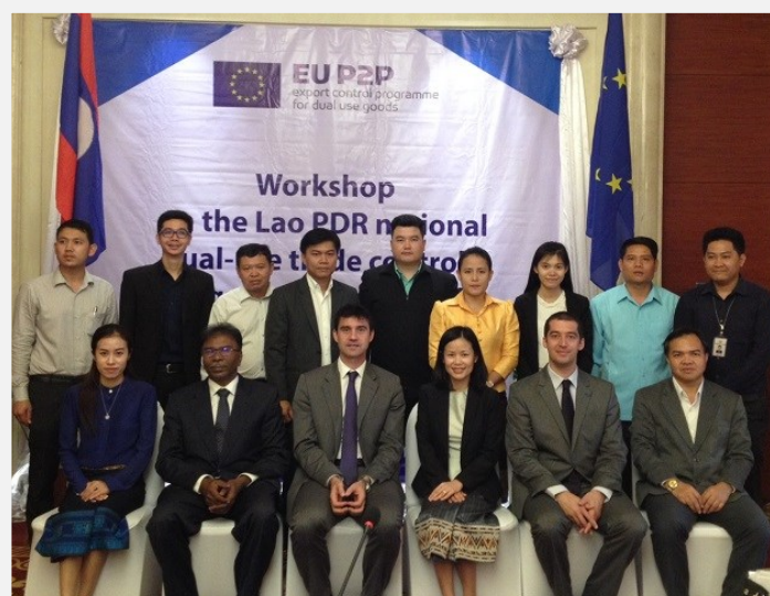
First Legal Workshop in Lao

The implementing consortium for the dual-use outreach programme organised together with the Department of Import and Export of the Ministry of Industry and Commerce and with the participation of the National Focal Point (Ministry of Science and Technology) a workshop on the legal framework of Lao PDR concerning dual-use trade controls, in Vientiane on 24 and 25 May 2017.