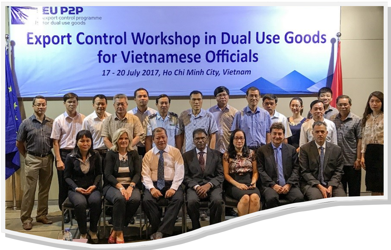
Group Photo Seminar on Export Controls of Dual-Use Goods for Vietnamese Officials

The training was provided by four EU experts working under the EU P2P Export Control Programme for Dual Use Goods. The focus of this training was on four main topics - licensing process, issues concerning transit and