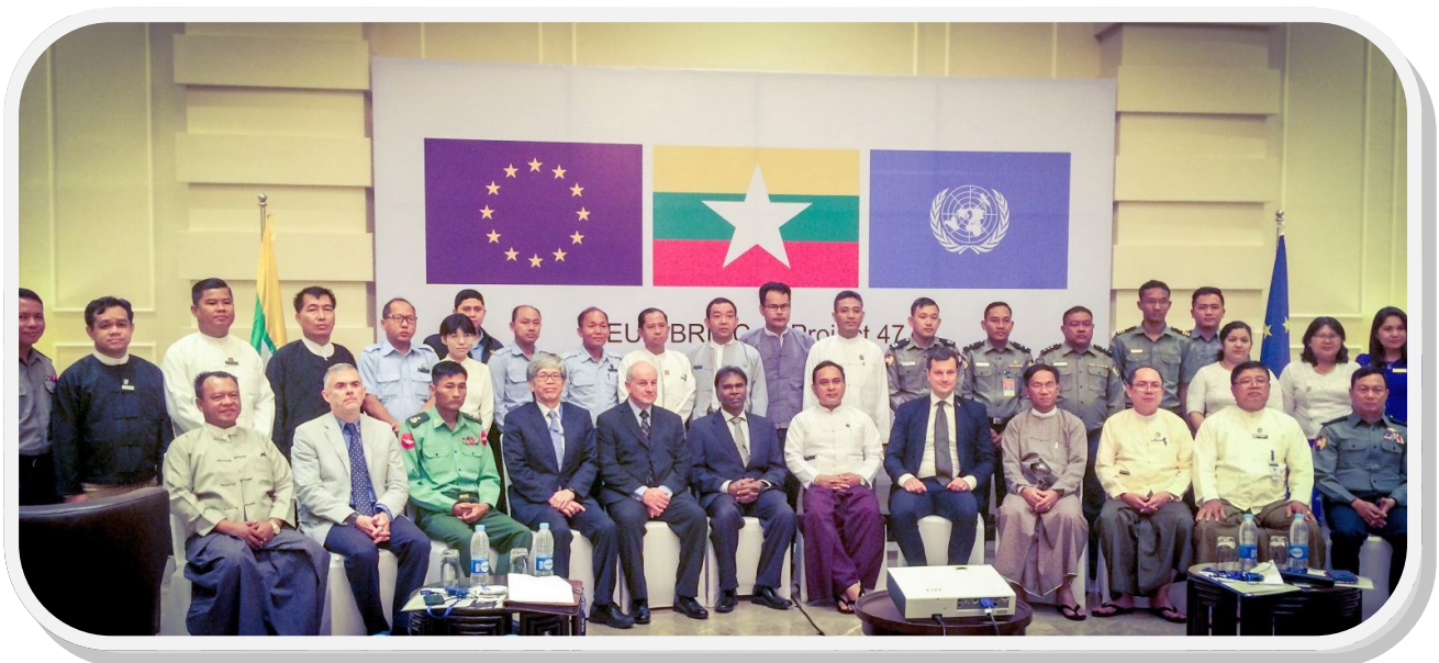
Group Picture of the General Awareness Raising Seminar for Myanmar Officials

The Director General of Department of Trade, Ministry of Commerce, provided the keynote speech at the opening ceremony of the seminar. The First Secretary at the Delegation of the EU Mission in Myanmar, representing the EU, provided the opening remarks. Thirty attendees representing various stakeholders of the Myanmar Government participated in the seminar. In addition to these participants, the opening ceremony was also attended by twenty three other senior level officials representing important Ministries and Agencies in Myanmar. The presence of these senior officials is indicative of the importance Myanmar places in learning