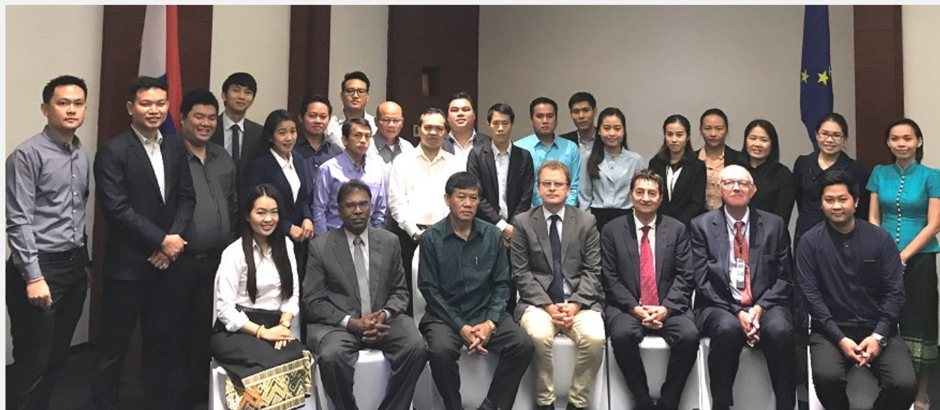
Group Picture of the Awareness Raising Seminar