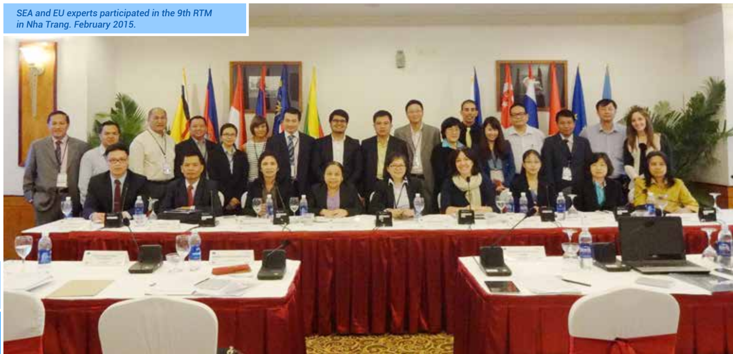
SEA and EU experts participated in the 9th RTM in Nha Trang. February 2015.

The first workshop for the preparation of National Action Plan to mitigate CBRN risks for Vietnam took place on 7-8 May 2015. The two-day workshop was opened by representatives from: the Vietnam Agency for Radiation and Nuclear Safety (VARANS), Ministry of Science and Technology (MoST); the OPCW; and UNICRI. The first workshop for the National Action Plan included an overview and discussion of the risk scenarios in each of the areas dealt with – chemical, biological, radiological and nuclear – in addition to a presentation of a Needs Assessment Questionnaire, a key part of the Centres of Excellence methodology. National subject matter experts from Vietnam worked with their international counterparts to consider the best ways of incorporating the identified needs and priorities into the respective National Action Plans.