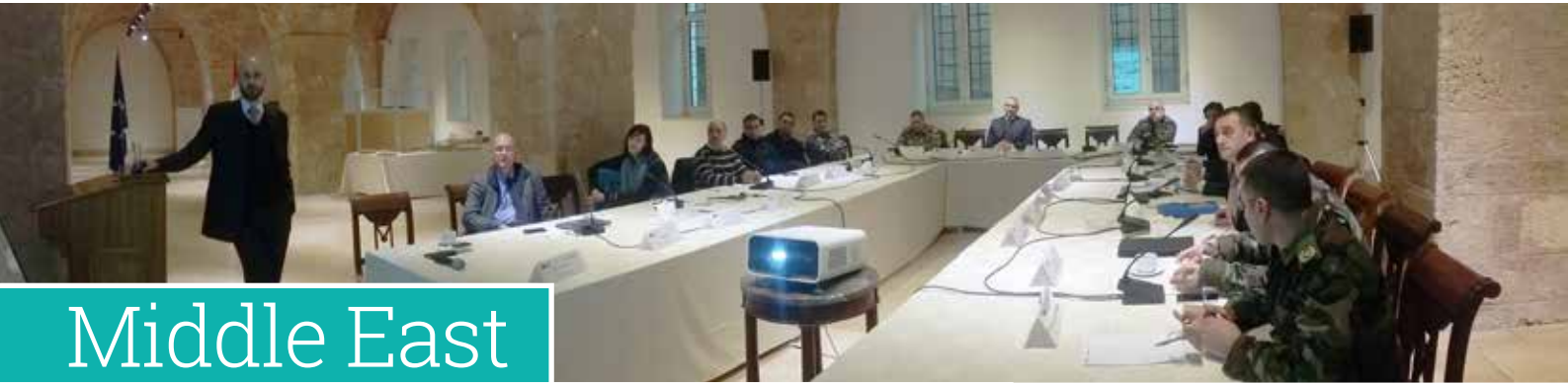
Lebanese defence delegates attended P34 CBRN awareness training course at the Presidency of Council of Ministers in Beirut. February 2015.