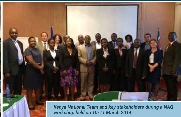
Kenya National Team and key stakeholders during a NAQ workshop held on 10-11 March 2014.