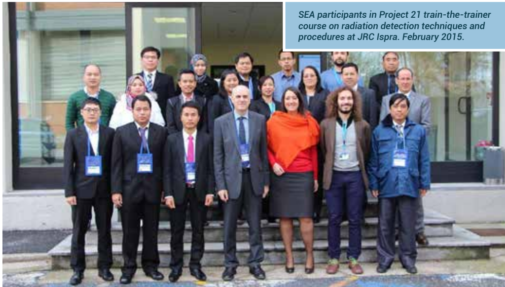
SEA participants in Project 21 train-the-trainer course on radiation detection techniques and procedures at JRC Ispra. February 2015.