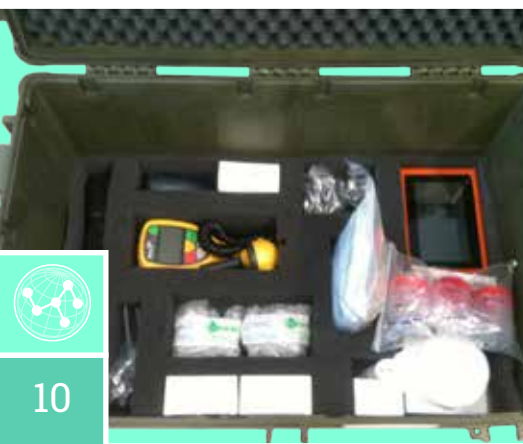
Demo kit used in P34 CBRN awareness training course for MIE countries.

As a follow-up, an action plan for weapons of mass destruction counter terrorism has been recently drafted by the Iraqi stakeholders under the leadership of the Iraqi National Monitoring Authority.