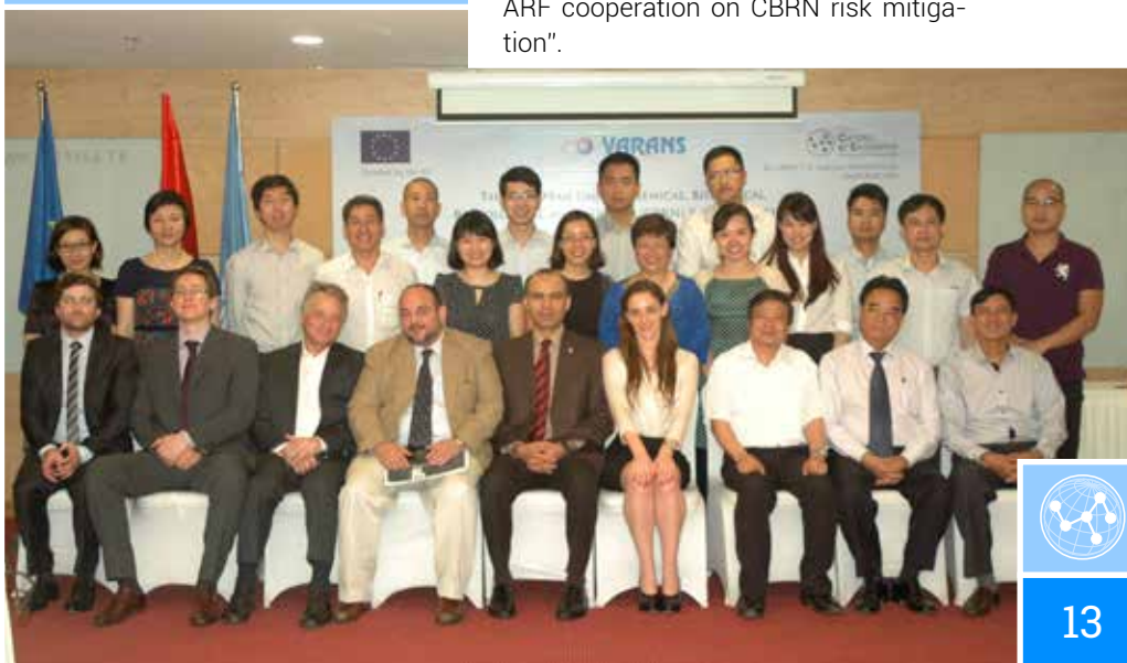
National experts gathered in Hanoi to work on the National Action Plan. May 2015.

European External Action Service Visit to the SEA Secretariat 27 February 2015 Manila, Philippines