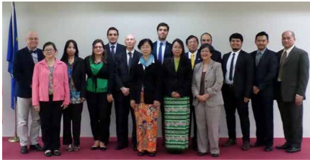
Participants in Project 6 final conference at the SEA Regional Secretariat (Malacanang Palace) in Manila. December 2014.

In 2000, the United Nations Millennium Declaration emphasised the importance of protecting future generations by protecting the environment: "We must spare no effort to free all of humanity, and above all our children and grandchildren, from the threat of living on a planet irredeemably spoilt by human activities, and whose resources would no longer be sufficient for their needs". In this view, one of the top concerns of contemporary societies is the management of waste and, in particular, due to the multifaceted implications and specific environmental problems that it creates, the management of hazardous