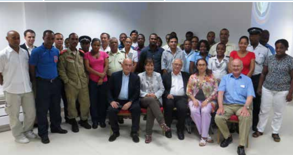
Representatives from various Seychelles national organisations participated in Project 13 CBRN seminar in Victoria. May 2015.

of the participating countries, the European CBRNE Centre at Umeå University (Sweden), with the assistance of Swedish Defence Research Agency, designed a standardised training course for the three branches of first responders: law enforcement, fire and rescue services, and emergency medical services. The two-step training course in CBRN incidents was carried out in Bosnia and Herzegovina and Serbia (March-April 2014). A total of 40 participants from Albania, Bosnia and Herzegovina, Croatia, Georgia, Former Yugoslav Republic of Macedonia, Moldova, Montenegro and Serbia attended the courses which included modules focusing on: CBRN substances, civil emergency planning, and the identification and management of CBRN incident scenes, in addition to exercises based on possible CBRN incident scenarios. A study visit took place in May in Stockholm, Sweden. National Experts from the participating countries received lectures by Swedish authorities and national organisations involved in CBRN preparedness and response. The visit included a guided tour of Södersjukhuset emergency hospital which has specific CBRN expertise.