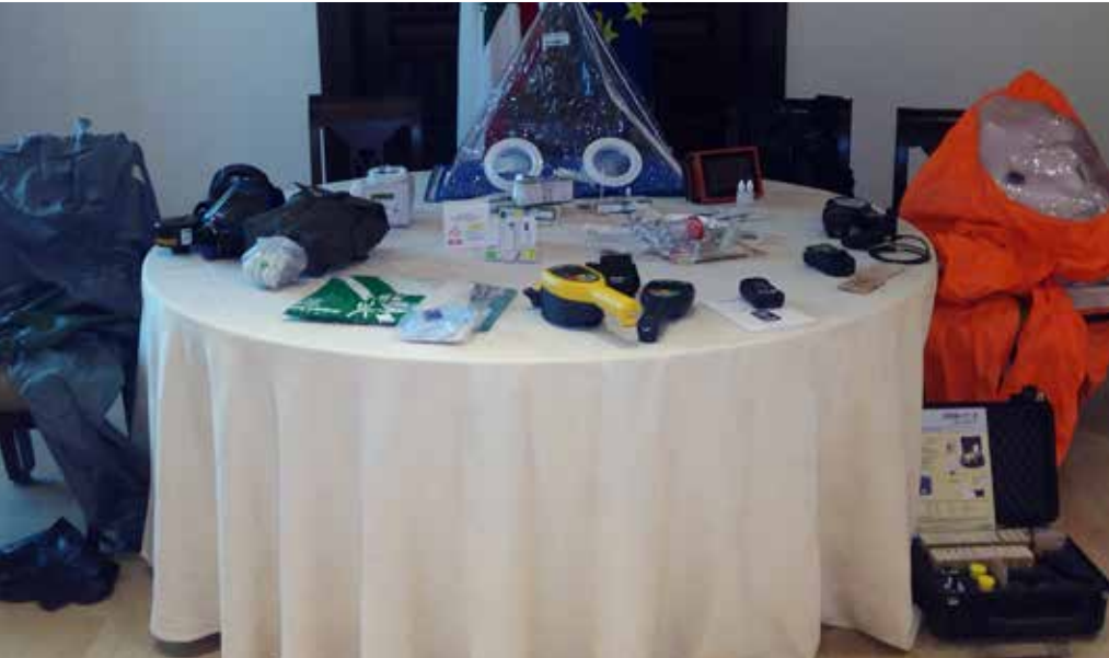
CBRN protective clothing will be delivered to partner countries in the framework of P34.