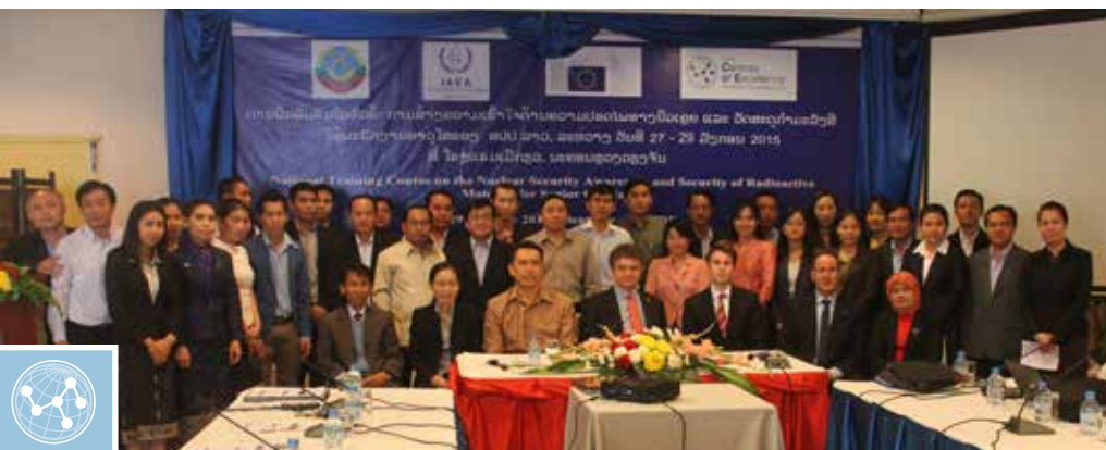
Project 28 provided training on security of radiological and nuclear materials to representative of Lao PDR ministries and national agencies. January 2015.