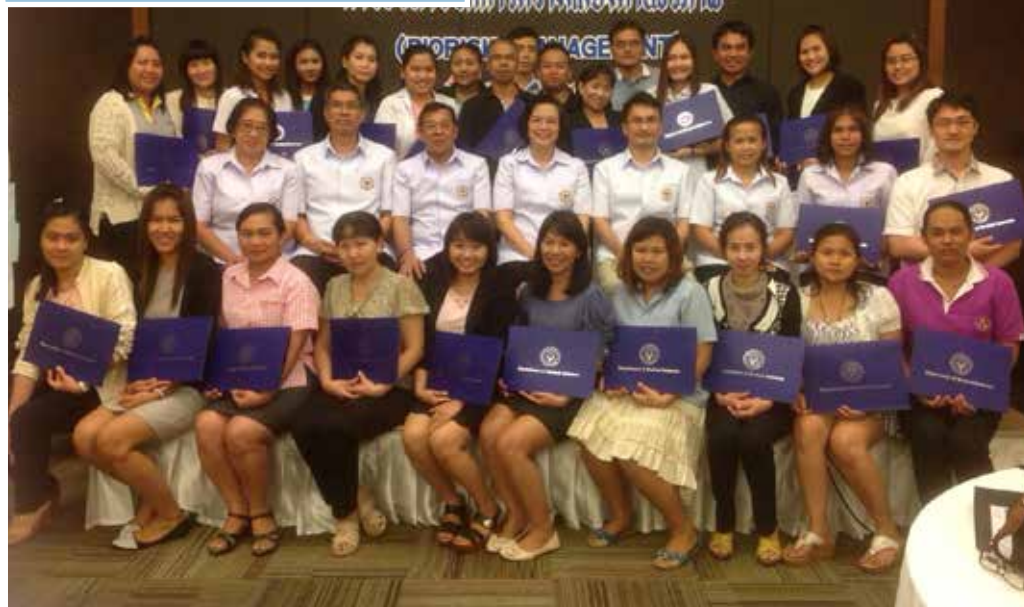
Project 27 certified trainers delivered training in biorisk management to microbiology technicians and scientists. Thailand, May 2015.

knowledge on BRM to all hospital laboratories across Thailand. Consequently the Department of Medical Sciences allocated budget to all 14 Regional Medical Sciences Centres for organising the BRM training in hospitals. These activities are a definite step forward for the country in biosafety and biosecurity concerns.