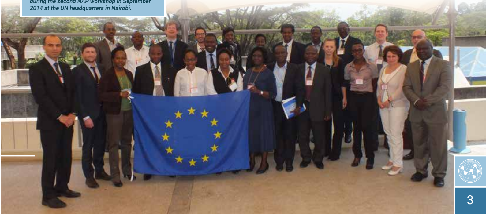
The Kenyan National Team and key stakeholders during the second NAP workshop in September 2014 at the UN headquarters in Nairobi.

The Ministry of Health, which hosts the CBRN CoE initiative, coordinated the meetings by sending official invitation letters to stakeholder institutions to participate in the National Action Plan workshops. A total of three successful stakeholder workshops were held with the support of the EU and UNICRI. UNICRI experts worked closely with the Kenyan stakeholders and CBRN experts to develop the final NAP document which addressed the gaps identified during the NAQ exercise. The NAP meetings were also attended by representatives from international organisations such as the OPCW, WHO and IAEA.