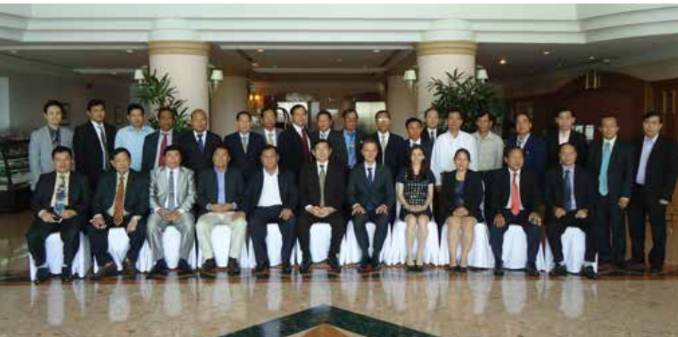
Cambodian experts worked on CBRN legislation with Project 8 implementers. Phnom Pen, Jun 2015.

In an initial assessment phase, data on the national legal framework addressing CBRN risk mitigation was collected and analysed. The need for new or amended legislation in the CBRN sectors in each country were further debated during a series of three technical assistance visits to Cambodia, Lao PDR, Malaysia and the Philippines (November 2013, April 2014, November 2014). In addition, international experts from VERTIC (lead implementing partner of the project) have continued to work with national experts on the drafting of legislation for CBRN security and amendments of existing legislation.