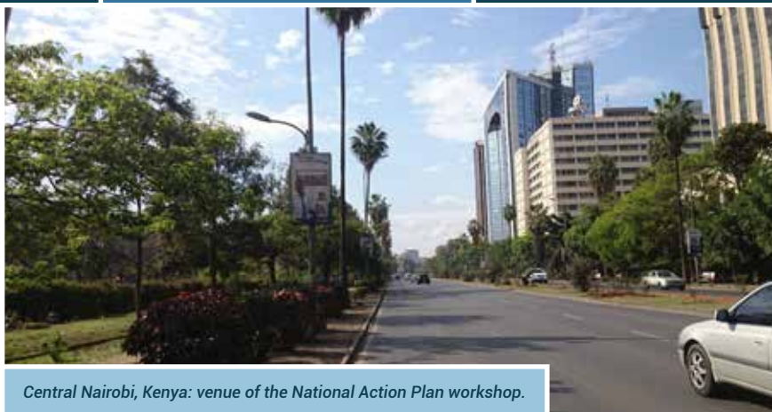
Central Nairobi, Kenya: venue of the National Action Plan workshop.