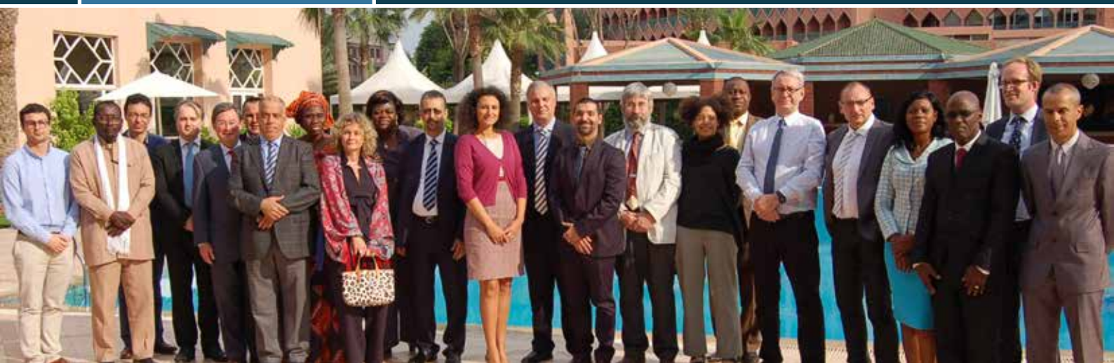
AAF country representatives discussed upcoming activities of Project 41 on Chemical high risk facilities during the kick-off meeting in Marrakech. April 2015.