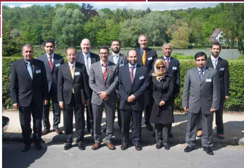
2 nd Round table meeting for Gulf Cooperation Council countries region in Genval – Belgium (June 2015).